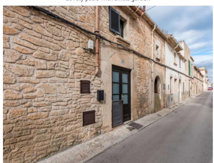
Exterior view of the town house