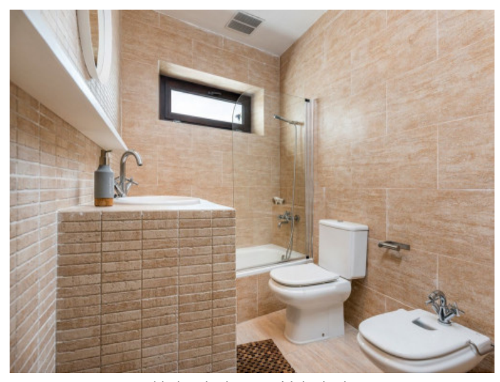
Modern bathroom with bathtub