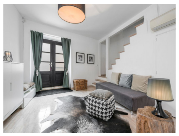
Cozy living area