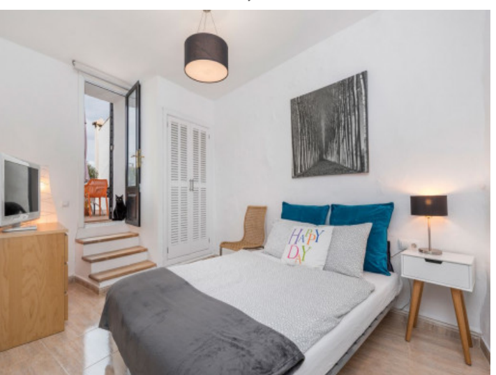
Bedroom with direct terrace access