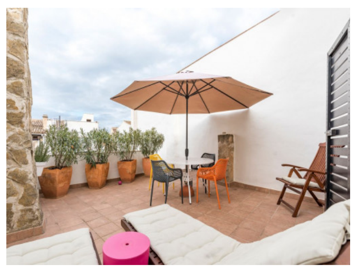
Large terrace on the upper floor