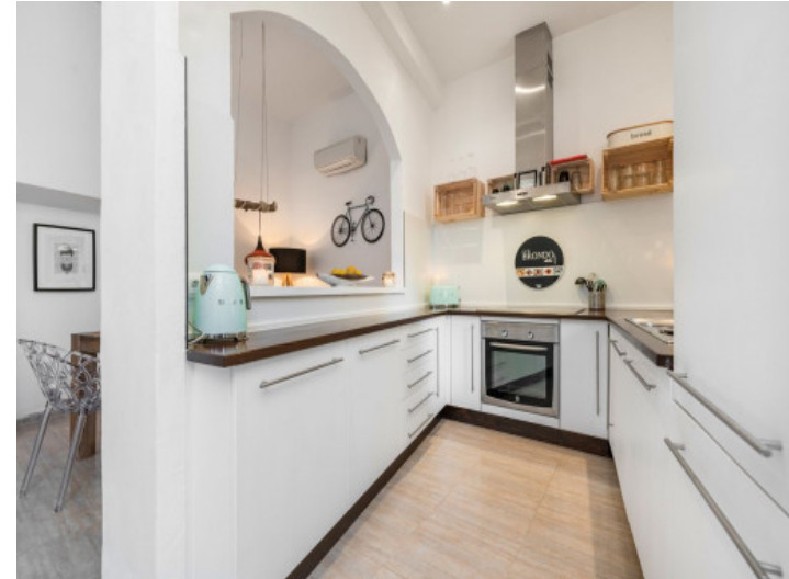
Modern and fully fitted kitchen