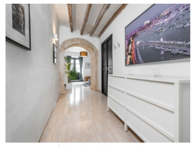
Corridor with authentic stone arch

All information is correct to the best of our knowledge. Errors and prior sale excepted. This prospectus is purely for information purposes. Only the notarized deed of sale is legally binding.