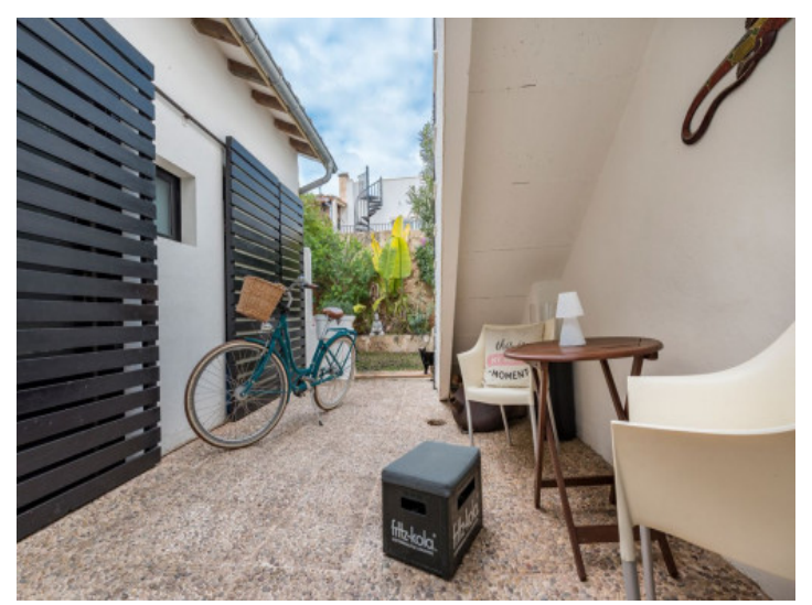
Lovely patio with small garden