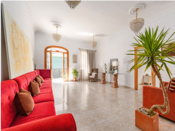
Large entrance hall