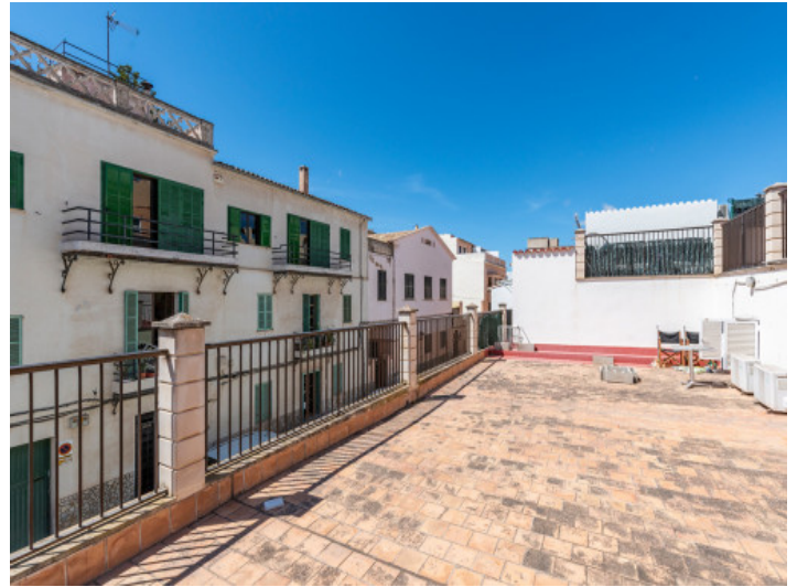
Lower part of the roof terrace