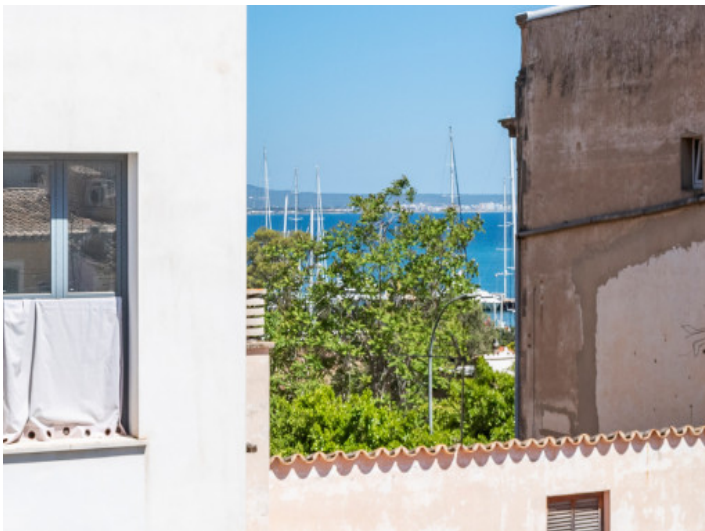
Partial sea views