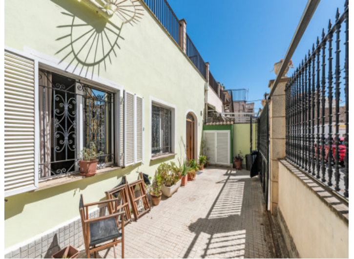
Entrance and front terrace