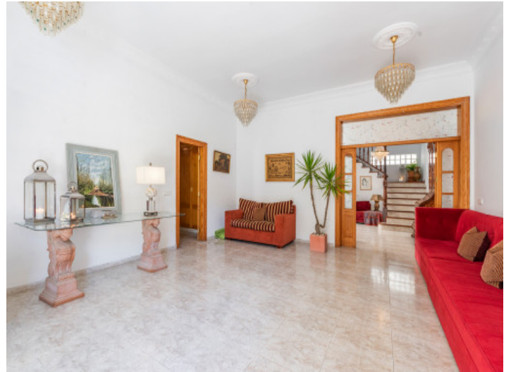
Access to the living area