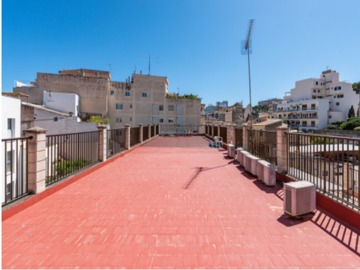
Extensive roof terrace