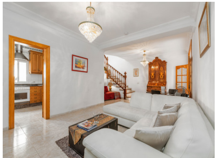
Living area and access to the kitchen

All information is correct to the best of our knowledge. Errors and prior sale excepted. This prospectus is purely for information purposes. Only the notarized deed of sale is legally binding.