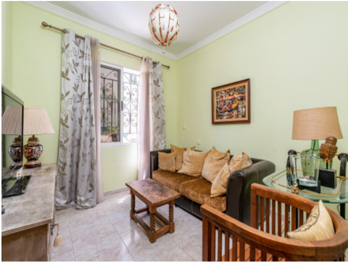
Further living room