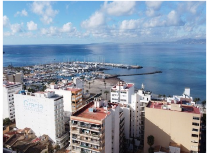
View over S'Arenal