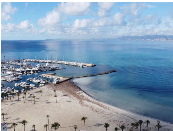
View to the beach

All information is correct to the best of our knowledge. Errors and prior sale excepted. This prospectus is purely for information purposes. Only the notarized deed of sale is legally binding.