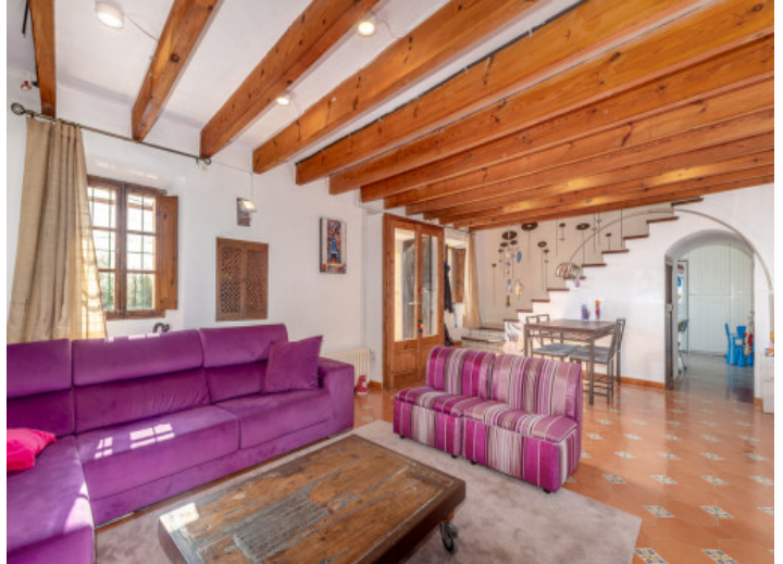
Spacious entrance and living area Dining area in the kitchen All information is correct to the best of our knowledge. Errors and prior sale excepted. This prospectus is purely for information purposes. Only the notarized deed of sale is legally binding.

PORTA MALLORQUINA • THERESIENSTR.: 81, 80333 MUNICH TEL. +34 971 698 242 • INFO@PORTAMALLORQUINA.COM