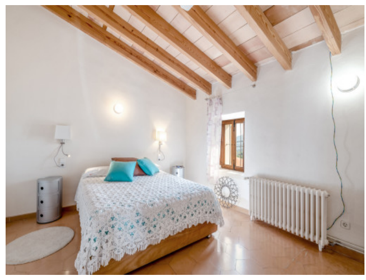
Bedroom with natural light