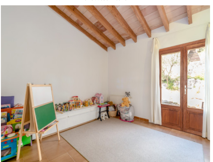
Bedroom with access to the outside