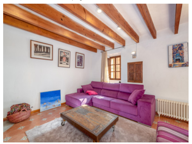
Beautiful living area with wooden ceiling beams