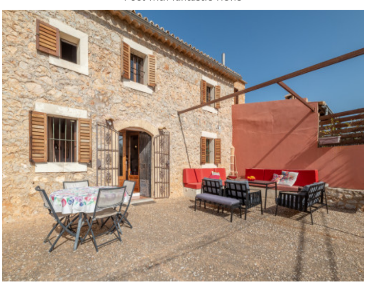
Front terrace and access to the house