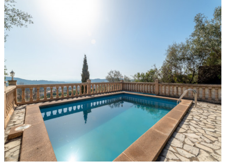
Pool with fantastic views

PORTA MALLORQUINA® Your home. Our passion.