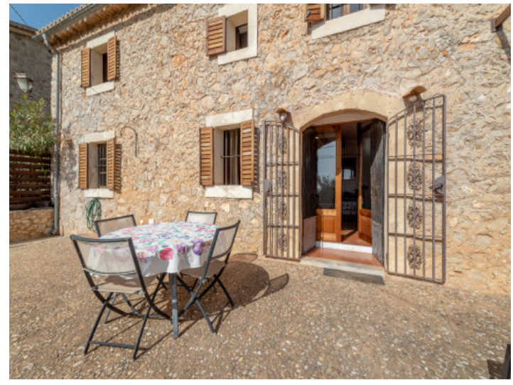
Entrance to the house