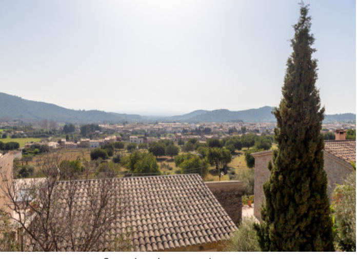
Sweeping views over the town