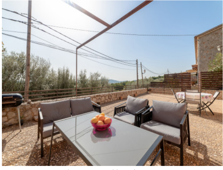
Large terrace with seating area