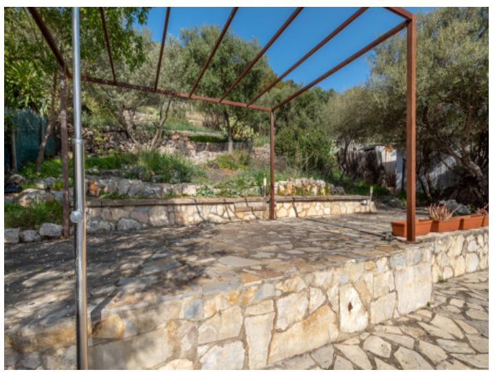
Garden with terraces