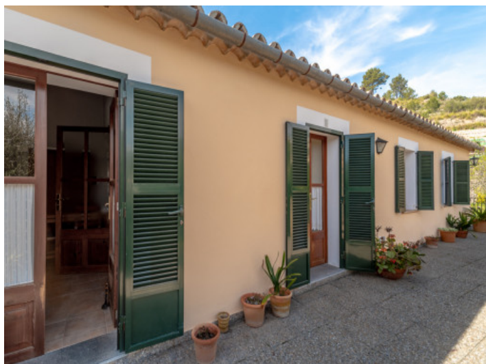
View of the terrace