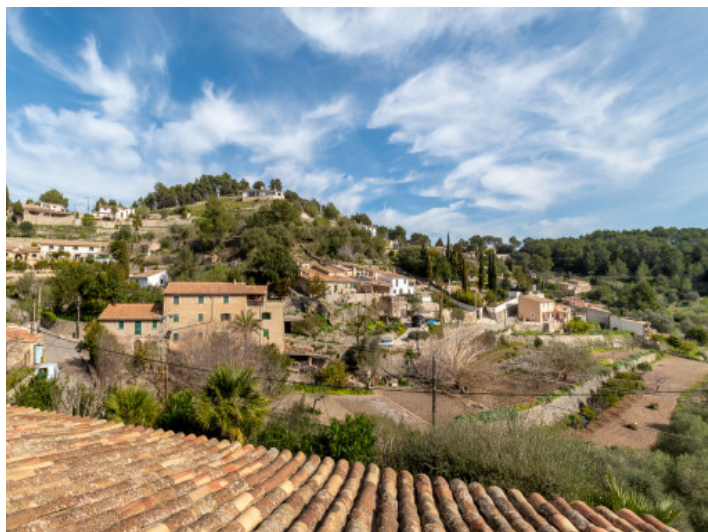
View to Galilea