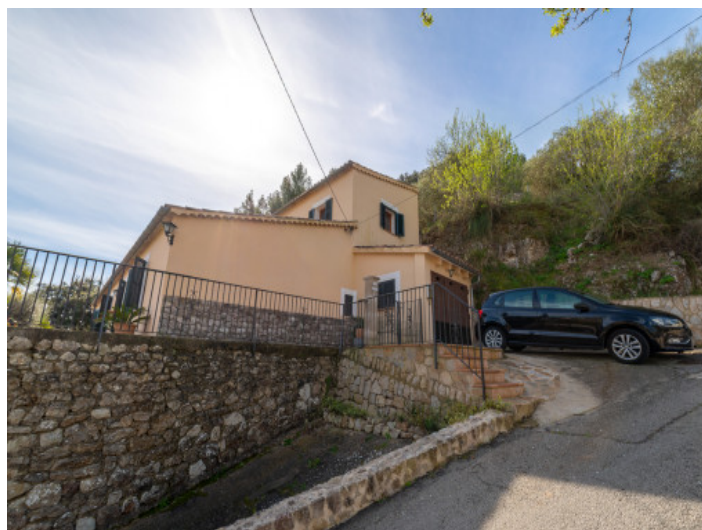
Access to the house

All information is correct to the best of our knowledge. Errors and prior sale excepted. This prospectus is purely for information purposes. Only the notarized deed of sale is legally binding.