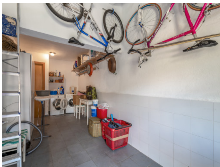
Spacious utility room