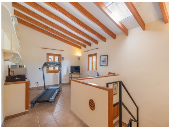
Upper floor / living area