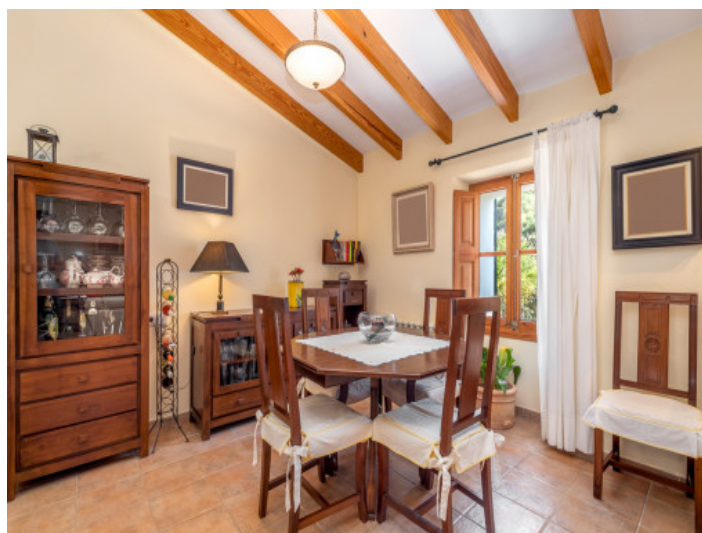
View to the dining area