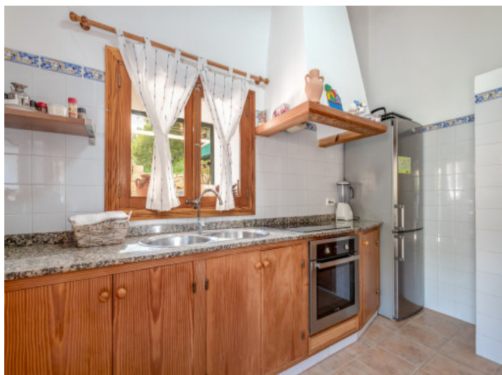
Rustic, wooden kitchen