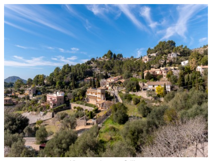
View over the town Galilea