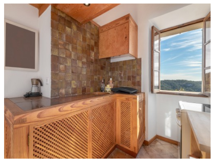
Small kitchen on the lower level