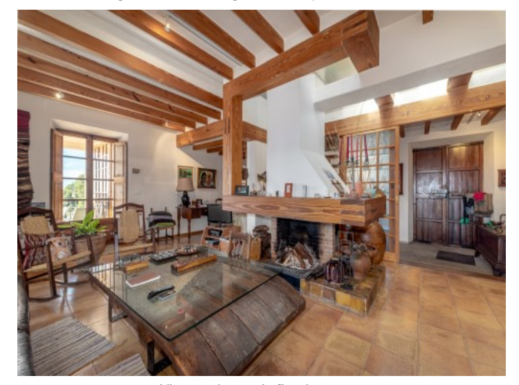
View to the rustic fireplace area