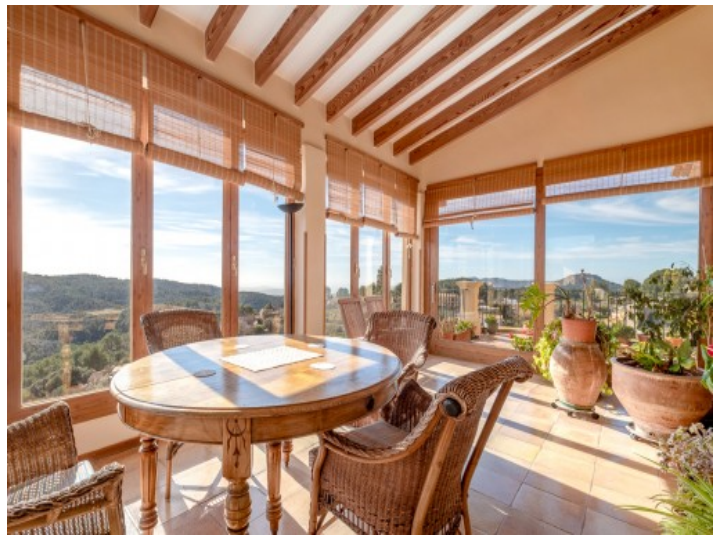
Lightflooded wintergarden with panoramic views