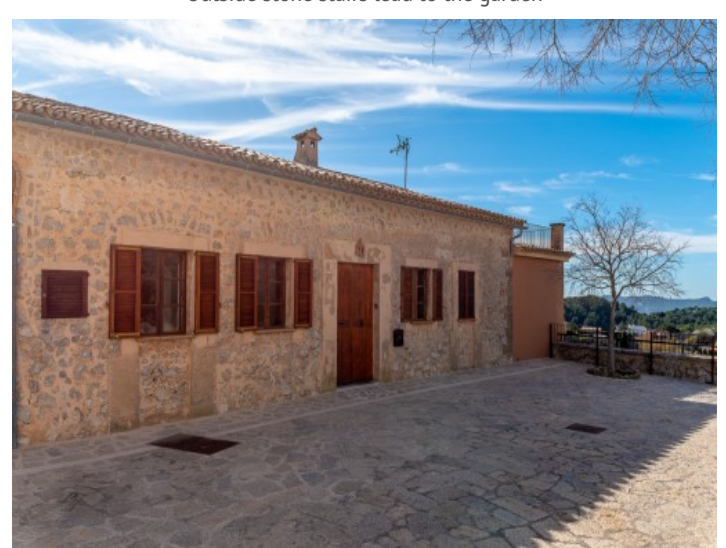
Front view and entrance to the house