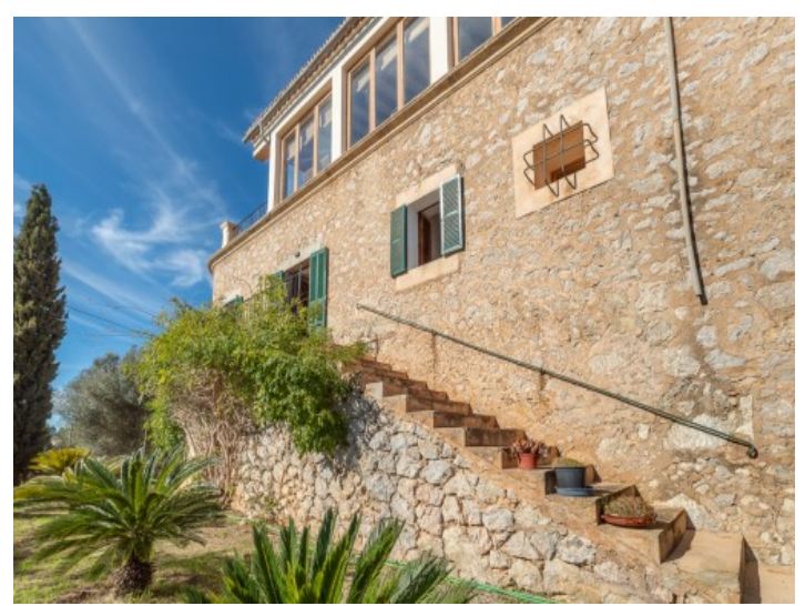
Outside stone stairs lead to the garden