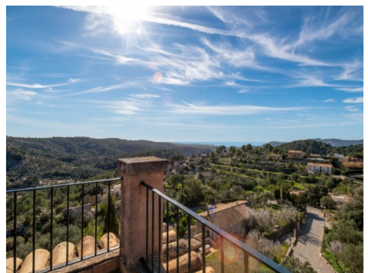
Terrace with fantastic sweeping views