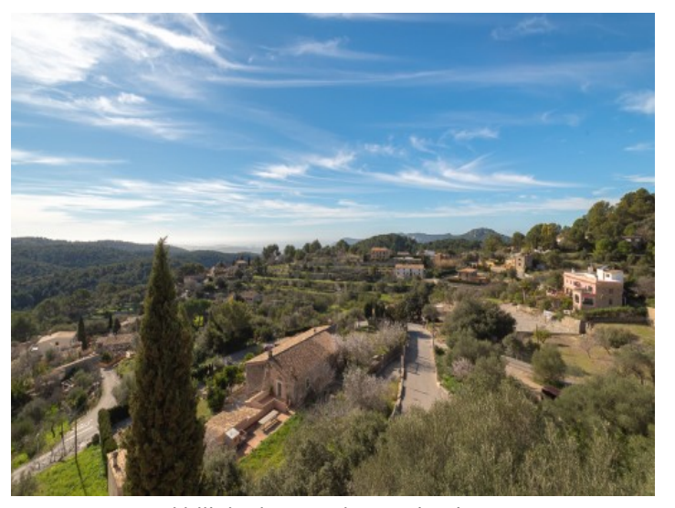
Idyllic landscape and mountains views

All information is correct to the best of our knowledge. Errors and prior sale excepted. This prospectus is purely for information purposes. Only the notarized deed of sale is legally binding.