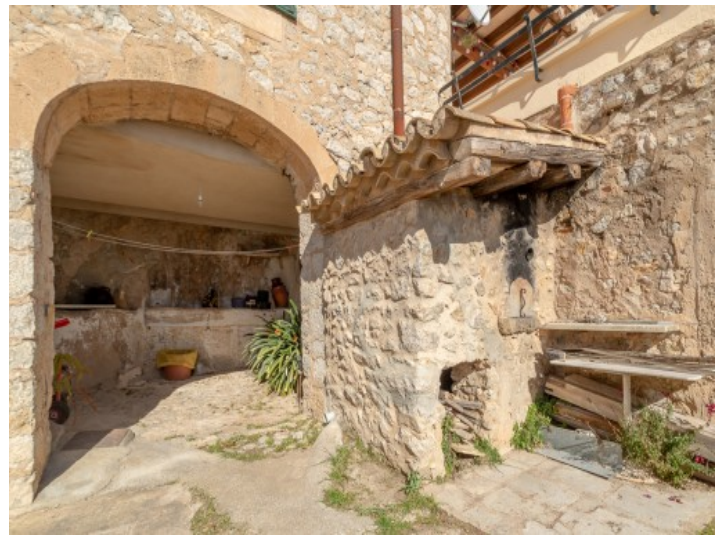
Outdoor area with stone oven