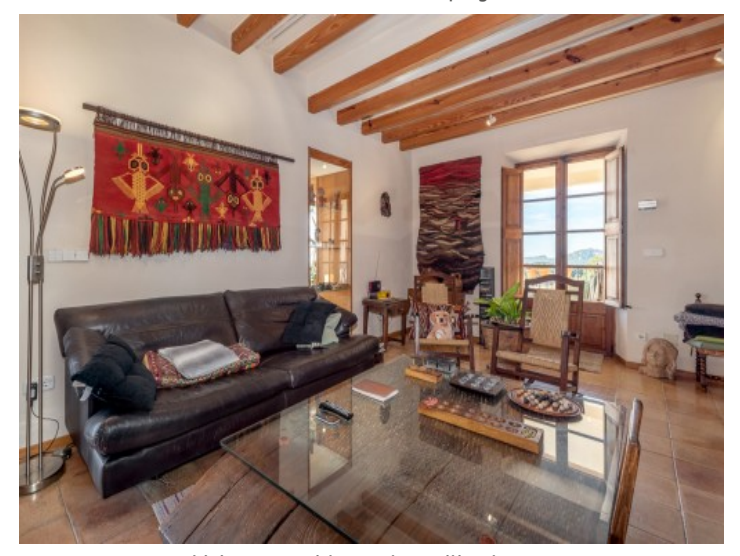
Living area with wooden ceiling beams