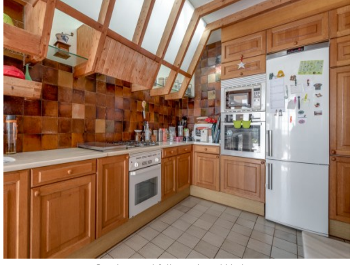
Spacious and fully equipped kitchen

All information is correct to the best of our knowledge. Errors and prior sale excepted. This prospectus is purely for information purposes. Only the notarized deed of sale is legally binding.