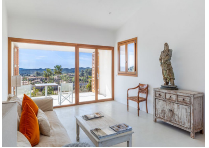
Separate living area

PORTA MALLORQUINA® Your home. Our passion.