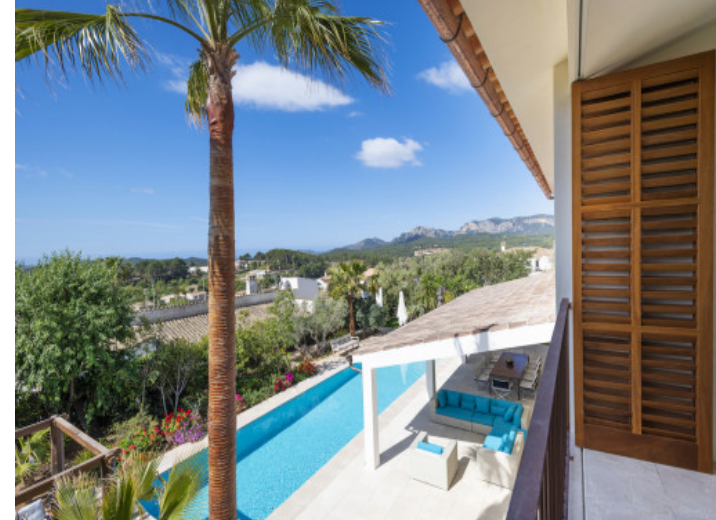
Pool view from the balcony