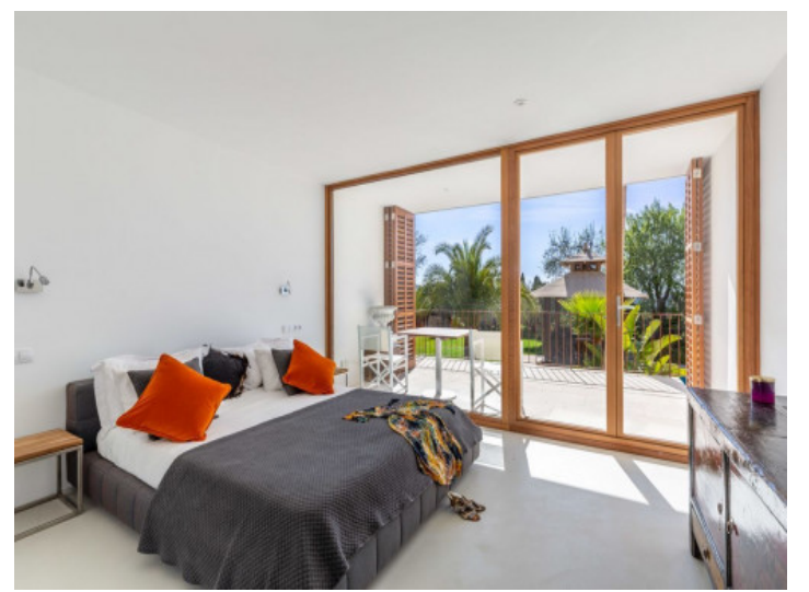
One of 5 bedrooms Access to the garden All information is correct to the best of our knowledge. Errors and prior sale excepted. This prospectus is purely for information purposes. Only the notarized deed of sale is legally binding.

PORTA MALLORQUINA • THERESIENSTR.: 81, 80333 MUNICH TEL. +34 971 698 242 • INFO@PORTAMALLORQUINA.COM