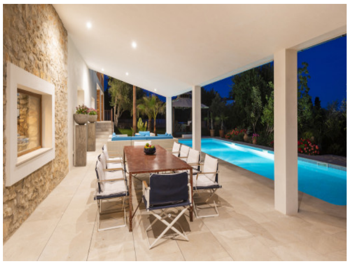
Covered dining area