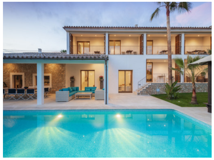
Exterior view of the villa

PORTA MALLORQUINA® Your home. Our passion.