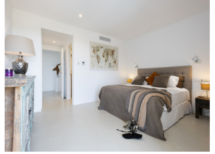
One of 5 bedrooms

PORTA MALLORQUINA® Your home. Our passion.