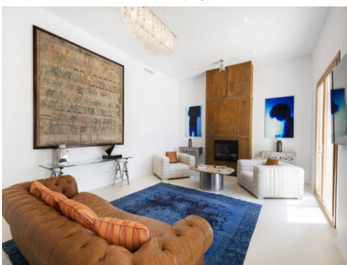
Large living area