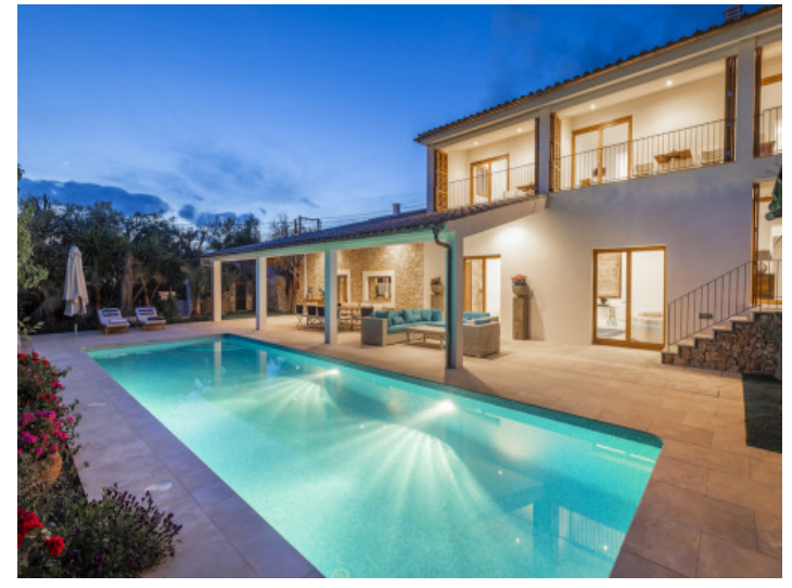
The pool by night