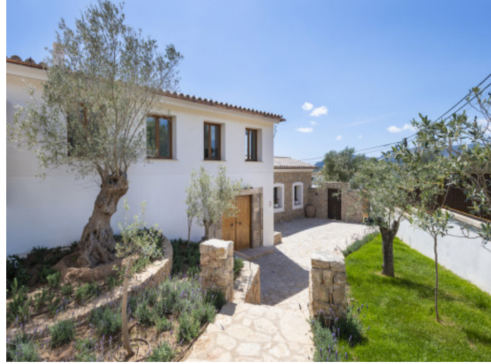
Exterior view of the villa Access and entrance area All information is correct to the best of our knowledge. Errors and prior sale excepted. This prospectus is purely for information purposes. Only the notarized deed of sale is legally binding.

PORTA MALLORQUINA • THERESIENSTR.: 81, 80333 MUNICH TEL. +34 971 698 242 • INFO@PORTAMALLORQUINA.COM