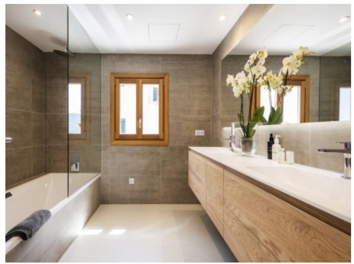
Bathroom with bath tub