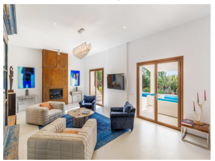
Alternative view of the living area Open kitchen and dining area All information is correct to the best of our knowledge. Errors and prior sale excepted. This prospectus is purely for information purposes. Only the notarized deed of sale is legally binding.

PORTA MALLORQUINA • THERESIENSTR.: 81, 80333 MUNICH TEL. +34 971 698 242 • INFO@PORTAMALLORQUINA.COM