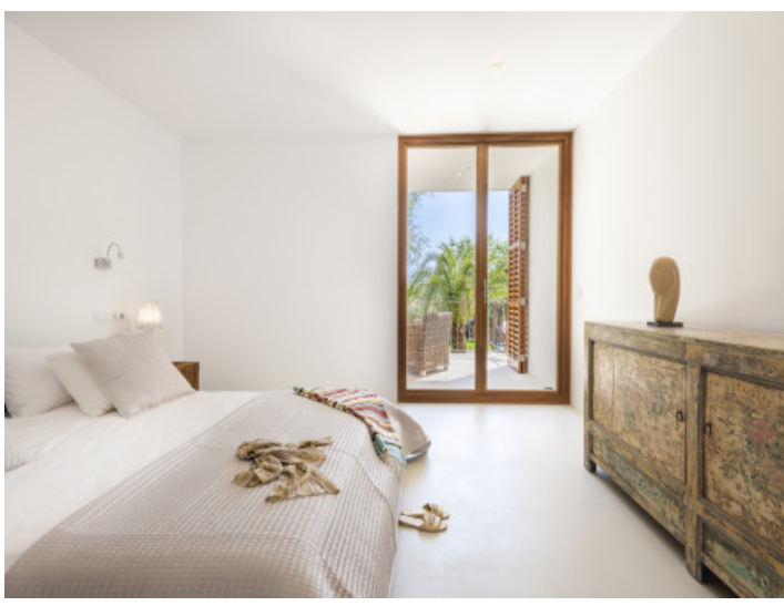
One of 5 bedrooms