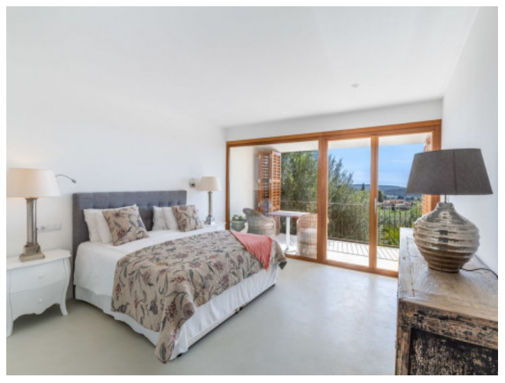
One of 5 bedrooms