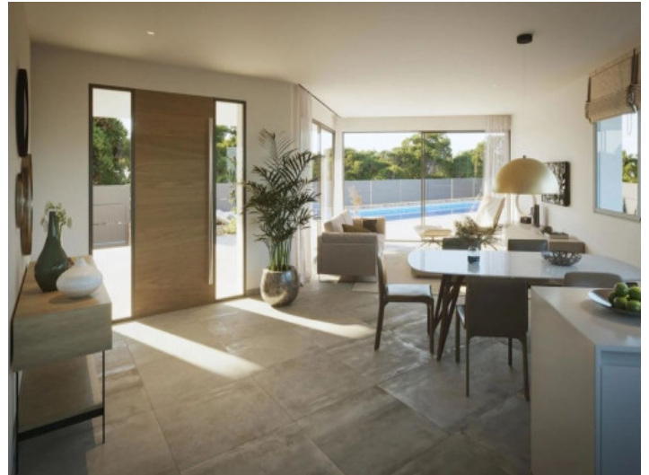
View to the entrance area