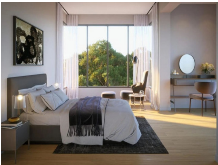
Noble master bedroom