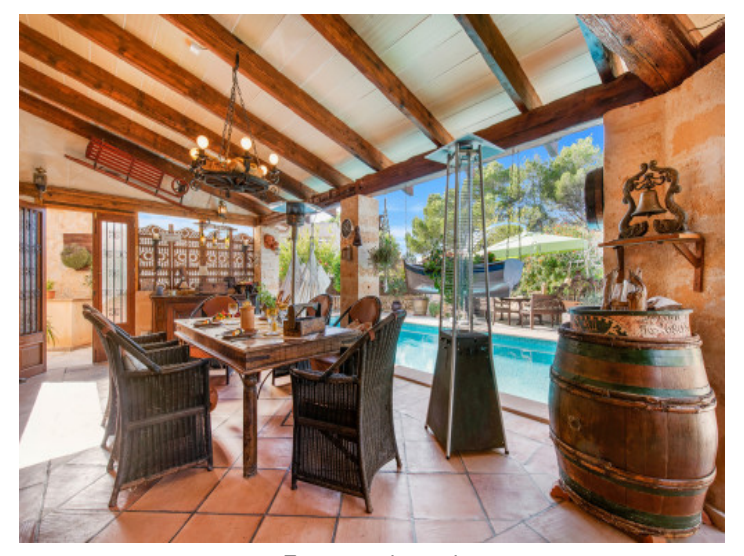
Terrace at the pool