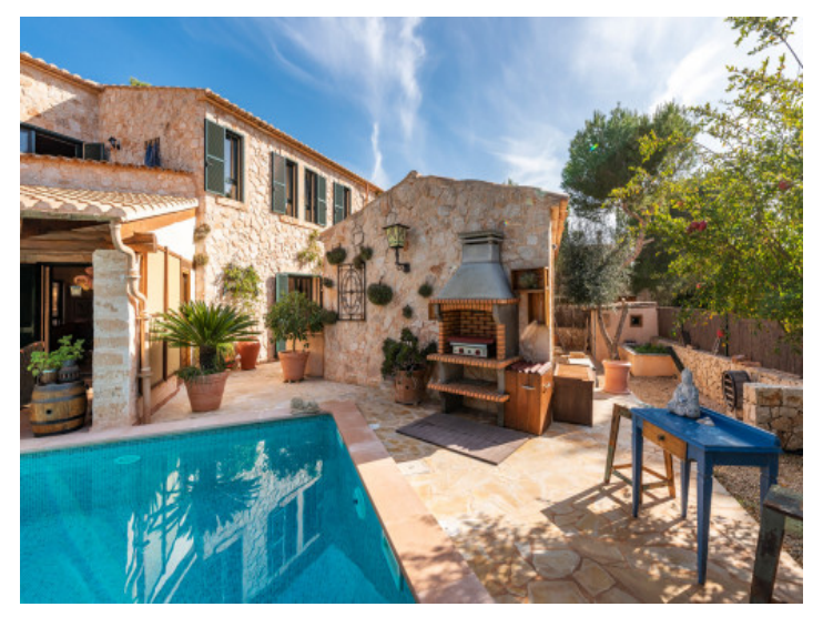
Sunny terrace and barbecue area