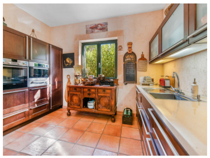
Alternative view of the kitchen