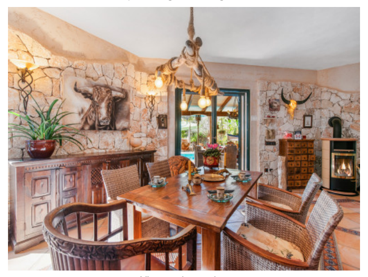
View to the garden