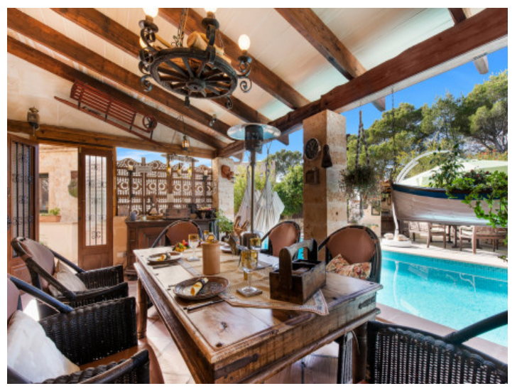
Exterior dining area

All information is correct to the best of our knowledge. Errors and prior sale excepted. This prospectus is purely for information purposes. Only the notarized deed of sale is legally binding.