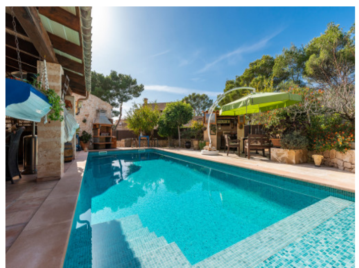
View to the outdoor kitchen