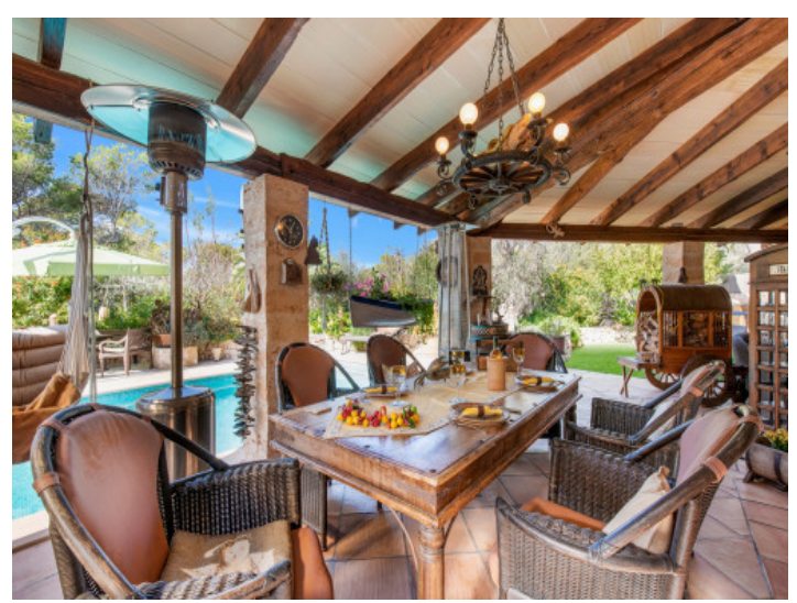
Covered dining area