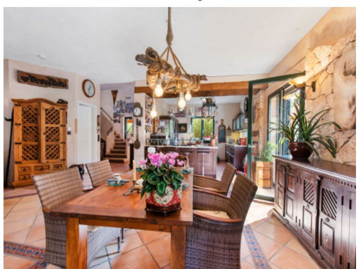
Rustic dining area