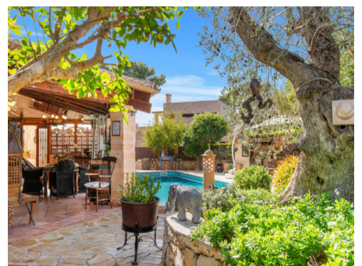
Garden and terrace