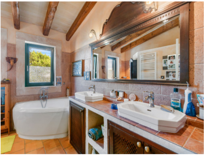
Bathroom with bath tub