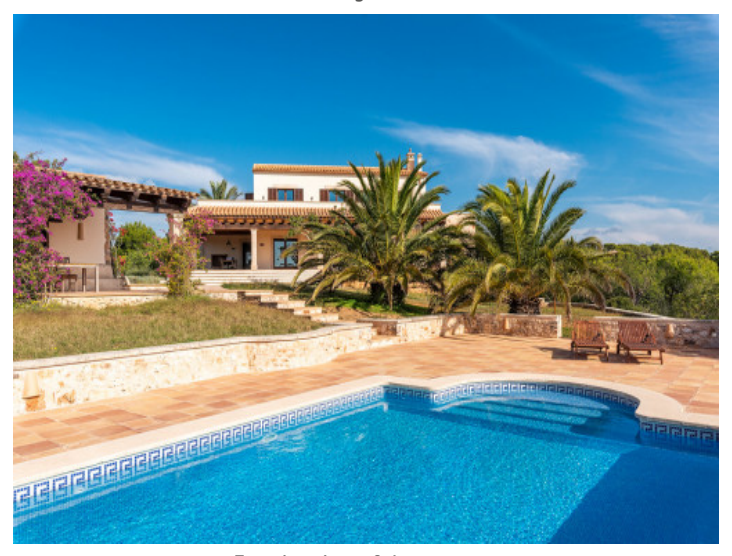
Exterior view of the property