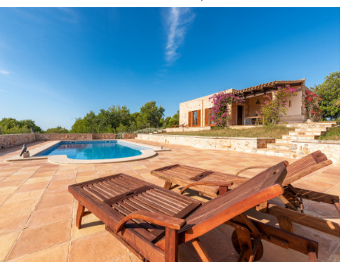
View to the guest house