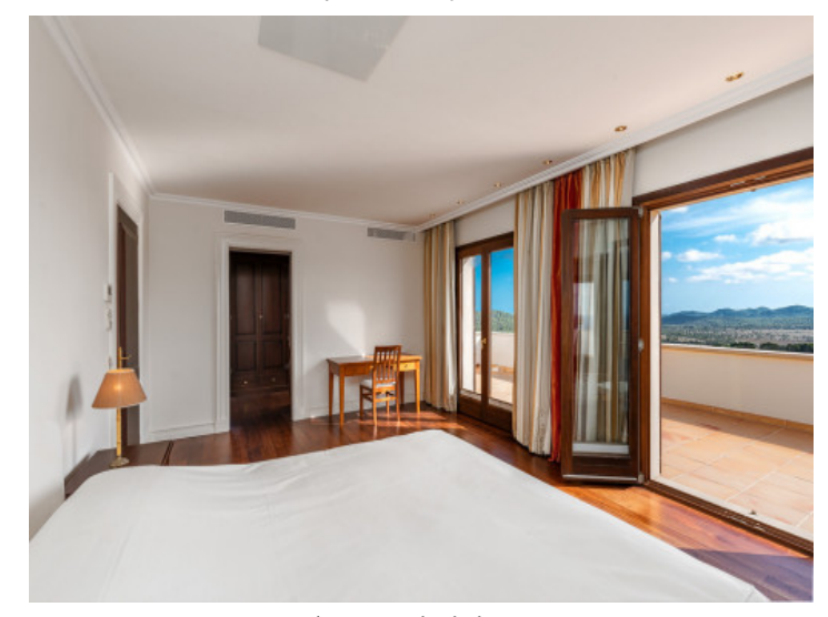
Access to the balcony