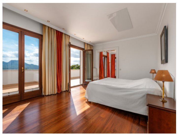
Spacious double bedroom