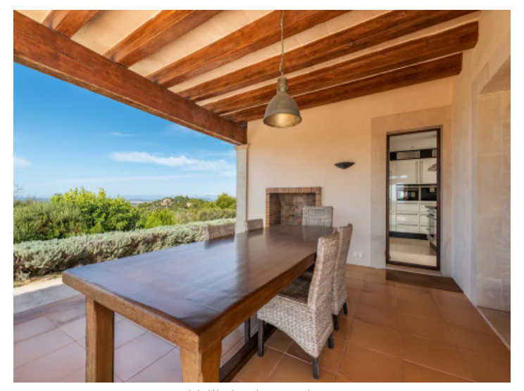
Idyllic landscape views