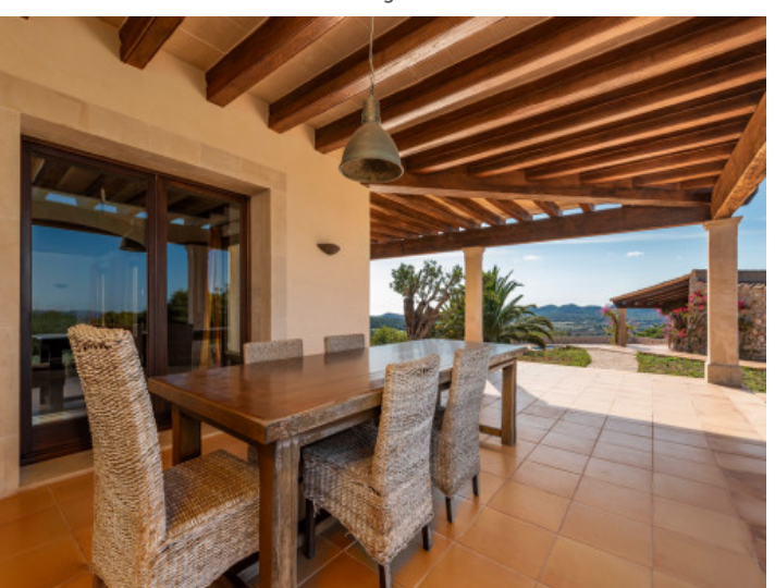
Covered dining area