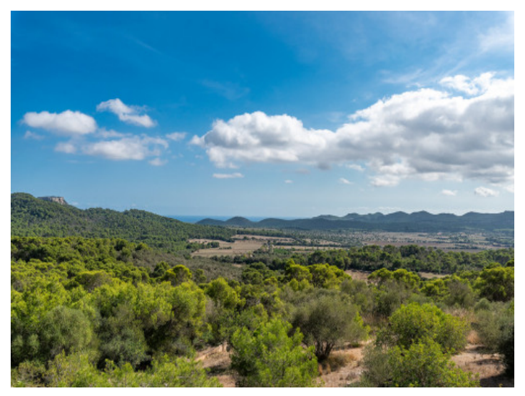
Splendid landscape views