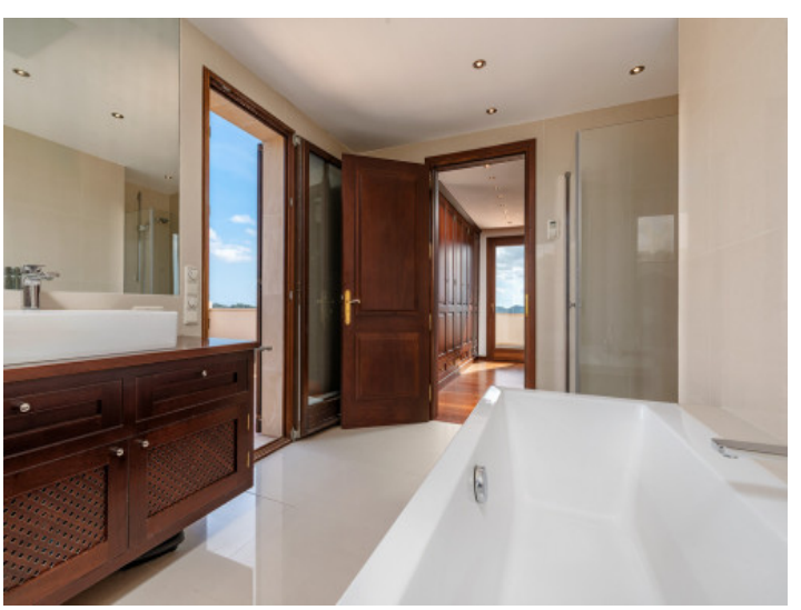
Alternative view of the bathroom