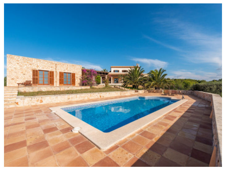
Pool and guest house