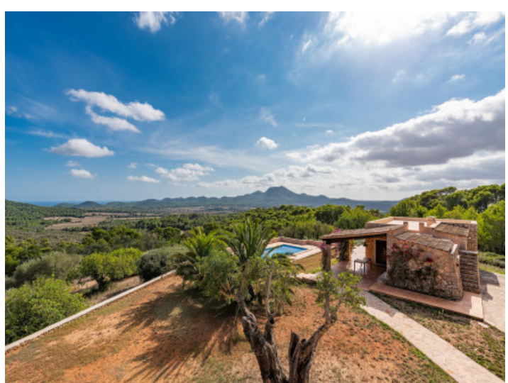
View to the guest house