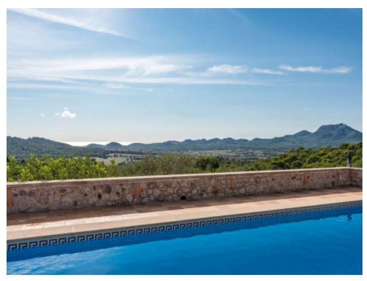
Sea view from the pool