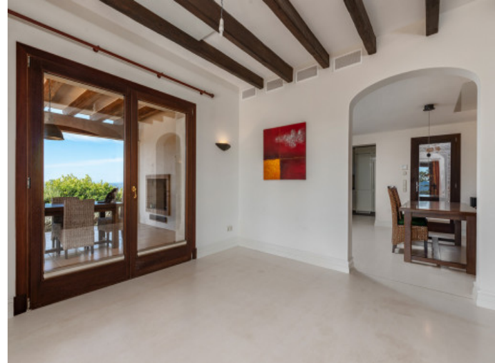
View to the kitchen