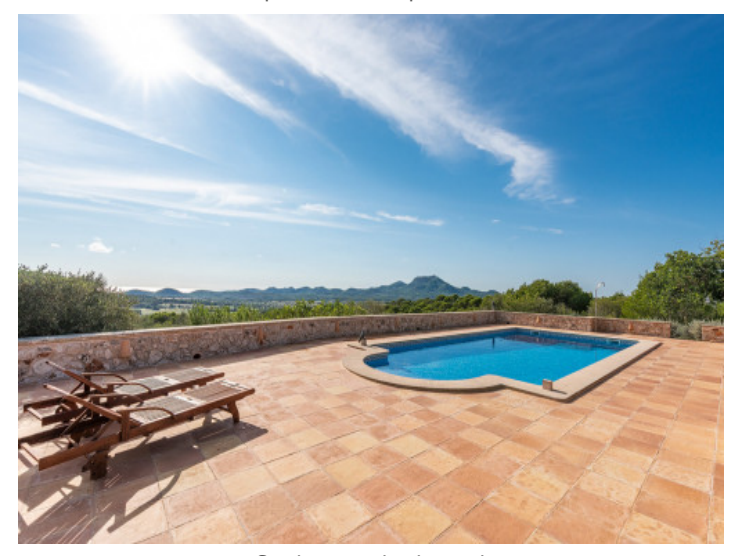
Sun loungers by the pool