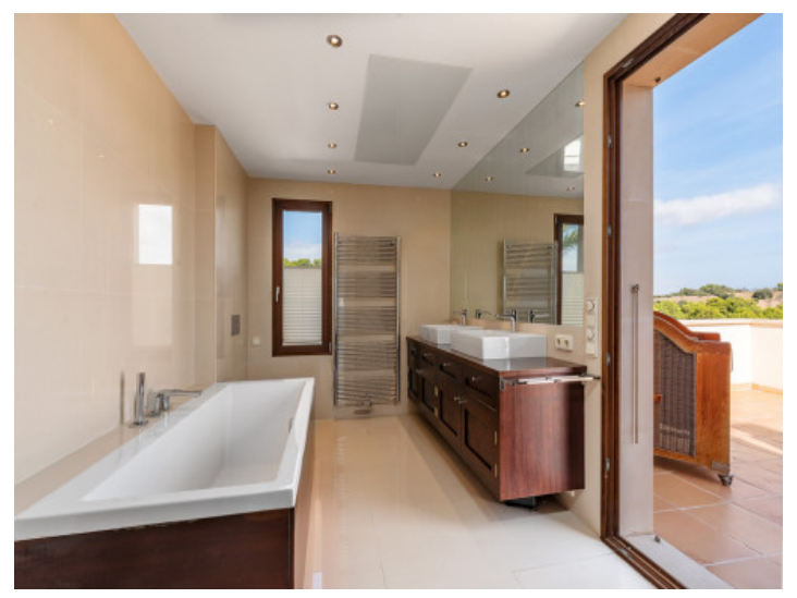
Bathroom with bath tub