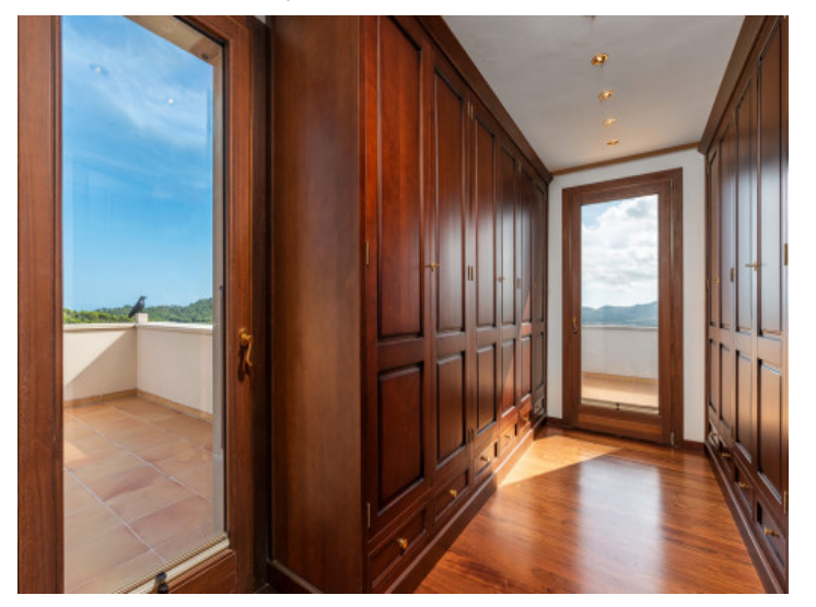
Spacious dressing room