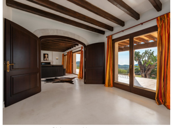
Dining area with terrace access