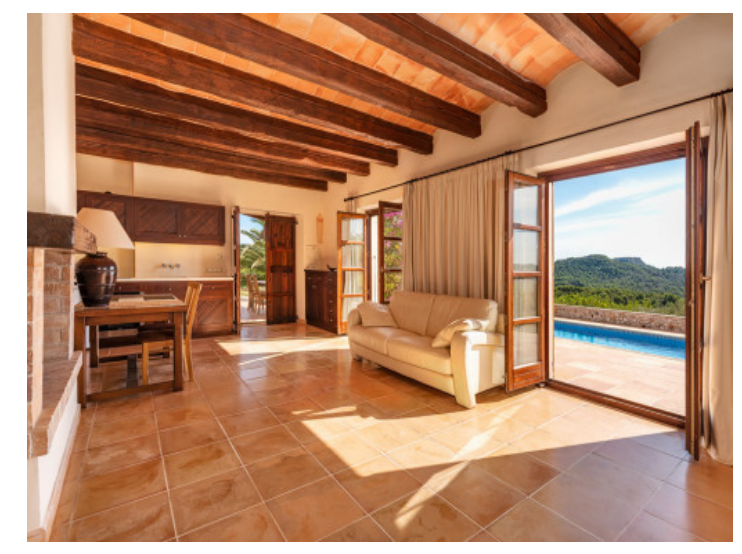
Large guest house