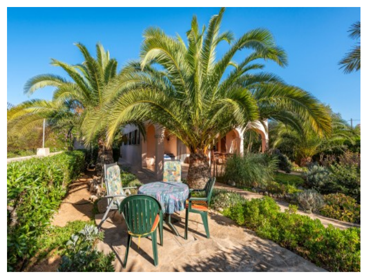
Mediterranean garden with plam trees