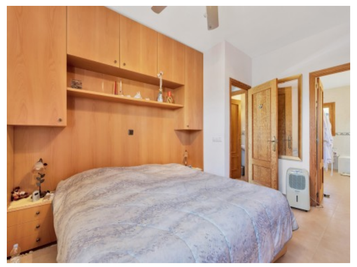
Double bedroom with batroom en suite