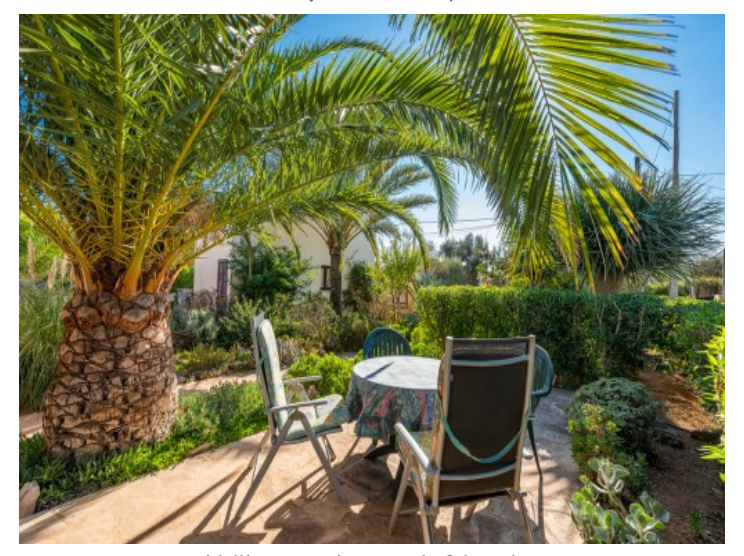
Idyllic terrace in a wonderful garden