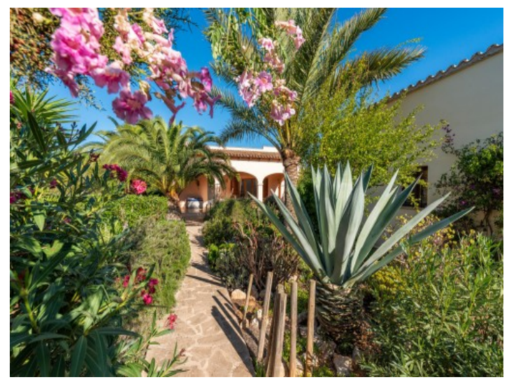
Lovely access to the plot