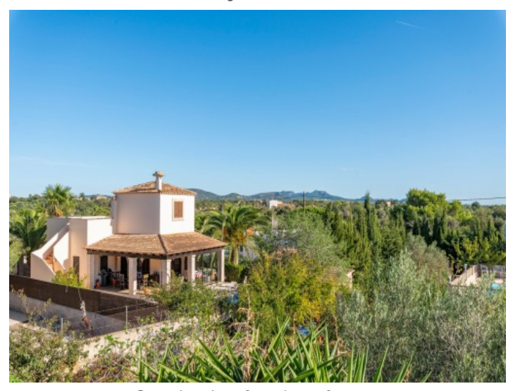
Sweeping views from the roof terrace