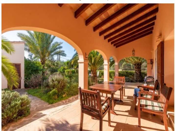
Charming, covered terrace