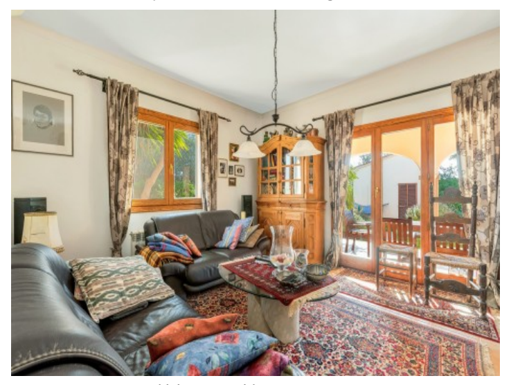
Living area with terrace access