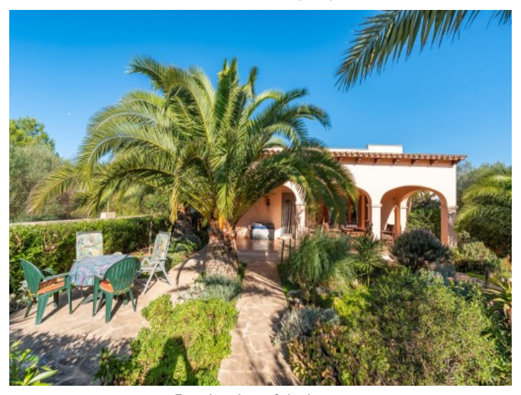
Exterior view of the house