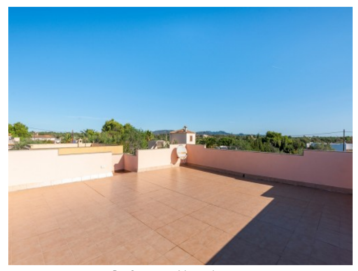
Roof terrace with ample space