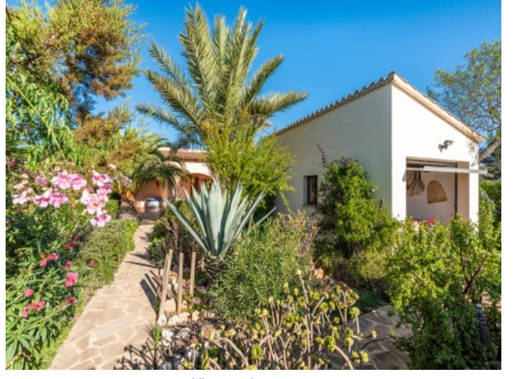
View to the garage

All information is correct to the best of our knowledge. Errors and prior sale excepted. This prospectus is purely for information purposes. Only the notarized deed of sale is legally binding.