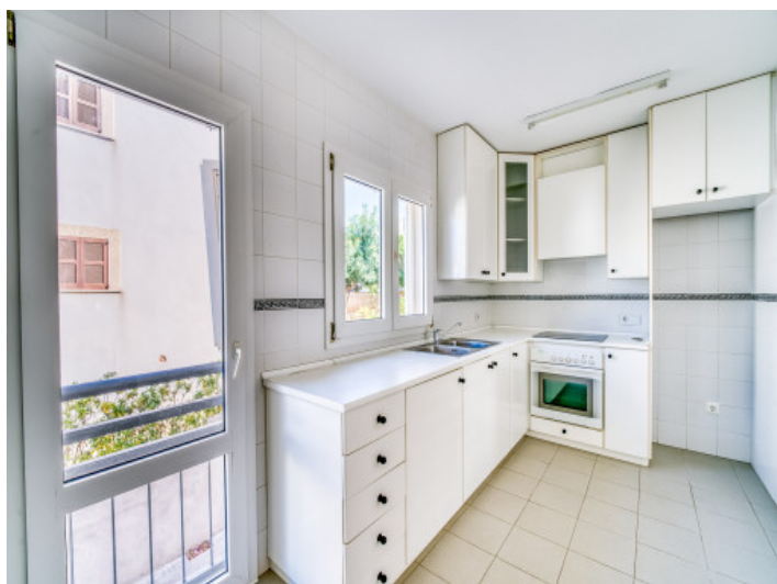
Alternative kitchen view