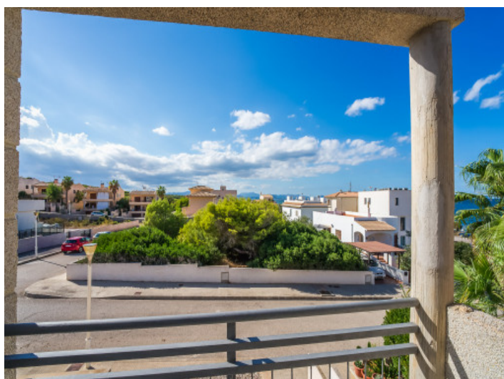
Wonderful views from the upper balcony