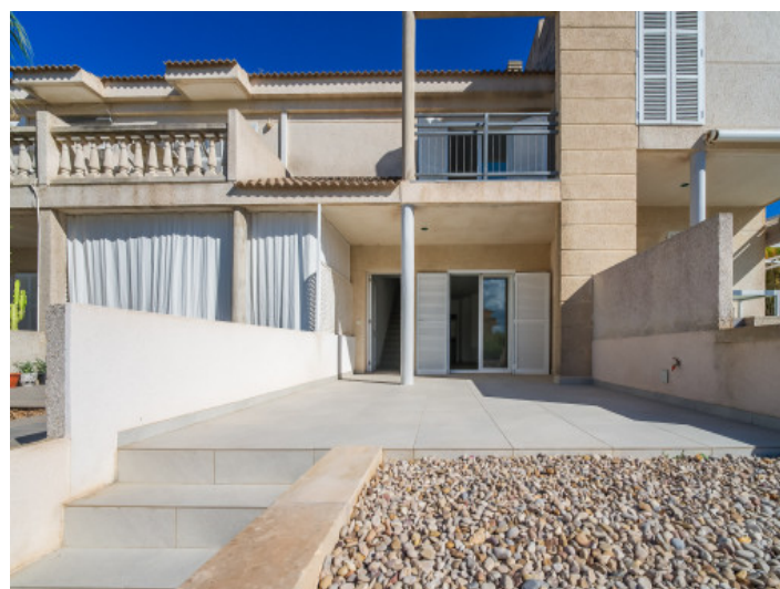
Terrace and exterior view

All information is correct to the best of our knowledge. Errors and prior sale excepted. This prospectus is purely for information purposes. Only the notarized deed of sale is legally binding.