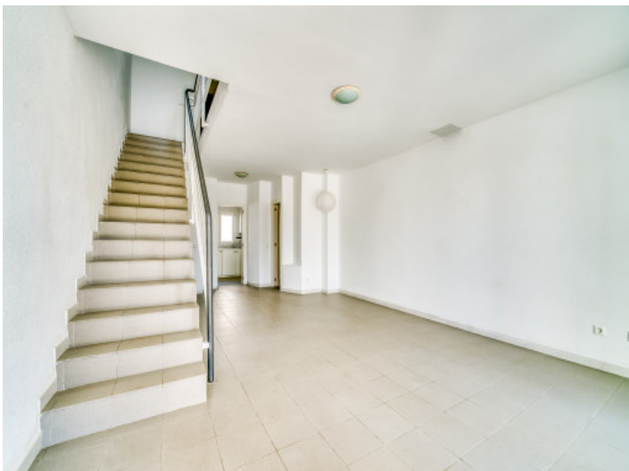
Access to the upper floor