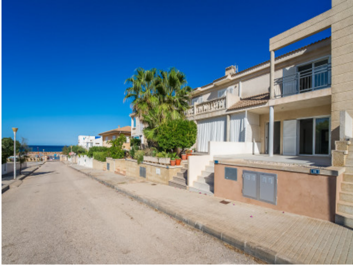
Street and exterior view