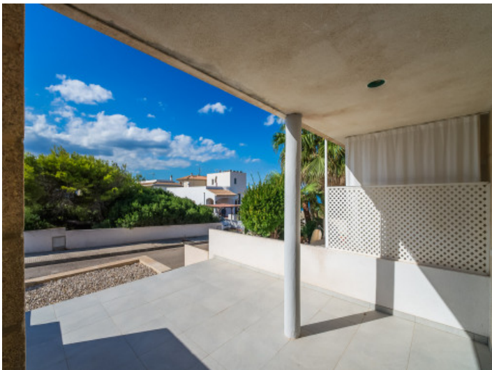
Partly covered terrace