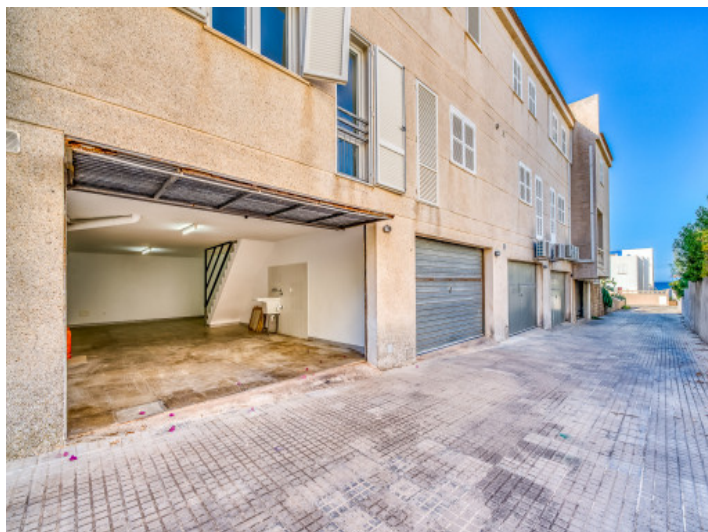
Large double garage

All information is correct to the best of our knowledge. Errors and prior sale excepted. This prospectus is purely for information purposes. Only the notarized deed of sale is legally binding.