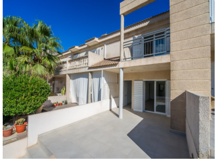
Front terrace and access to the house