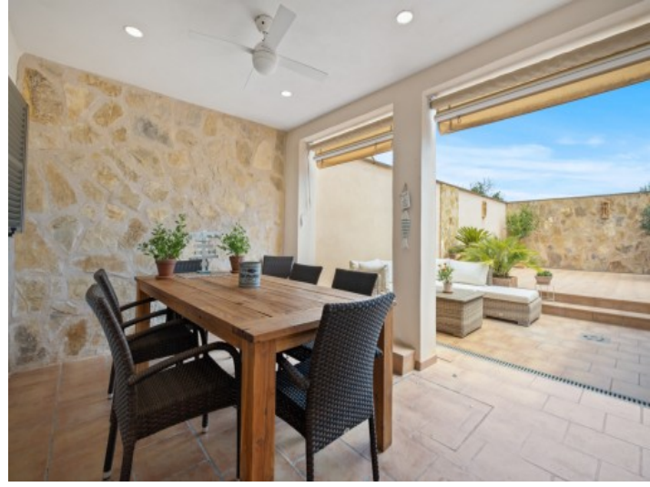
Covered dining area