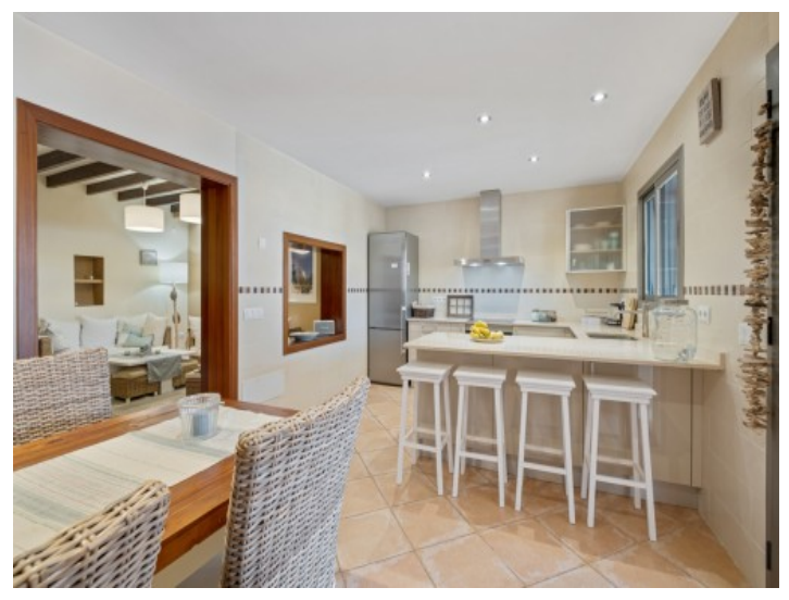
Adjoining kitchen and dining area