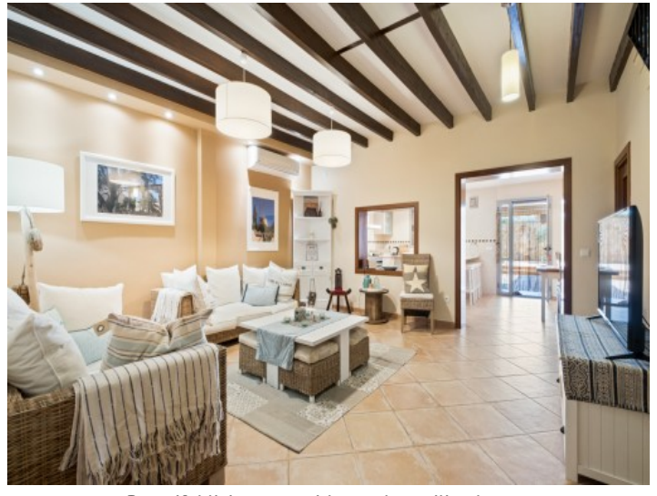
Beautiful living area with wooden ceiling beams