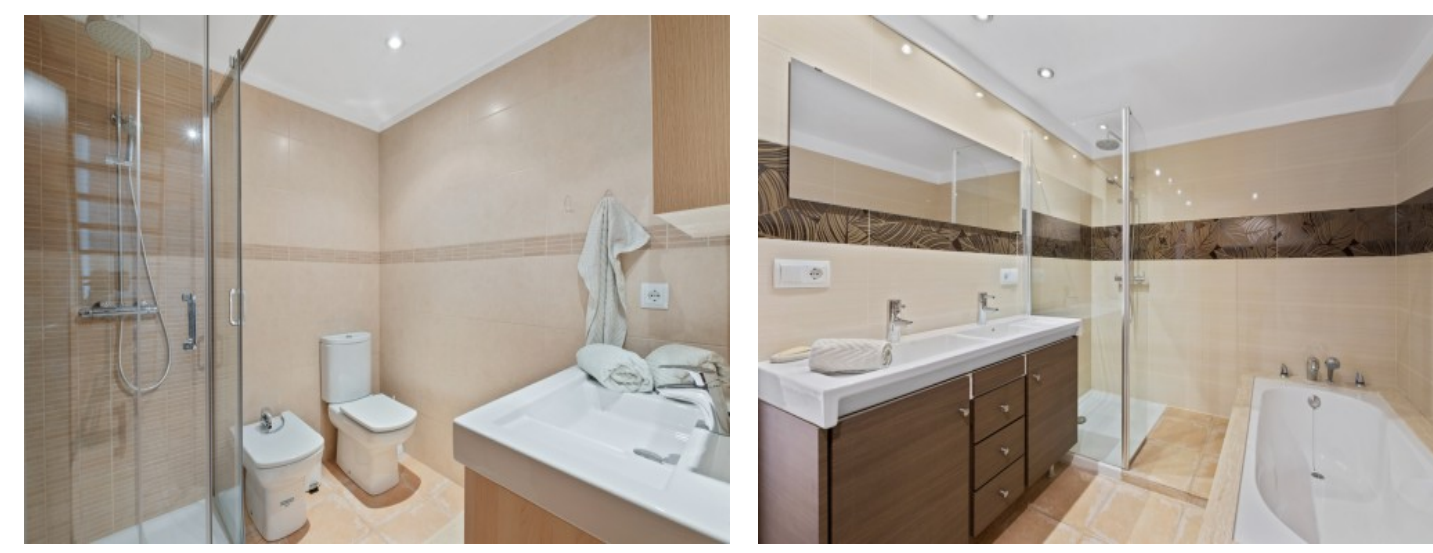
One of 2 bathrooms One of 2 bathrooms. All information is correct to the best of our knowledge. Errors and prior sale excepted. This prospectus is purely for information purposes. Only the notarized deed of sale is legally binding.

PORTA MALLORQUINA • THERESIENSTR.: 81, 80333 MUNICH TEL. +34 971 698 242 • INFO@PORTAMALLORQUINA.COM