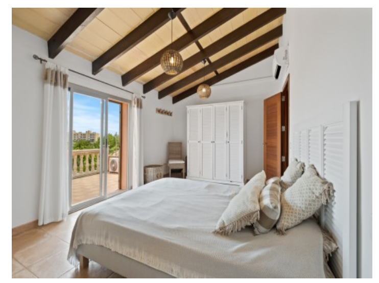
Master bedroom with won terrace

PORTA MALLORQUINA® Your home. Our passion.