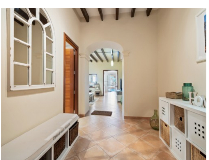
Inviting entrance area