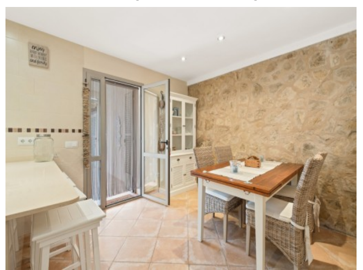
Direct access to the patio Modern, open kitchen All information is correct to the best of our knowledge. Errors and prior sale excepted. This prospectus is purely for information purposes. Only the notarized deed of sale is legally binding.

PORTA MALLORQUINA • THERESIENSTR.: 81, 80333 MUNICH TEL. +34 971 698 242 • INFO@PORTAMALLORQUINA.COM