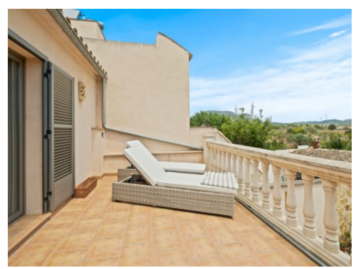
Spacious sun terrace