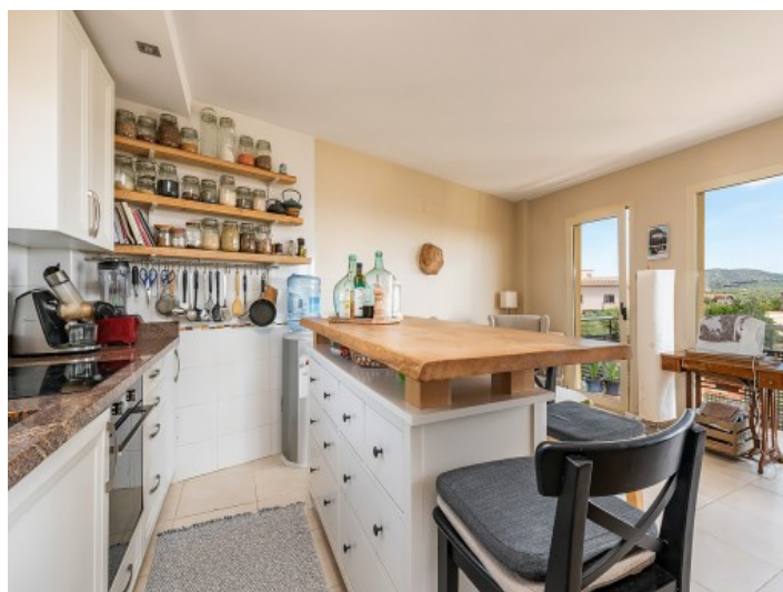
Open, bright kitchen