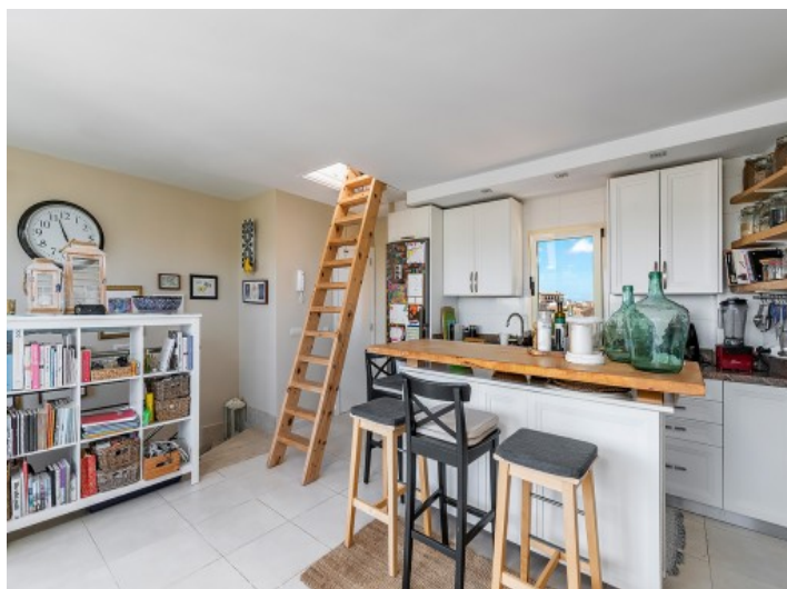
Cozy kitchen with access to the roof terrace