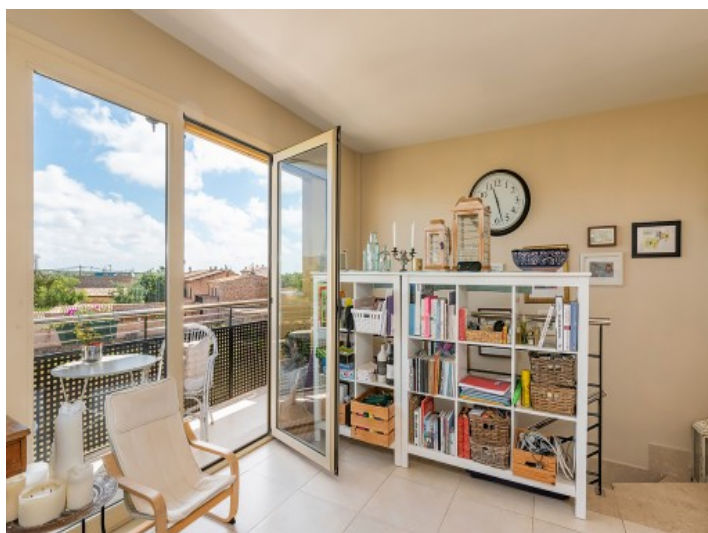
Access to the balcony