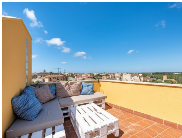
Lovely roof terrace with lounge area