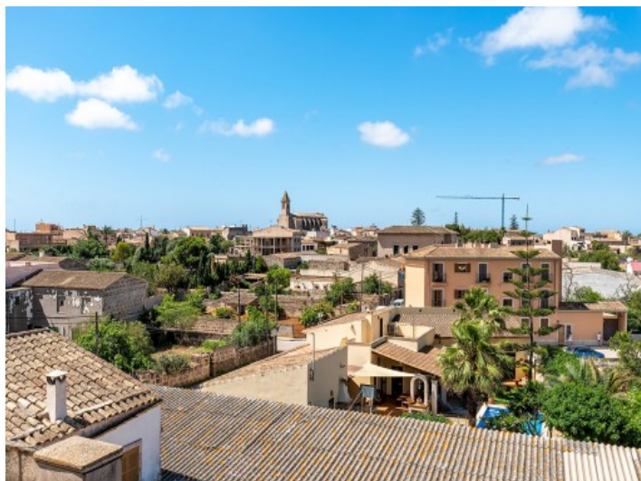
Wonderful views to the town