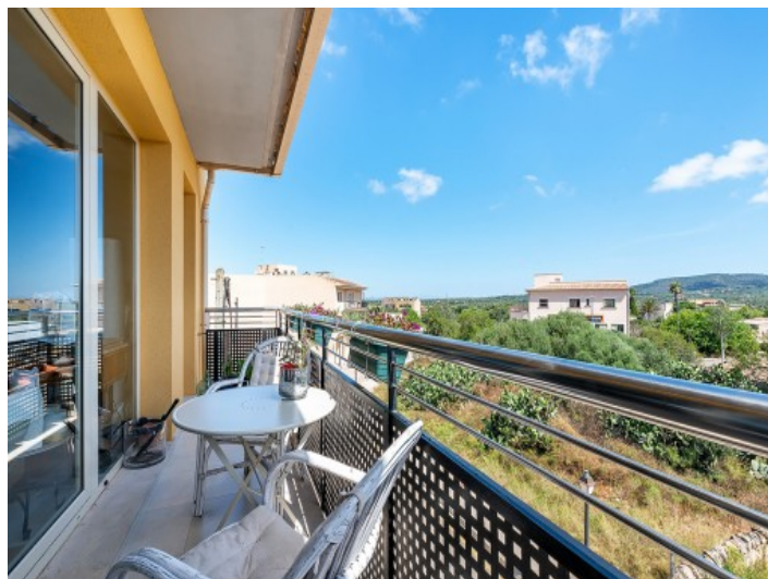
Balcony with sweeping views