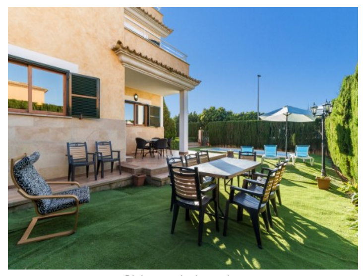
Dining area in the garden