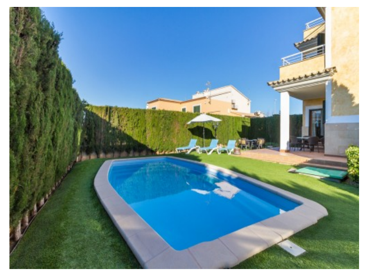
Wonderful pool area

All information is correct to the best of our knowledge. Errors and prior sale excepted. This prospectus is purely for information purposes. Only the notarized deed of sale is legally binding.