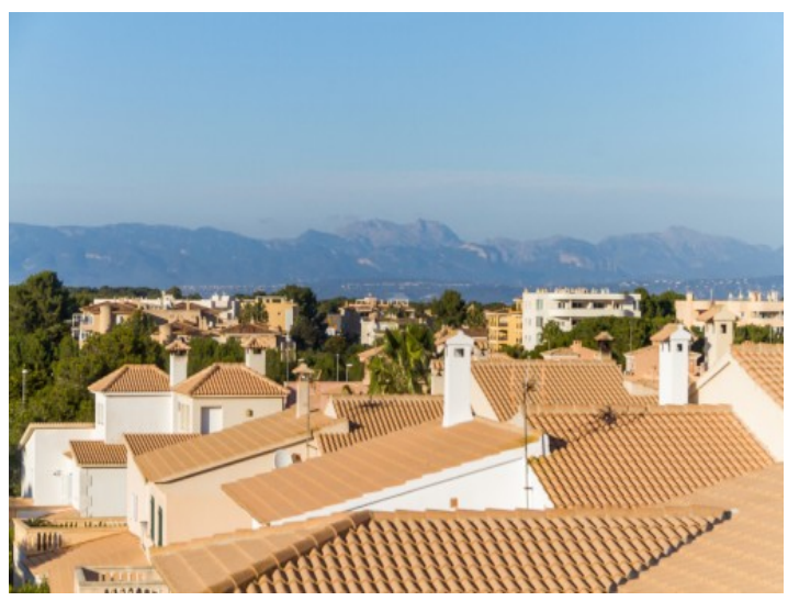
Gorgeous mountain views