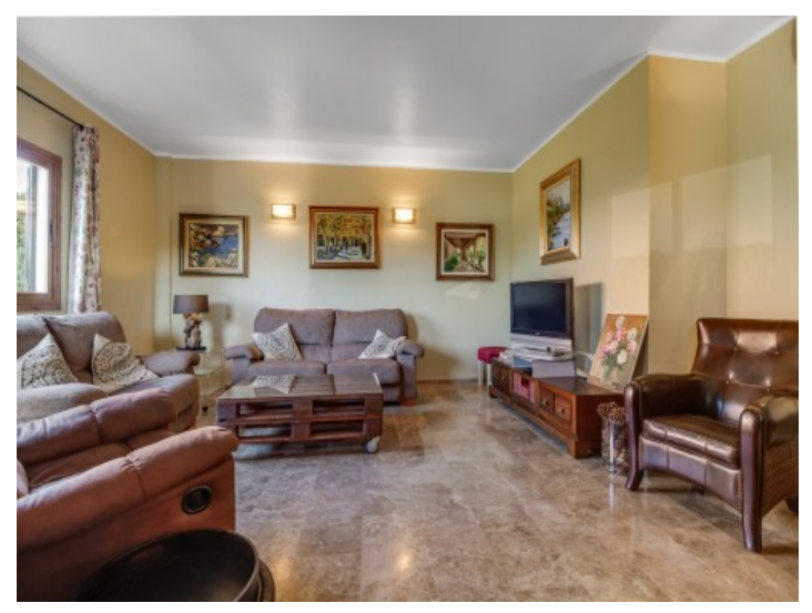
Cosy and spacious living area