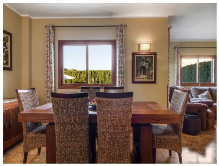
Beautiful, bright dining area