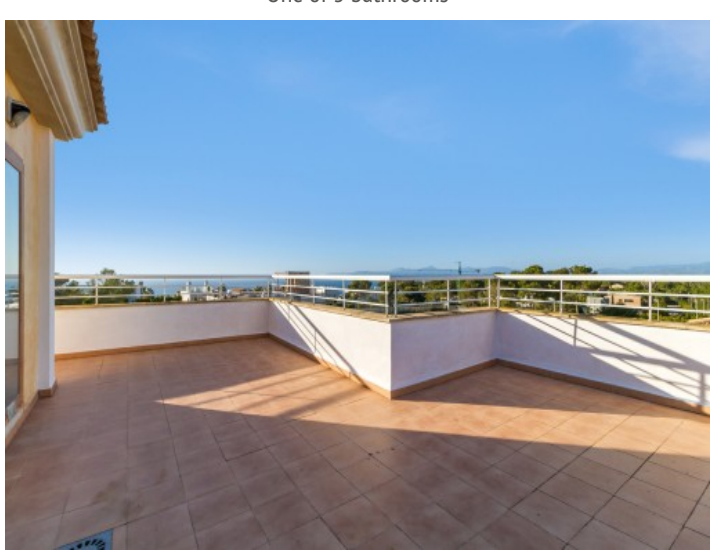
Marvellous terrace with views