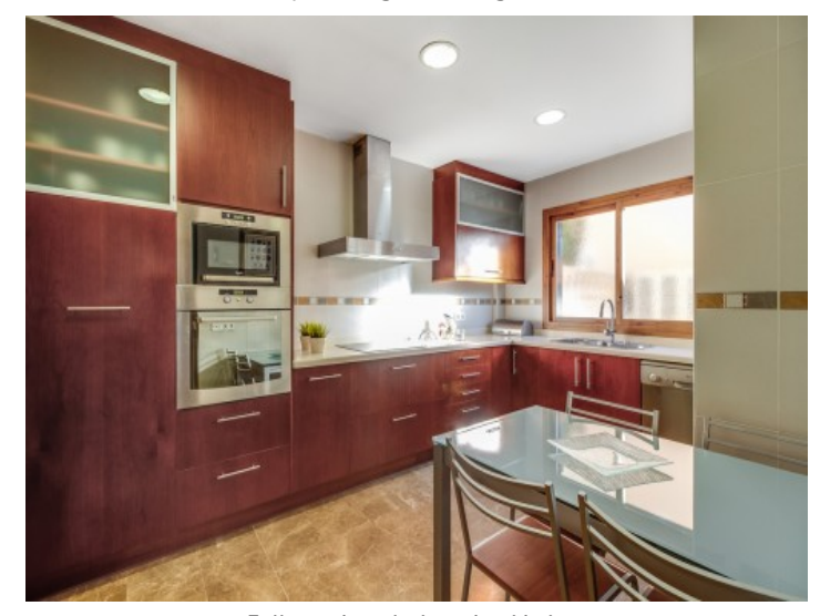
Fully equipped, charming kitchen