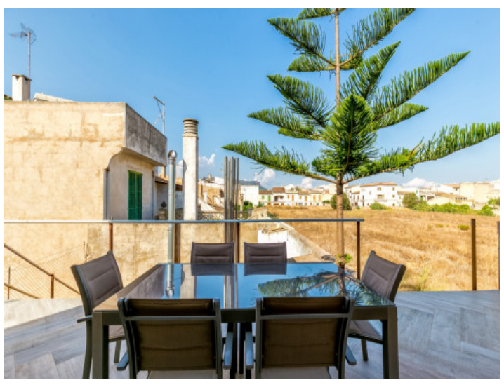
Terrace with views over the surroundings