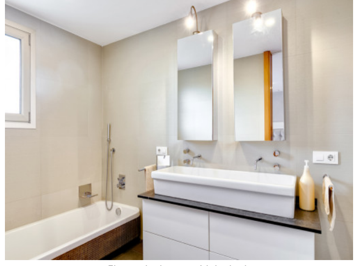
Elegant bathroom with bathtub