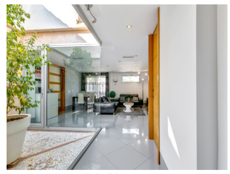
Modern living concept