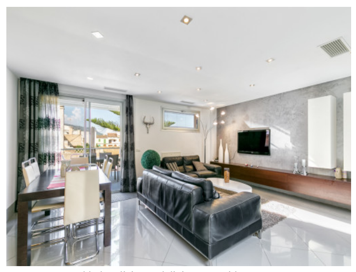
Modern living and dining area with terrace