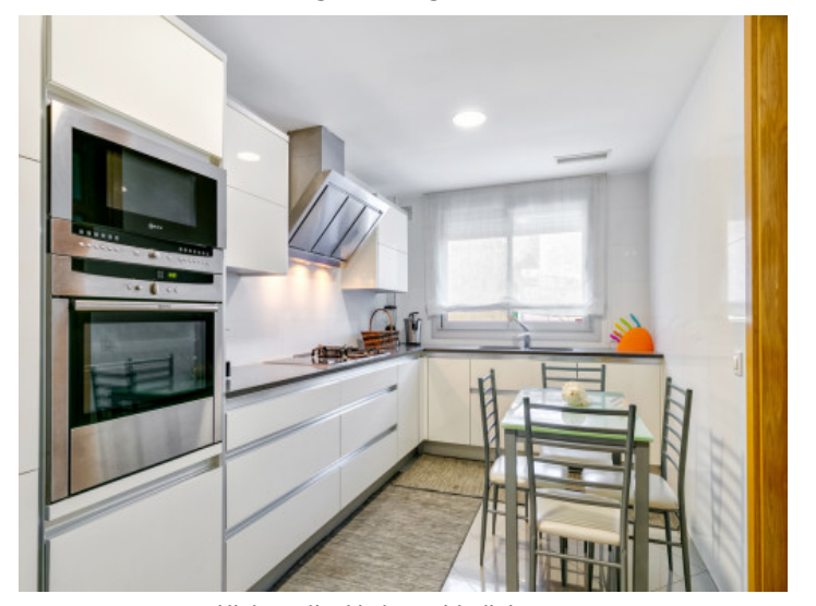
High quality kitchen with dining area

All information is correct to the best of our knowledge. Errors and prior sale excepted. This prospectus is purely for information purposes. Only the notarized deed of sale is legally binding.