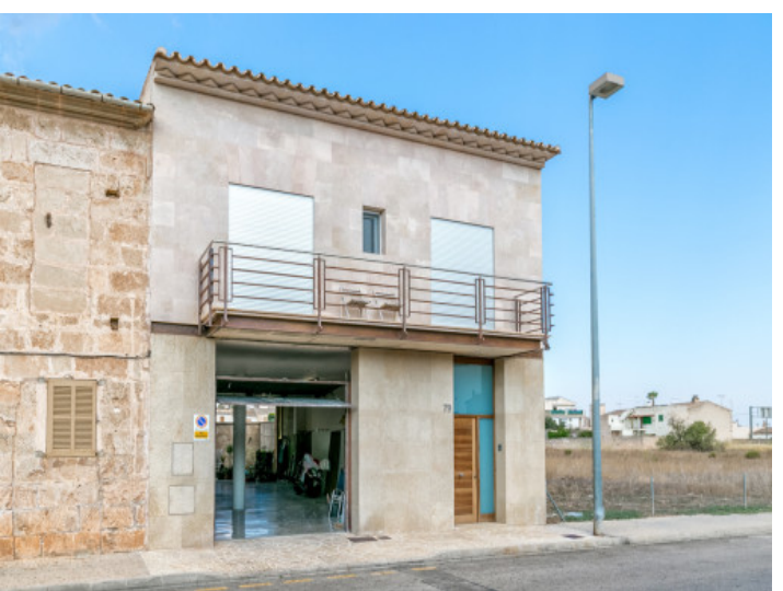
Exterior view of the town house