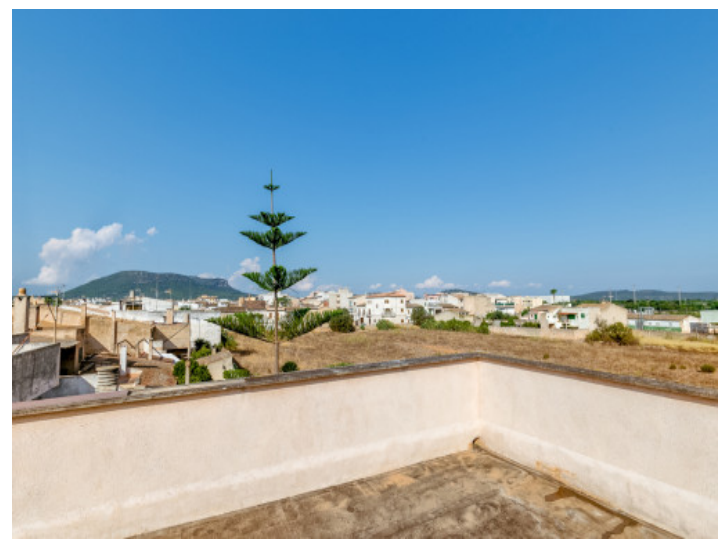
Roof terrace with beautiful views