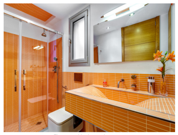
The second bathroom in orange