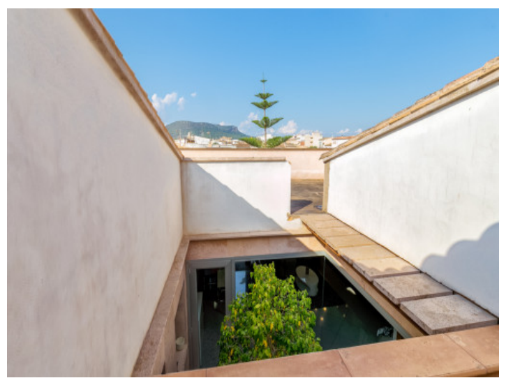
Modern patio and roof terrace

All information is correct to the best of our knowledge. Errors and prior sale excepted. This prospectus is purely for information purposes. Only the notarized deed of sale is legally binding.