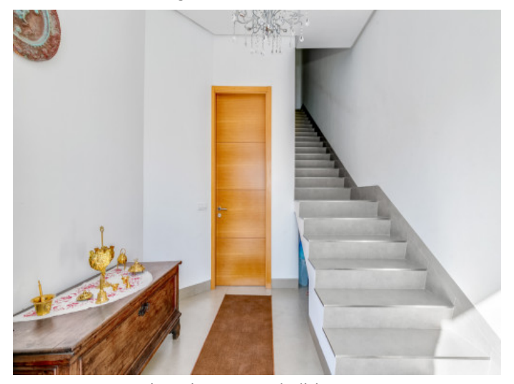
Attractive access to the living area