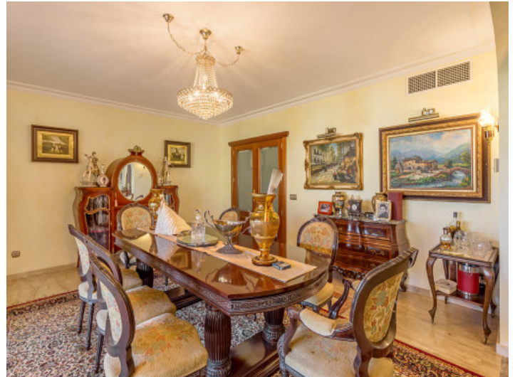
Dining area with antique furniture