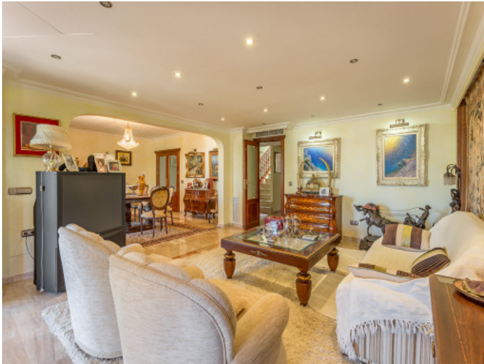
Spacious living and dining area of 100 sqm