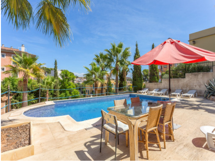
Wonderful pool area for summer days