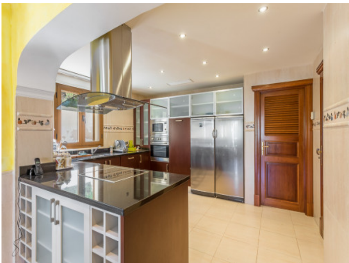
Fully equipped kitchen with cooking island