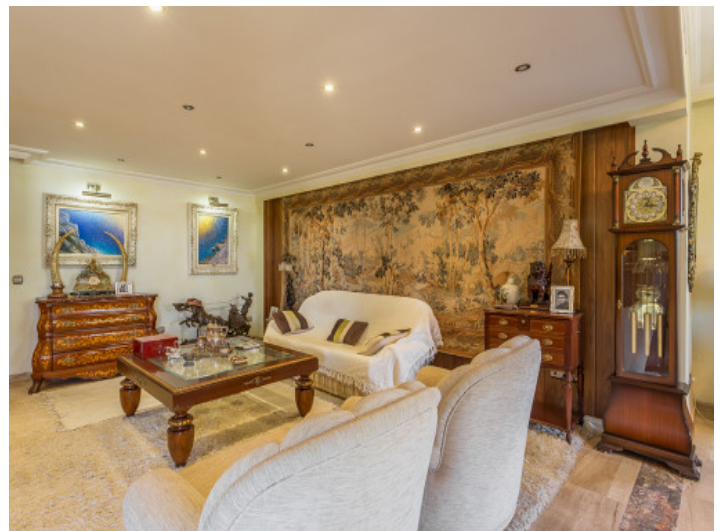
Living area in a traditional style

All information is correct to the best of our knowledge. Errors and prior sale excepted. This prospectus is purely for information purposes. Only the notarized deed of sale is legally binding.