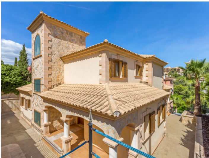
Exterior view of the house