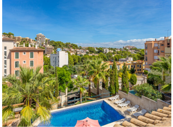
Views to the beautiful pool area