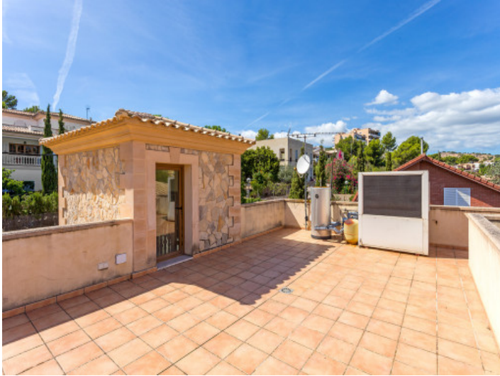
90 sqm roof terrace