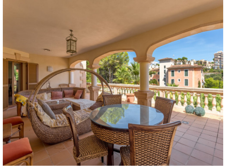
Covered terrace with lounge and dining area