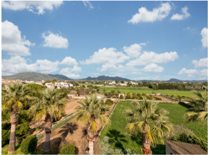
Dreamlike panorama views from the roof terrace