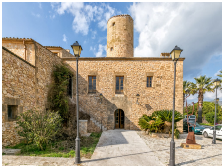
Exterior view of the mill