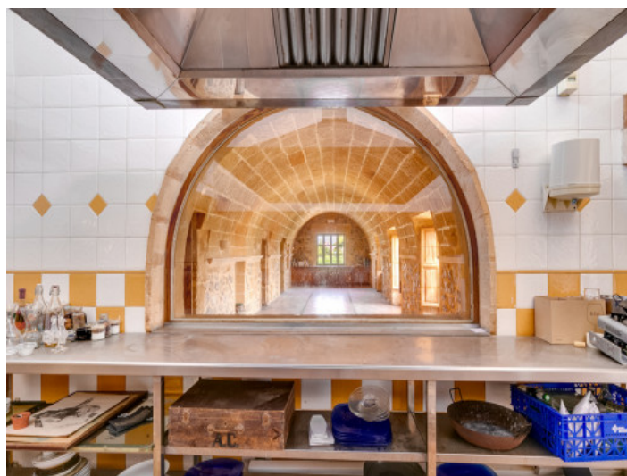
Fantastic views from the kitchen to the guest room