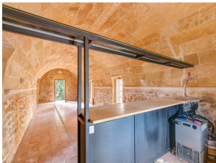
Superb and special location for a restaurant

All information is correct to the best of our knowledge. Errors and prior sale excepted. This prospectus is purely for information purposes. Only the notarized deed of sale is legally binding.