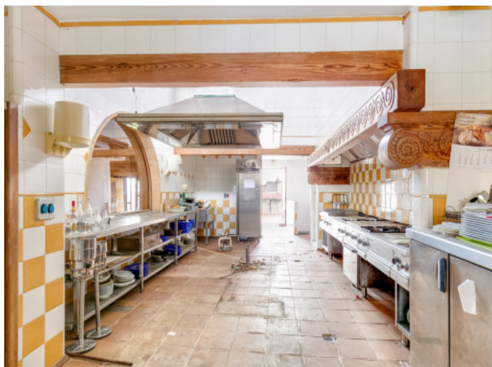
Spacious gastronomy kitchen