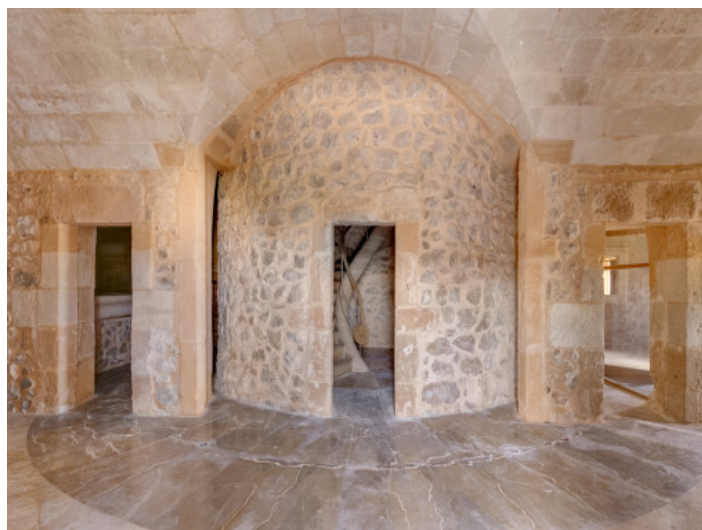
A conversion to an imposing residence is also possible

All information is correct to the best of our knowledge. Errors and prior sale excepted. This prospectus is purely for information purposes. Only the notarized deed of sale is legally binding.