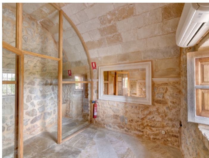
Storage room with air conditioning