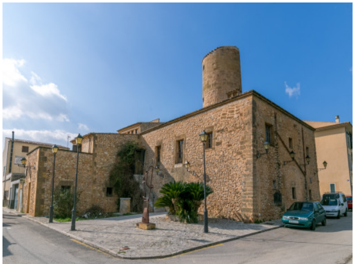
Exterior view of the mill

All information is correct to the best of our knowledge. Errors and prior sale excepted. This prospectus is purely for information purposes. Only the notarized deed of sale is legally binding.