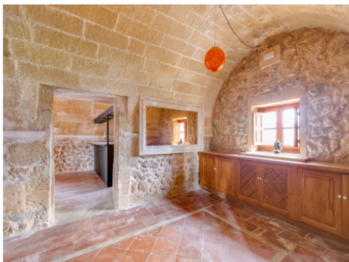
Further guest room and bar area