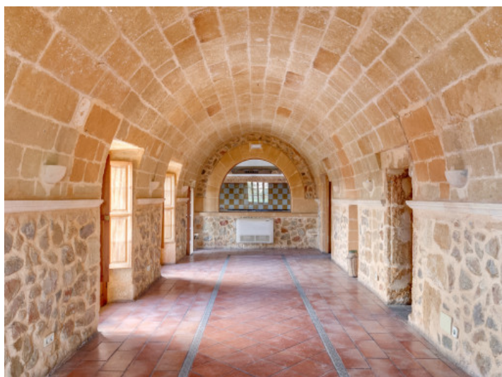
Beautiful guest room with views to the kitchen