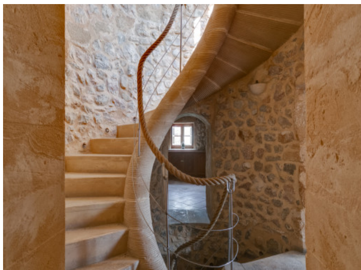
Alternative view of the mill tower