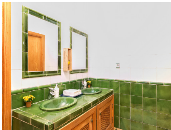
Toilet room with double washbasin