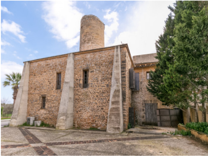
Ample seating possibilities in the outside area