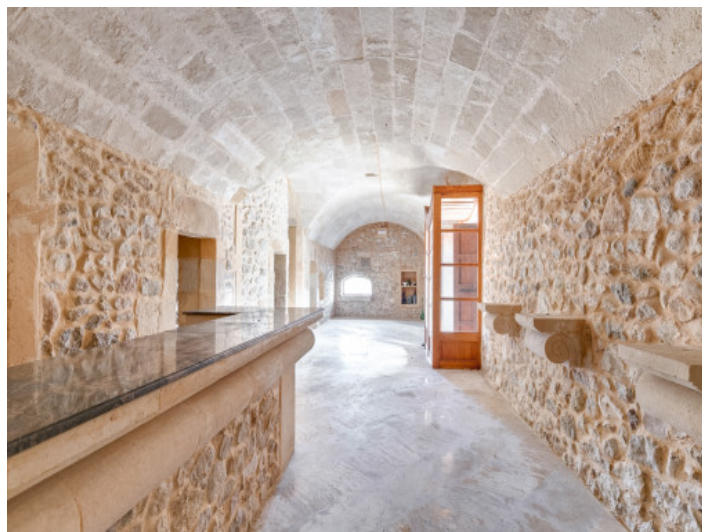
Impressive entrance area