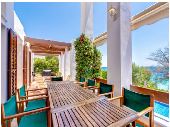
Spacious terrace with dining area and barbecue