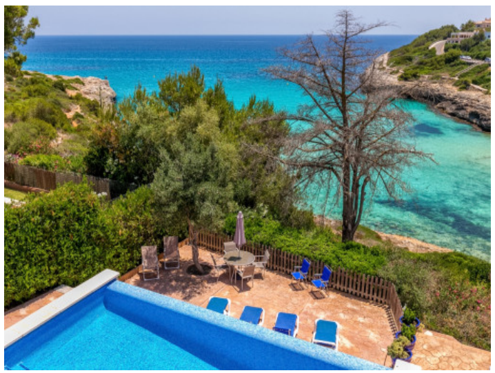
Located in first sea line