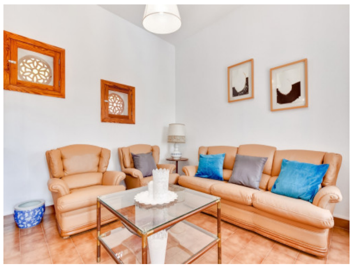
Cosy lounge area