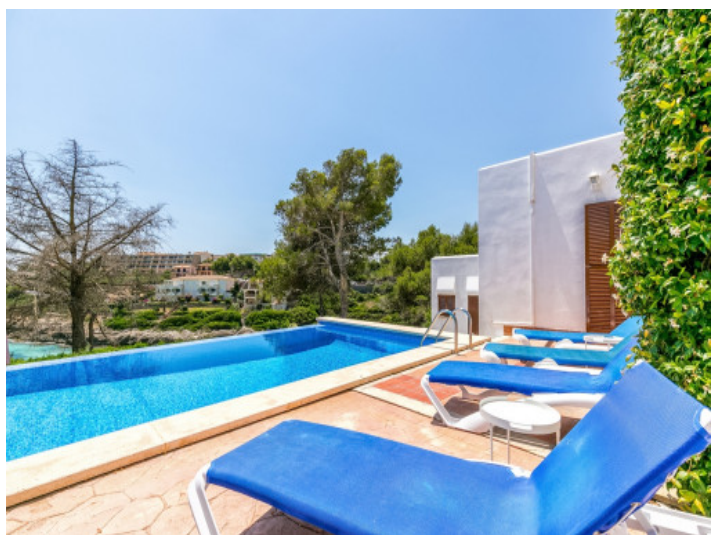
Sunny pool area with sea views