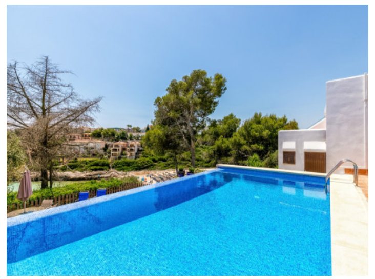
Large pool with views of the beach