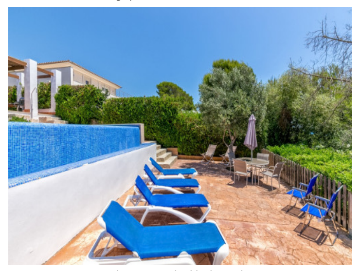
Lounge area beside the pool