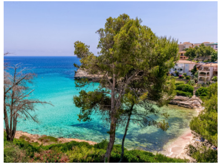
Beautiful beach nearby