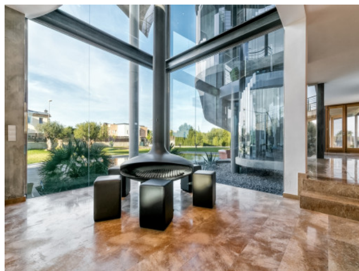
Stylish chillout area with garden views and fireplace