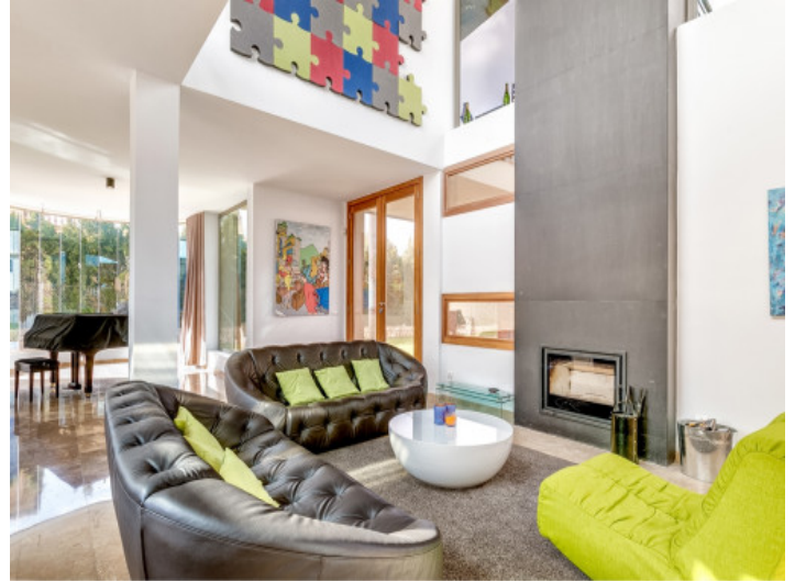
Light flooded living area with fireplace