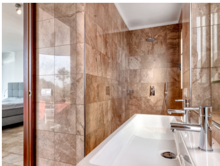
Master bathroom en suite with shower