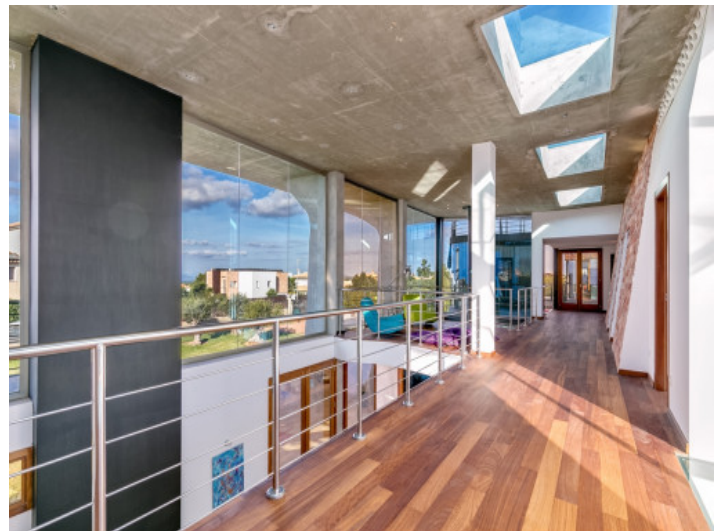
Extensive gallery with lounge area