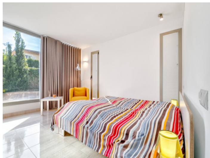
Friendly guest bedroom

All information is correct to the best of our knowledge. Errors and prior sale excepted. This prospectus is purely for information purposes. Only the notarized deed of sale is legally binding.