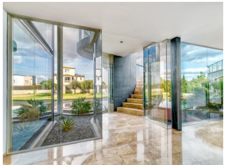
Garden and pool views from the ground floor

All information is correct to the best of our knowledge. Errors and prior sale excepted. This prospectus is purely for information purposes. Only the notarized deed of sale is legally binding.