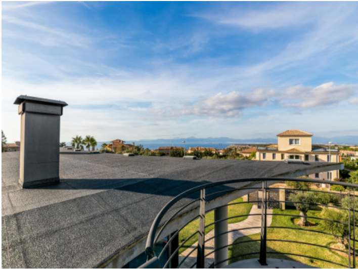
Wonderful panoramic views