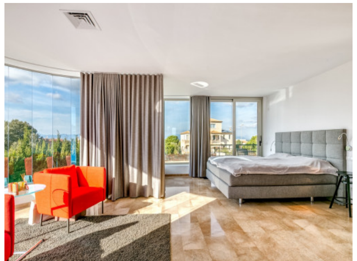
Capacious master bedroom with fantastic glass façade

All information is correct to the best of our knowledge. Errors and prior sale excepted. This prospectus is purely for information purposes. Only the notarized deed of sale is legally binding.