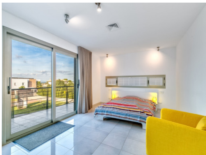
Double bedroom with balcony access