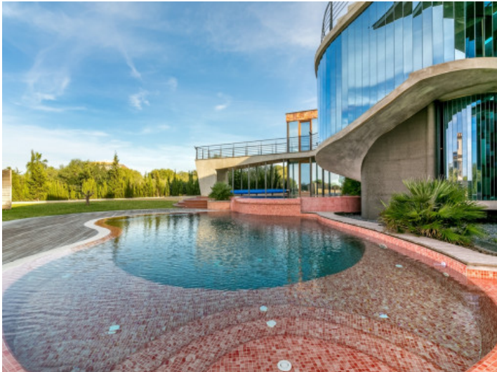
Breath-taking pool area