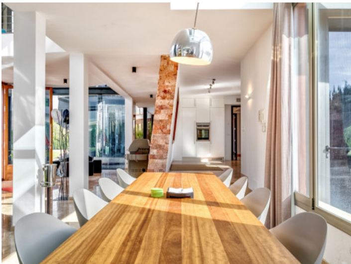
Large dining area