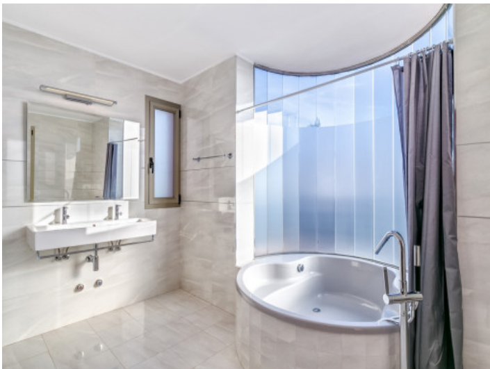
One out of 5 bathrooms with comfortable bathtub