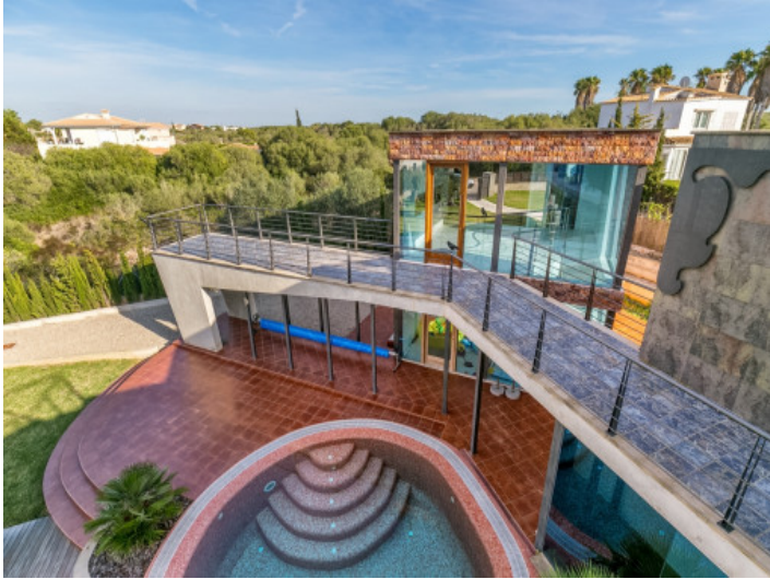
Great garden and pool area