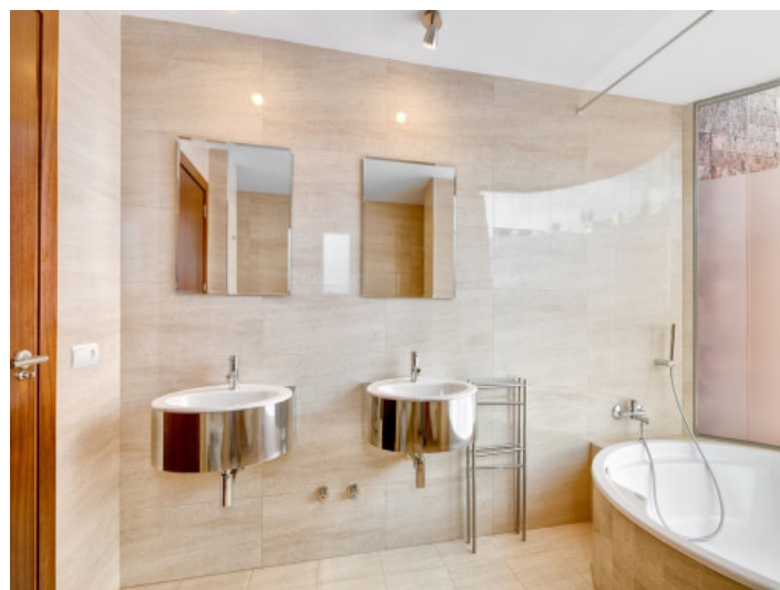
Noble bathroom with bathtub and natural light