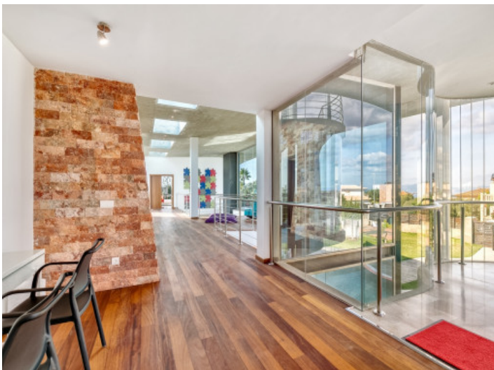
The completely glazed areas are a highlight