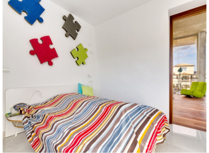
A further double bedroom on the upper floor