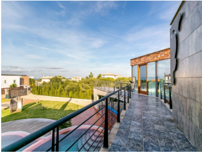
The villa has a seperate guest house