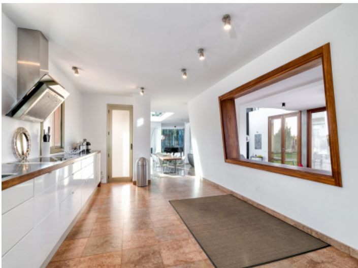
Modern and spacious kitchen