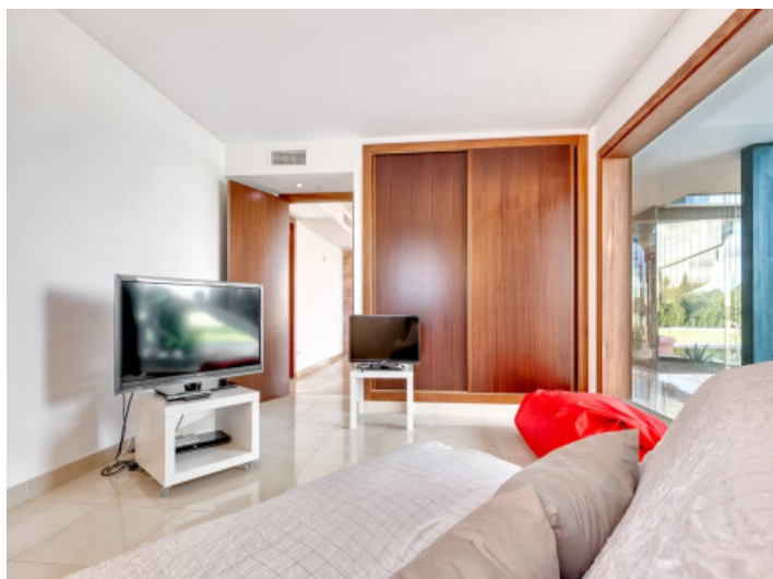
Guest room with built-in wardrobe