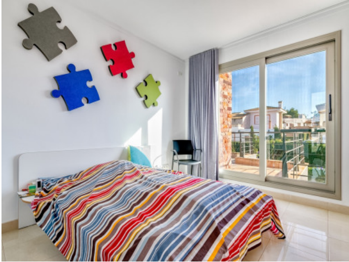
One out of 5 bedrooms