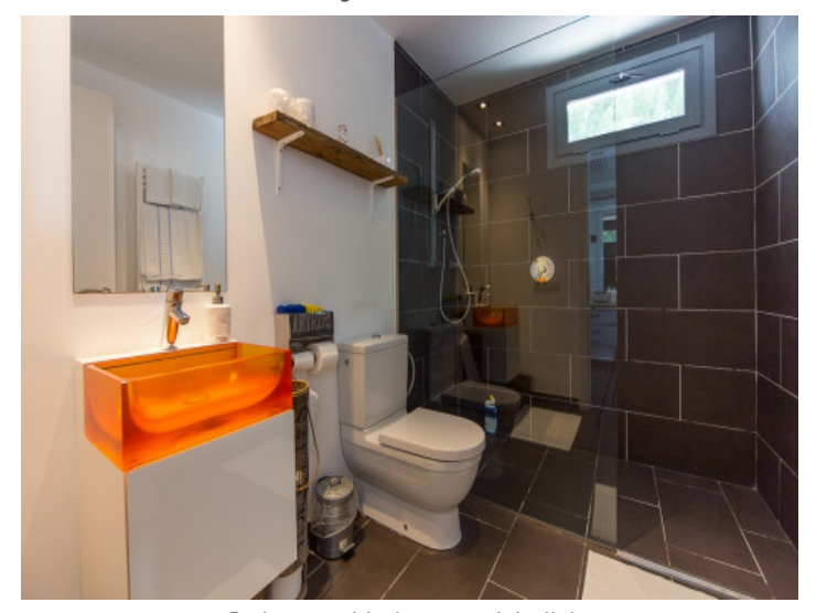
Bathroom with shower and daylight