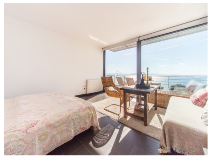
Light flooded bedroom