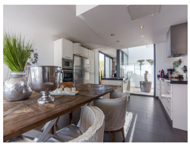
Elegant dining area with kitchen