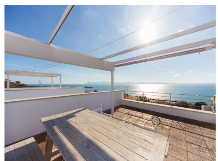
Dining area on the roof terrace