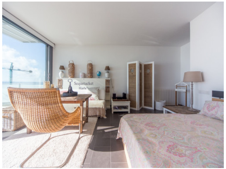
Master bedroom with panoramic windows