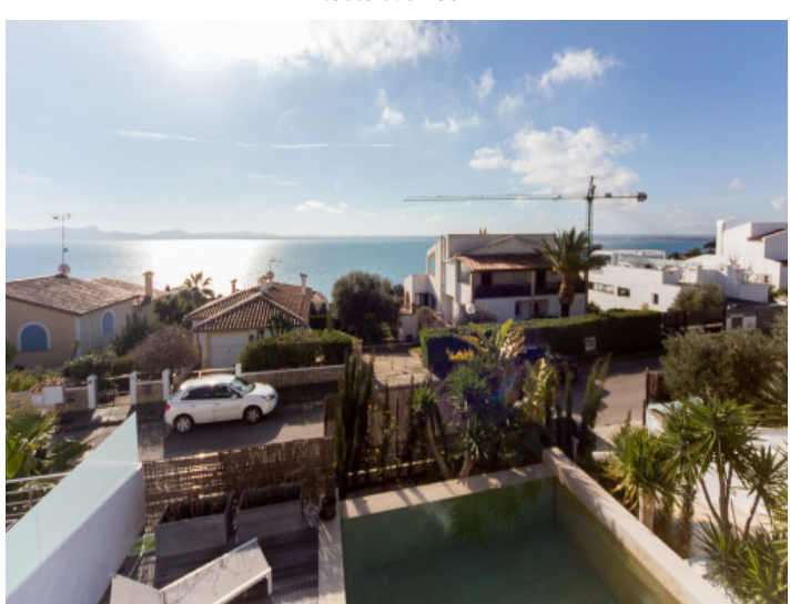
Impressive sea views