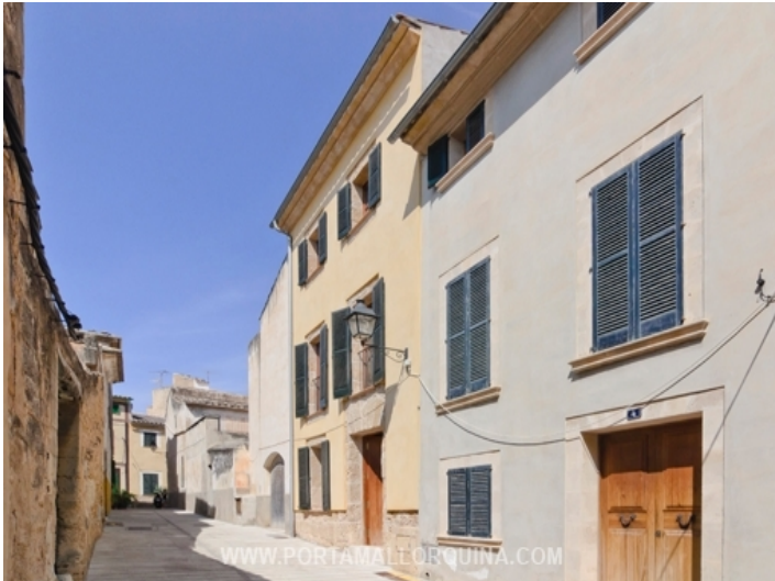
Exterior view of the house