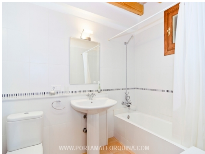
Bathroom with bathtub