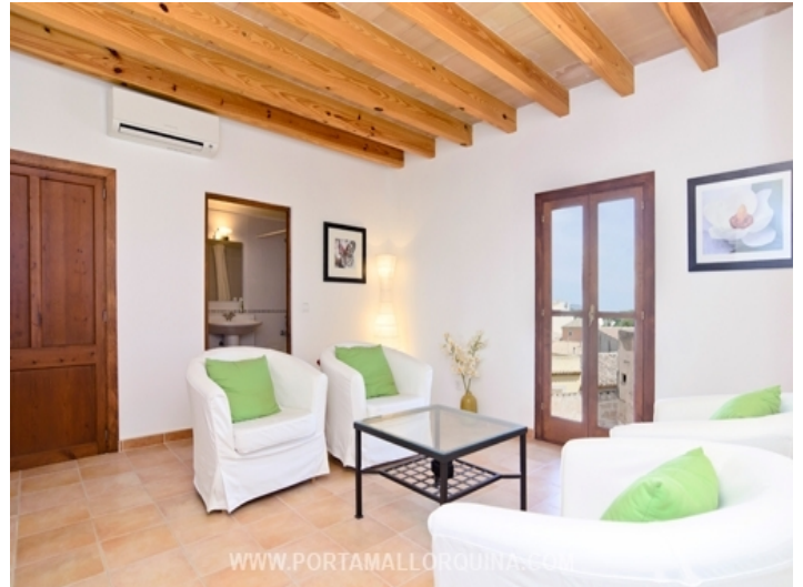
Bright living area with wooden ceiling beams