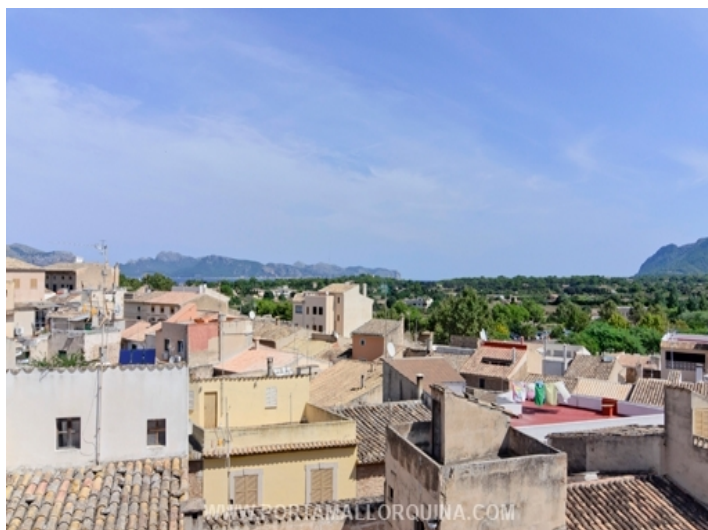
Panoramic views from the upper terrace