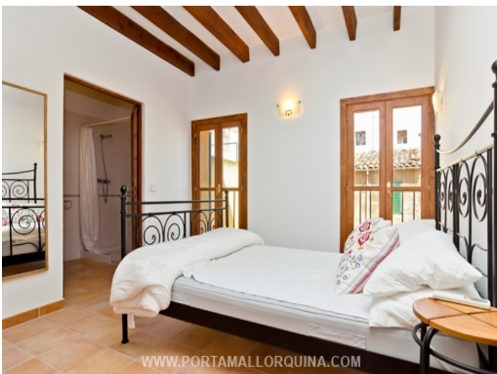
One of 4 bedrooms