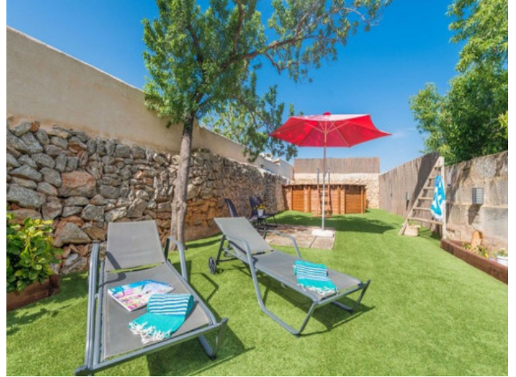
Garden with pool

All information is correct to the best of our knowledge. Errors and prior sale excepted. This prospectus is purely for information purposes. Only the notarized deed of sale is legally binding.