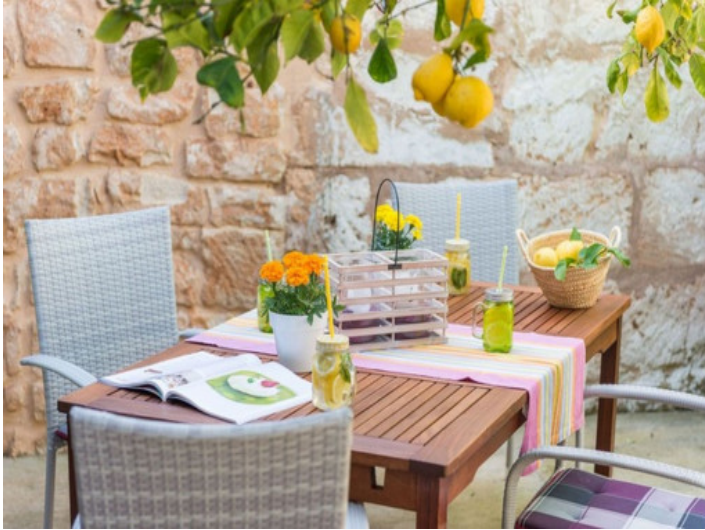
Patio and garden