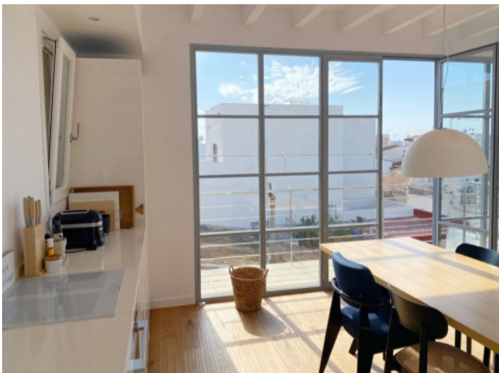
Kitchen with views