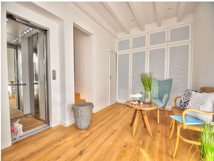
Entry with elevator