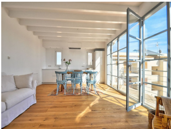
Kitchen with dining table