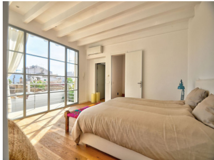
Master Bedroom with elevator