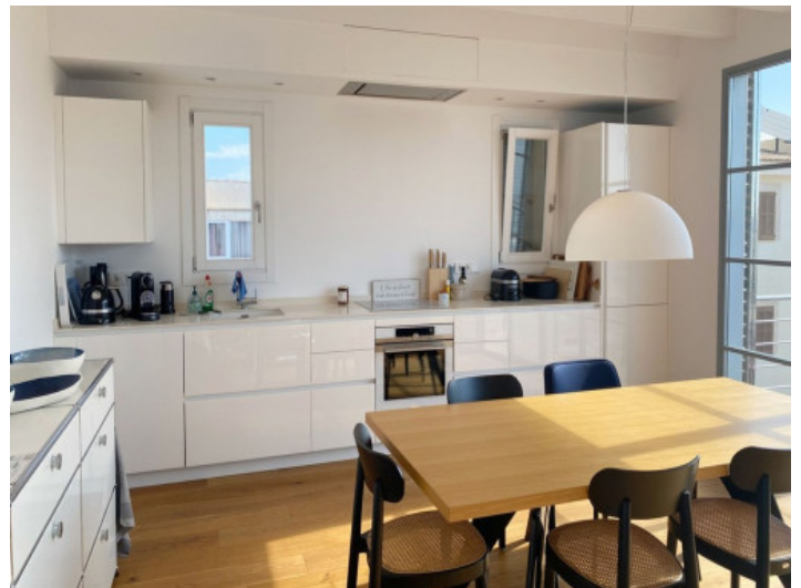
Open kitchen concept