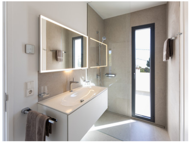
The villa offers 3 bathrooms