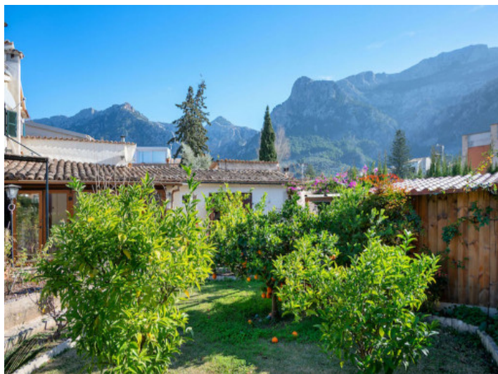
Garden and Traumtana mountain views