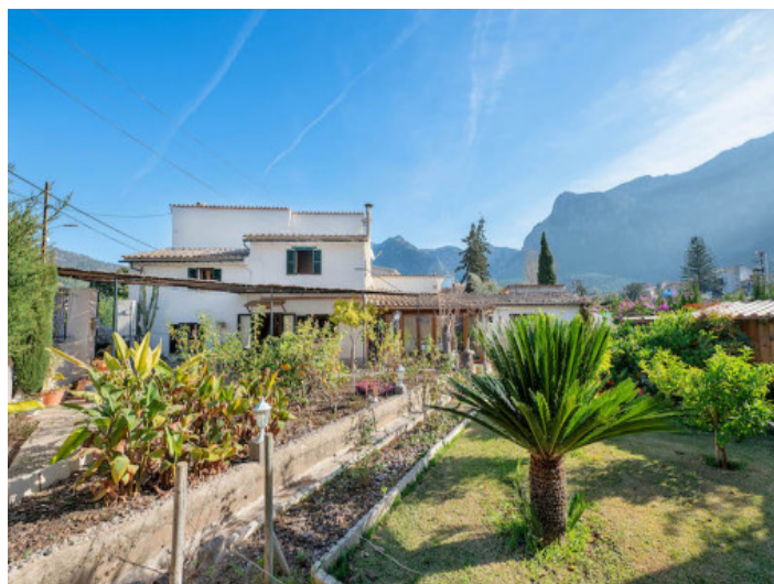
Garden and facade

All information is correct to the best of our knowledge. Errors and prior sale excepted. This prospectus is purely for information purposes. Only the notarized deed of sale is legally binding.