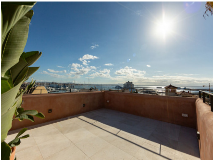
Rooftop terrace with harbour views