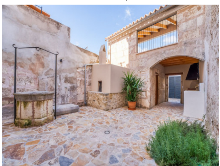
Patio with access to the pool area