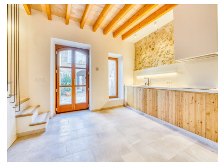
Kitchen with patio access