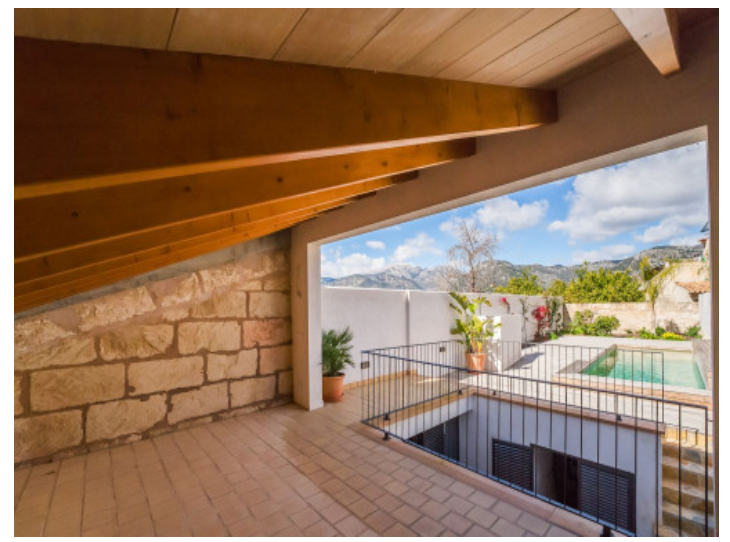
Terrace next to the pool area