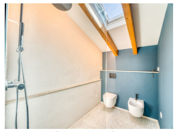
Bathroom on the second floor