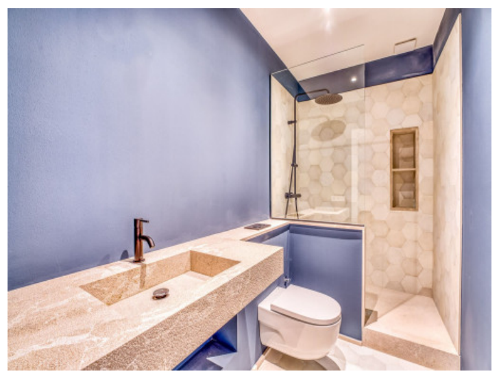
Bathroom on the first floor