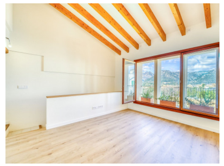
Living area on the second floor