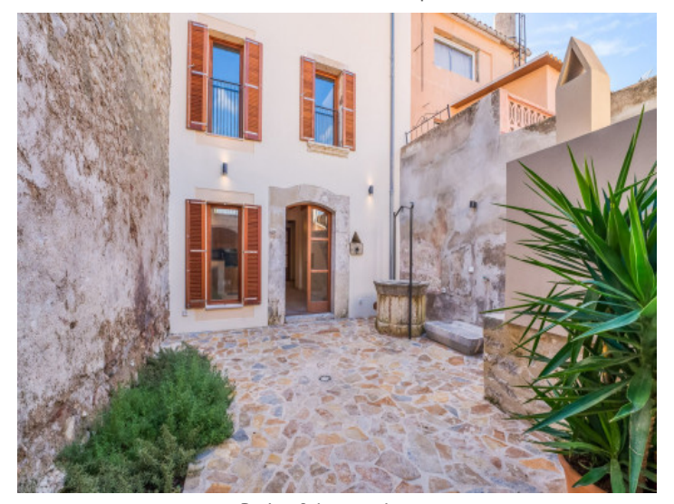
Patio of the townhouse