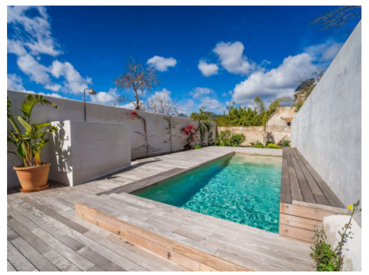
Private sun terrace with pool