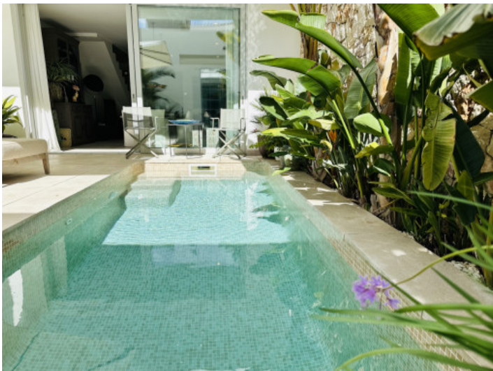
Patio and pool