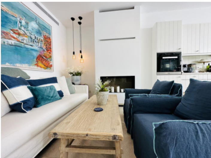
Relaxed living area