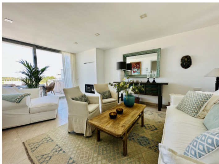
Living area at the rooftop floor