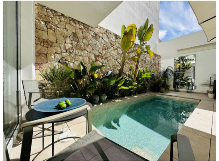
Patio and pool