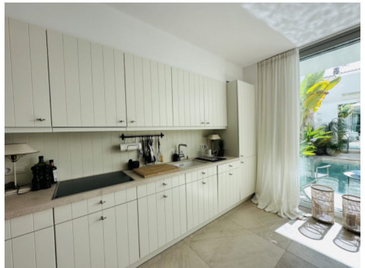
Country style kitchen