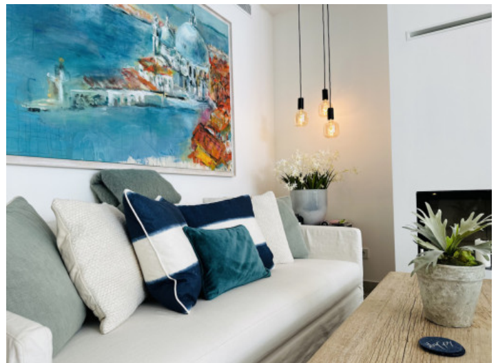
Beautiful living area

All information is correct to the best of our knowledge. Errors and prior sale excepted. This prospectus is purely for information purposes. Only the notarized deed of sale is legally binding.