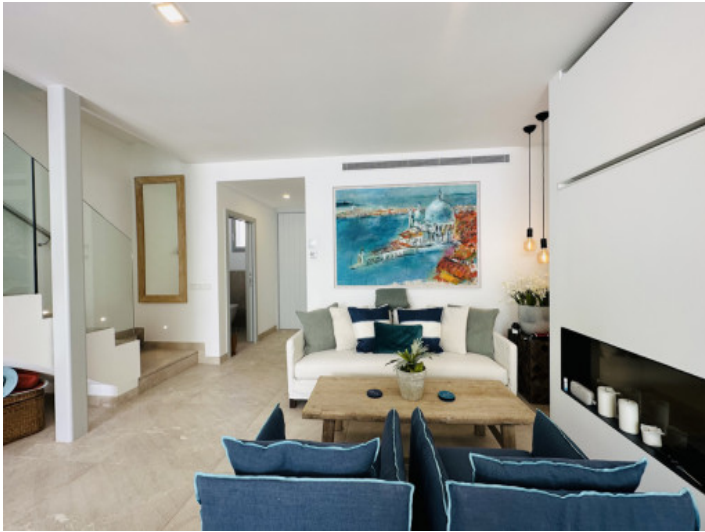
Open plan design