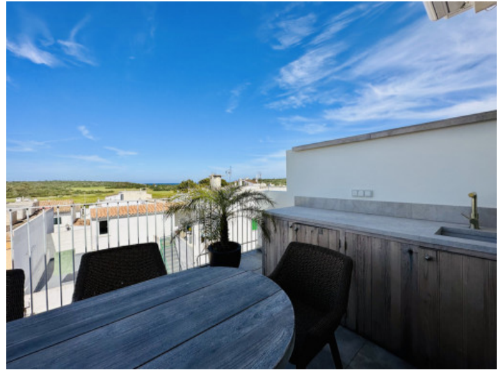
Rooftop terrace with outdoor kitchen