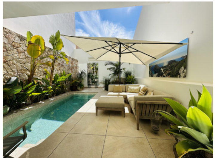
Patio and pool