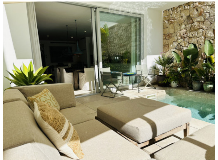
Comfortable outdoor lounge