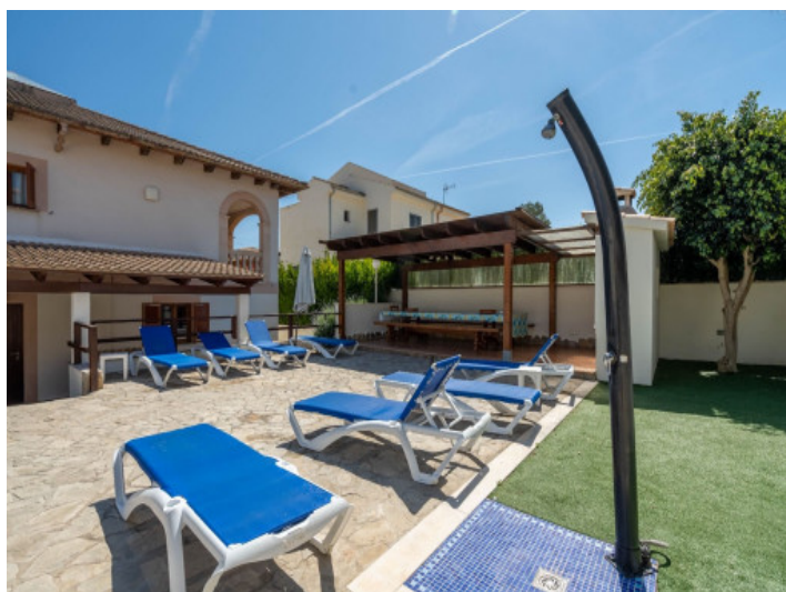
Sunny terrace with outdoor shower