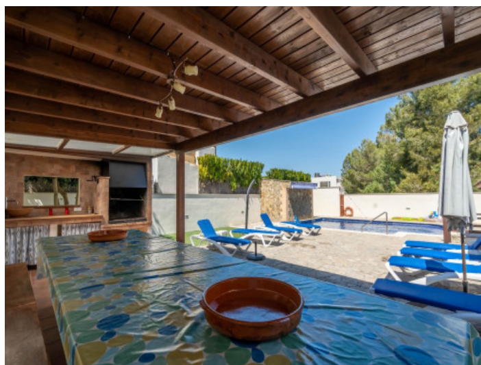
Covered terrace with BBQ area