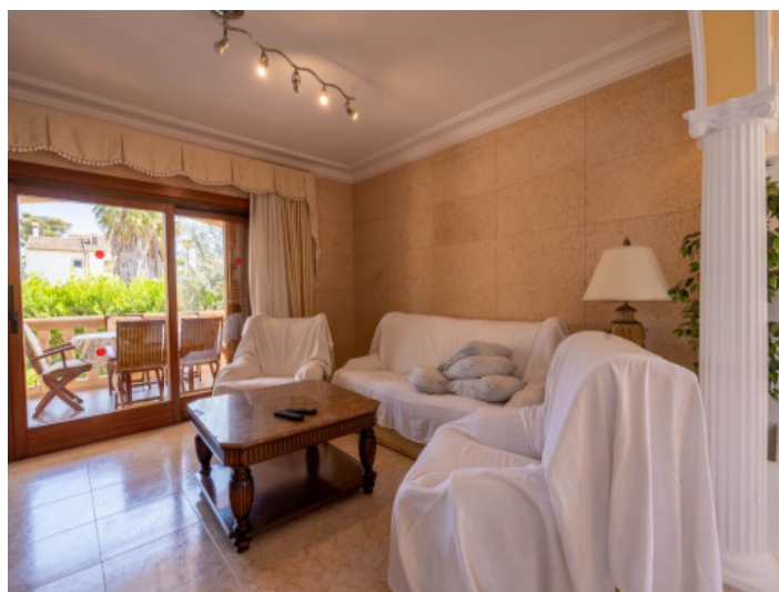
Living area with access to the terrace