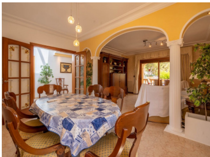
Elegant living and dining area