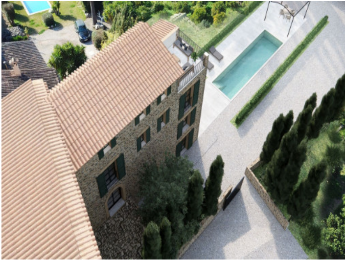
Pool and outdoor area