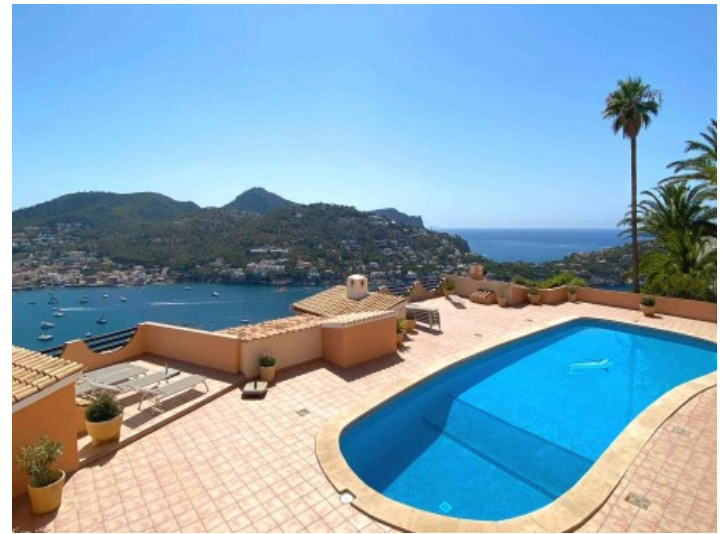
Sunny pool terrace