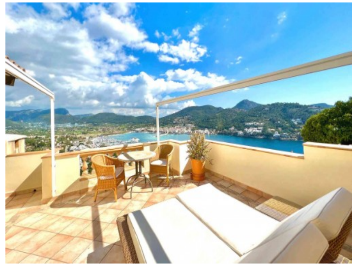
Roof terrace with a view