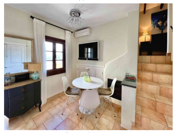
Separate dining area