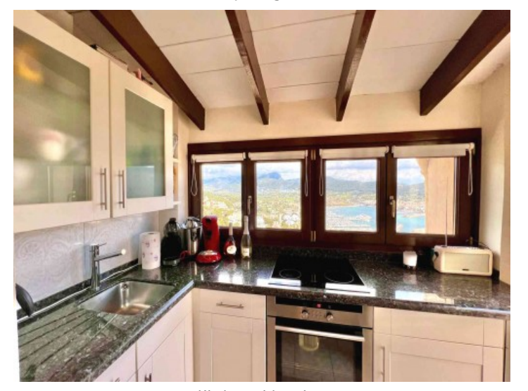
Kitchen with a view