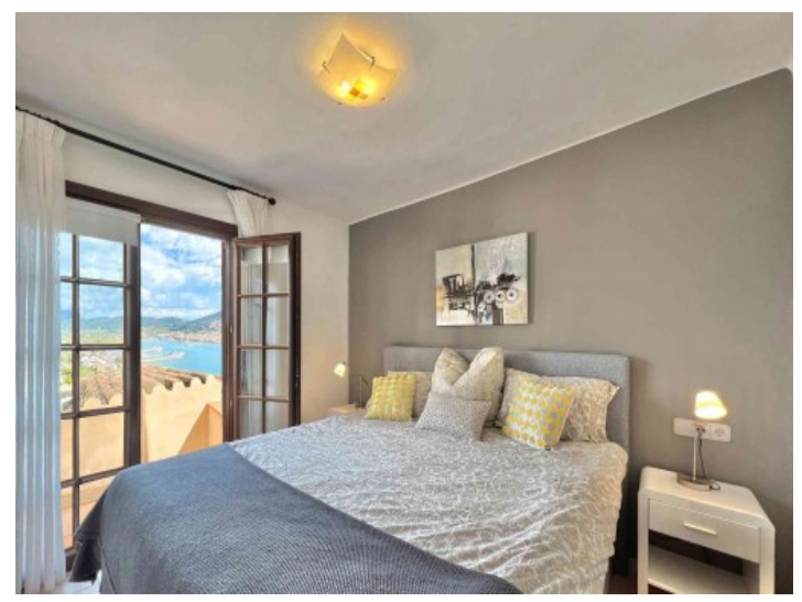
One of 3 double bedrooms