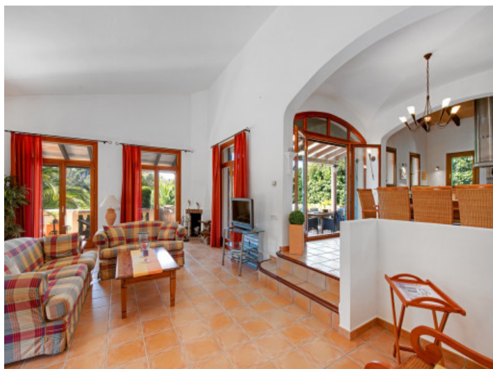
View to the dining area