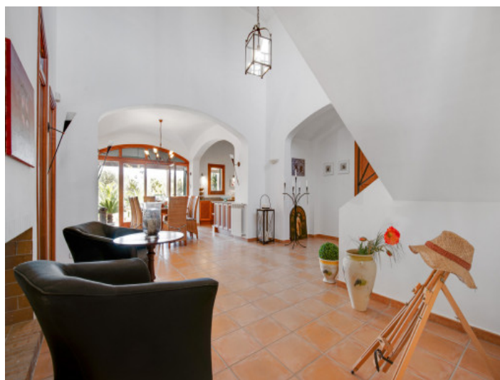
Open entrance and living area