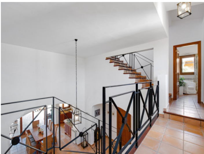
View from the gallery