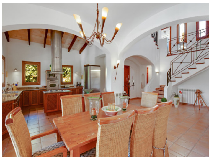
View to the entrance area