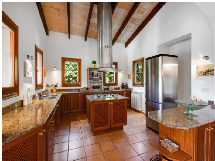
Rustic kitchen with cooking island