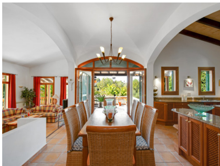
Dining area with access to the garden

All information is correct to the best of our knowledge. Errors and prior sale excepted. This prospectus is purely for information purposes. Only the notarized deed of sale is legally binding.