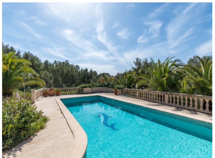
Large pool area

All information is correct to the best of our knowledge. Errors and prior sale excepted. This prospectus is purely for information purposes. Only the notarized deed of sale is legally binding.