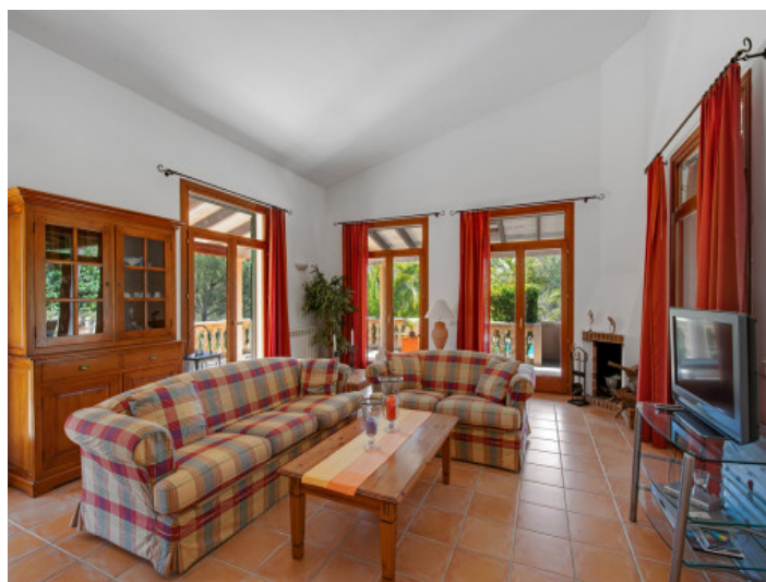
Cozy living area