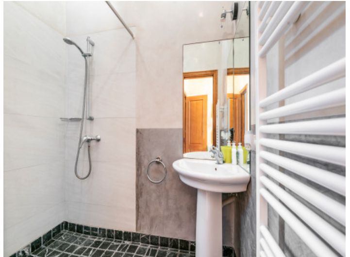
Bathroom with walk-in shower