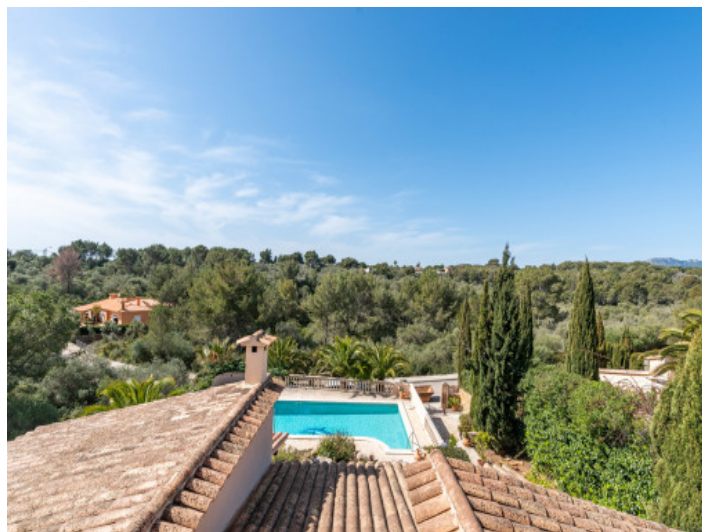
View from the upper floor