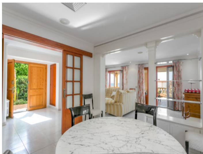
Spacious living and dining area