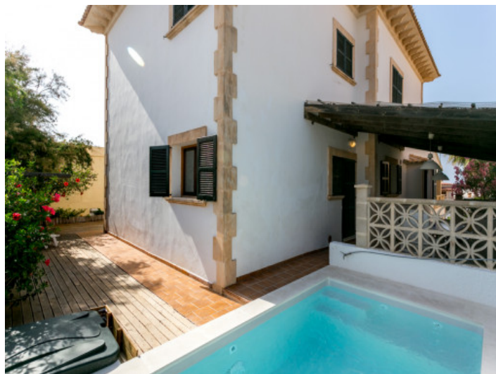
Terrace with small pool