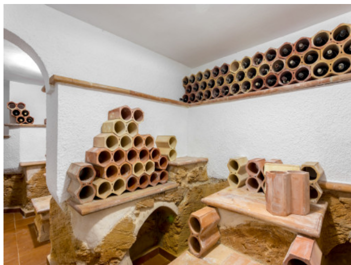
Own wine cellar

All information is correct to the best of our knowledge. Errors and prior sale excepted. This prospectus is purely for information purposes. Only the notarized deed of sale is legally binding.