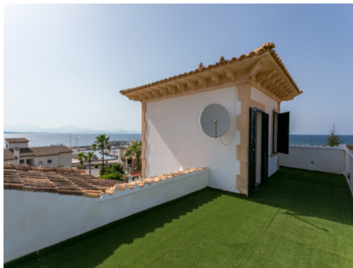
Roof terrace with fantastic sea views