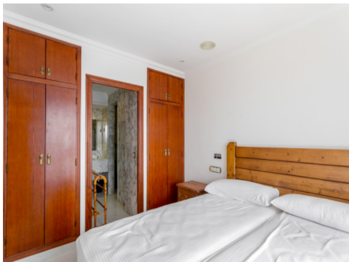
Further bedroom with built-in wardrobes