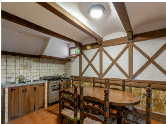
Rustic kitchen in the basement