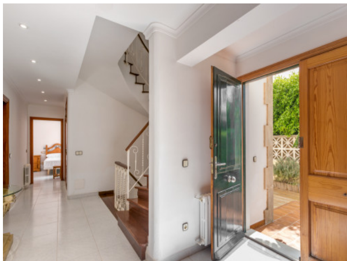
Entrance to the villa