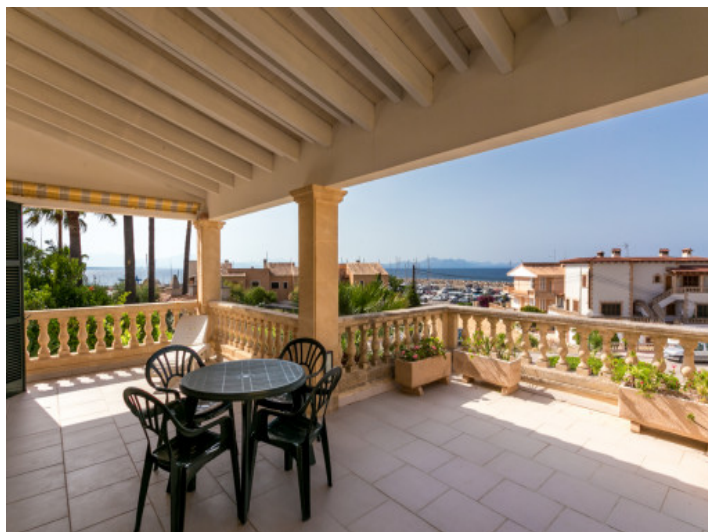
Large, covered terrace with sea views