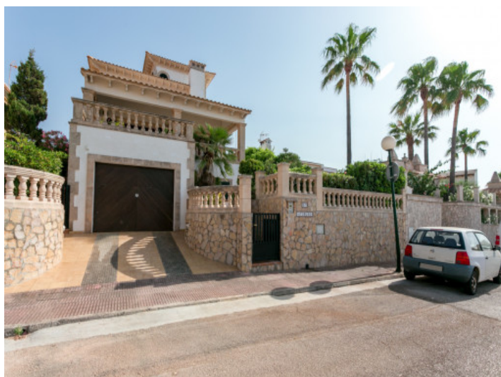
Exterior view of the villa