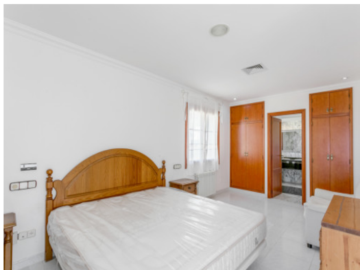
Double bedroom with bathroom en suite

All information is correct to the best of our knowledge. Errors and prior sale excepted. This prospectus is purely for information purposes. Only the notarized deed of sale is legally binding.