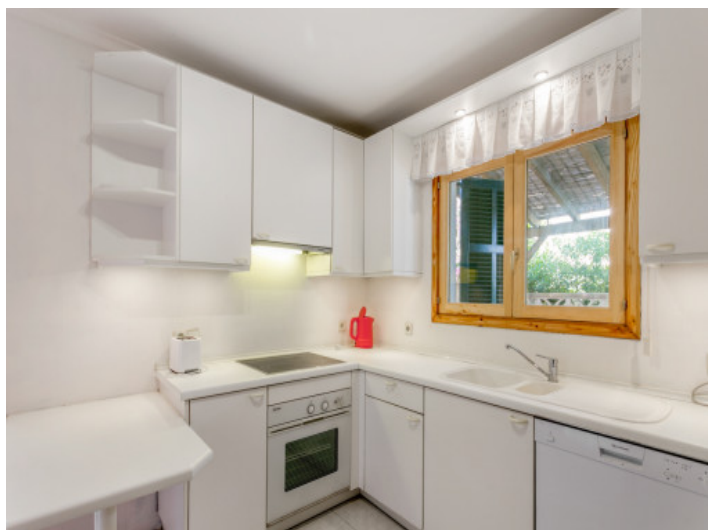
Fully fitted kitchen