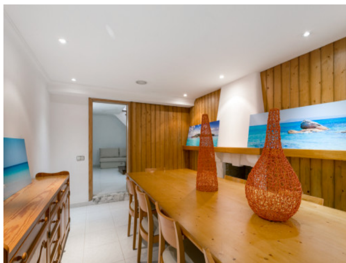
Large dining area in the basement