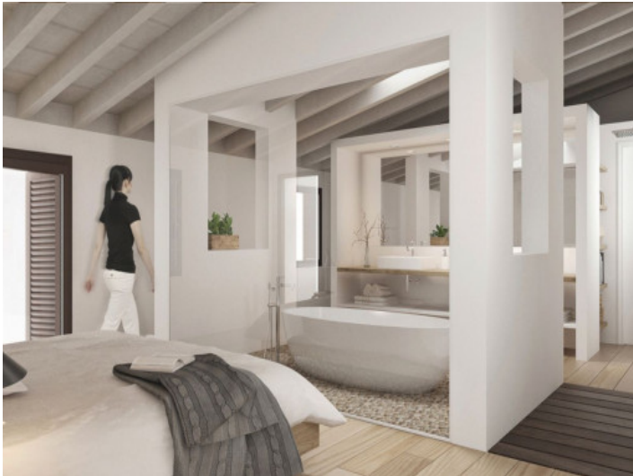
Bedroom with open bathroom en suite