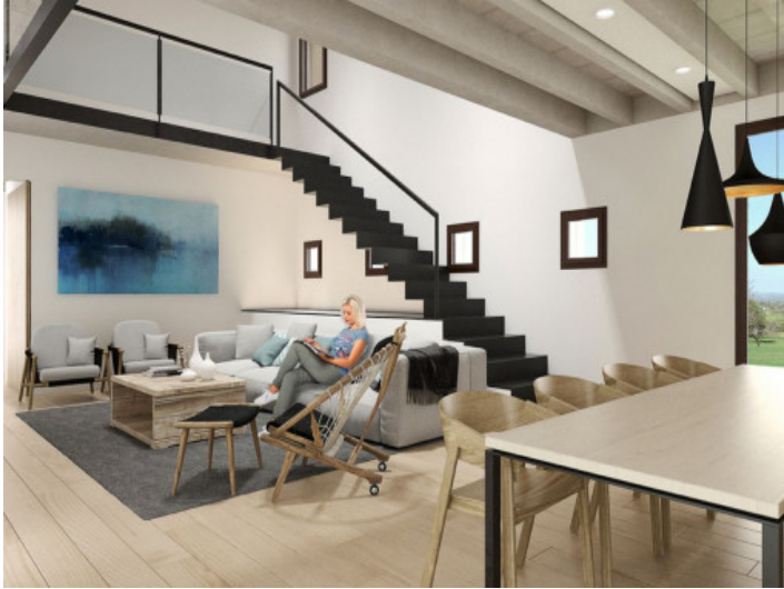
Modern interior design