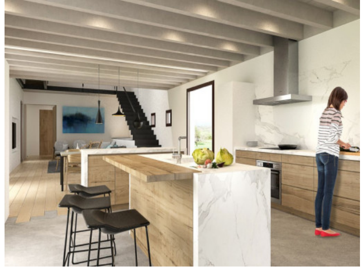
Total equipped interior design with cooking island