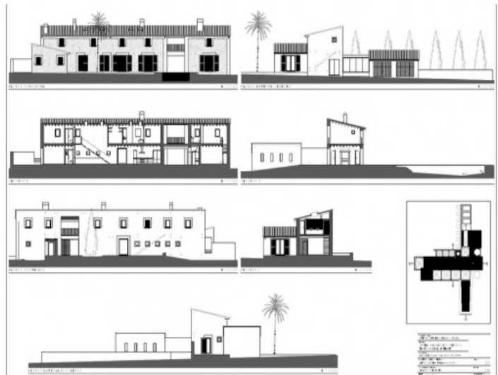
Floor plans II

All information is correct to the best of our knowledge. Errors and prior sale excepted. This prospectus is purely for information purposes. Only the notarized deed of sale is legally binding.