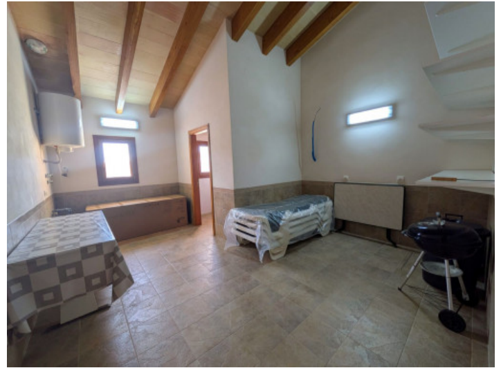
Large storage room