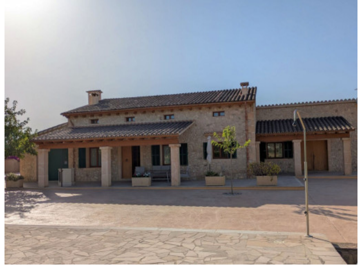
Front view of the finca