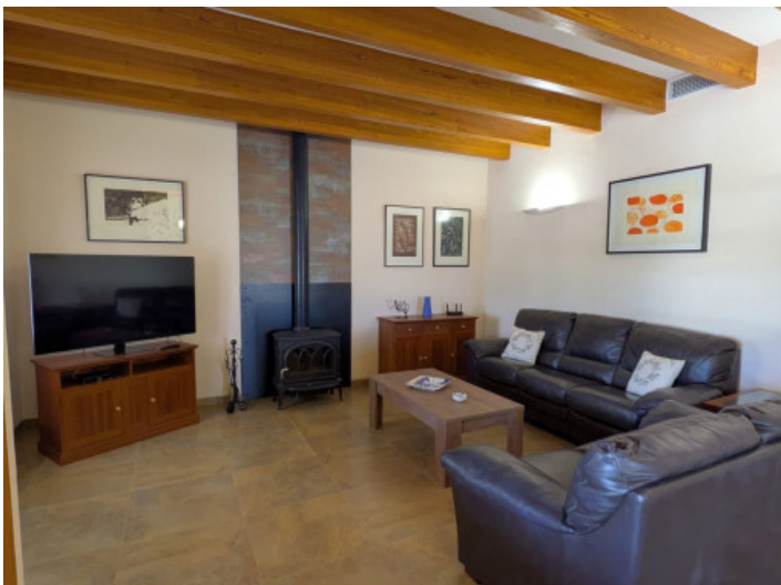
Living room with fireplace