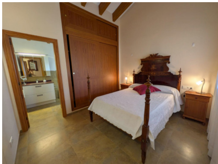
Master bedroom with en-suite bathroom