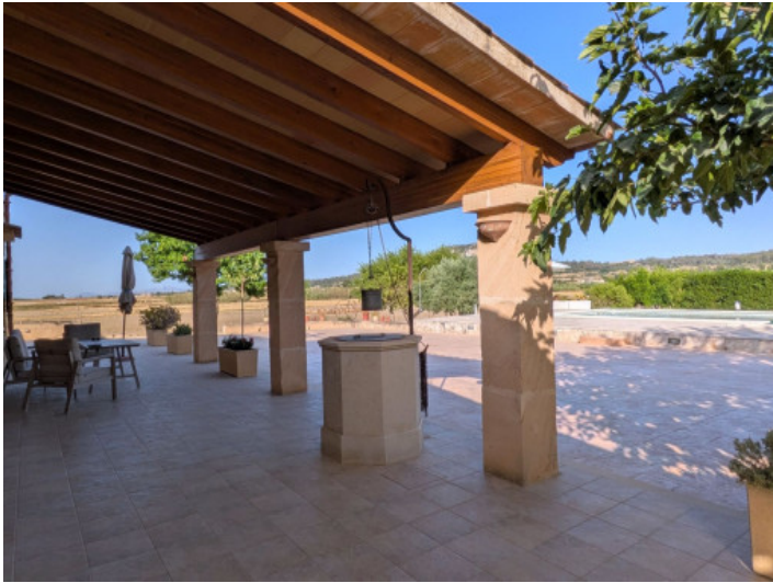
Large outdoor terrace