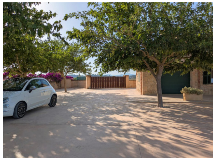
Driveway to the finca

All information is correct to the best of our knowledge. Errors and prior sale excepted. This prospectus is purely for information purposes. Only the notarized deed of sale is legally binding.