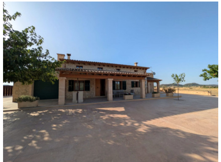
Front view of the finca