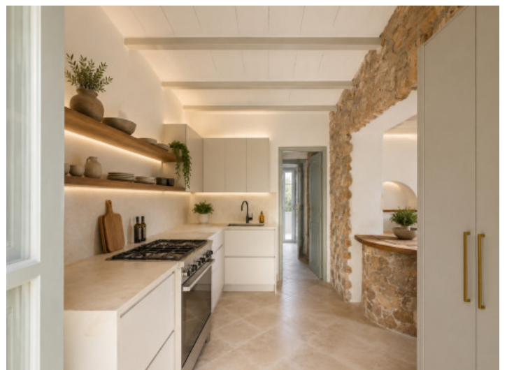
Concept Image (AI)

All information is correct to the best of our knowledge. Errors and prior sale excepted. This prospectus is purely for information purposes. Only the notarized deed of sale is legally binding.