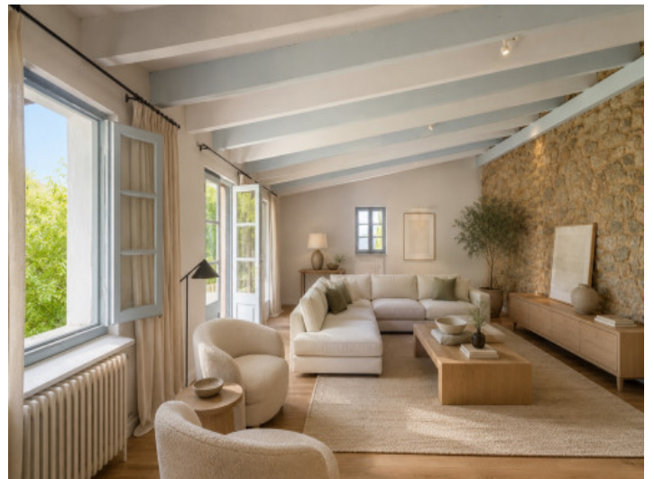
Concept Image (AI)