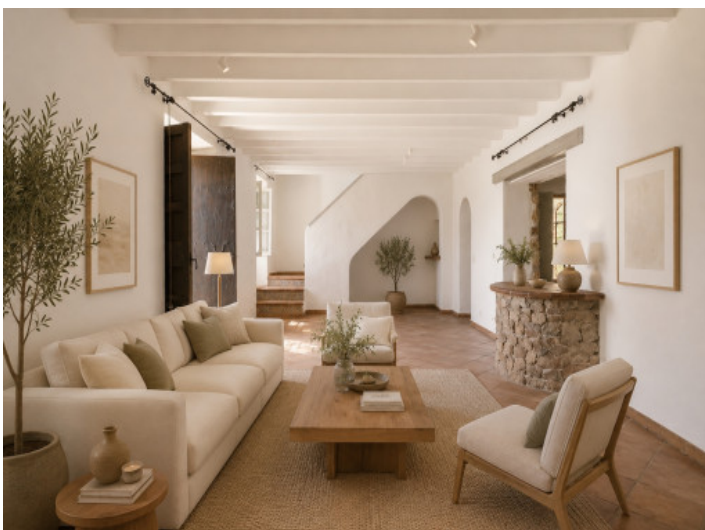
Concept Image (AI)