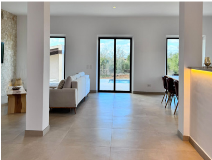
Wohn- und Essbereich