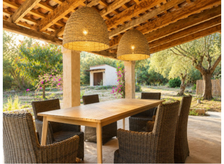
Covered terrace with nature views