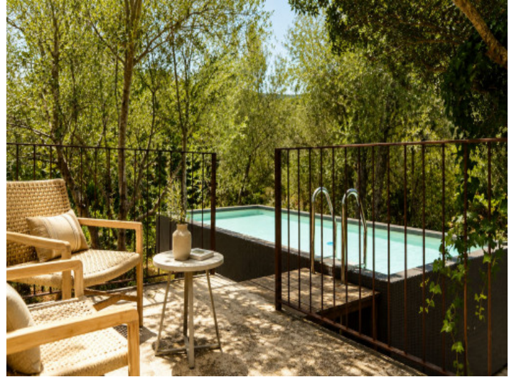
Private outdoor area with pool