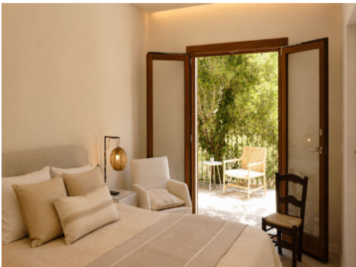
Master-bedroom with access to the terrace and the swimming pool