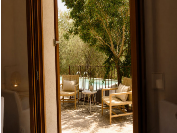
Seating area at the sun terrace