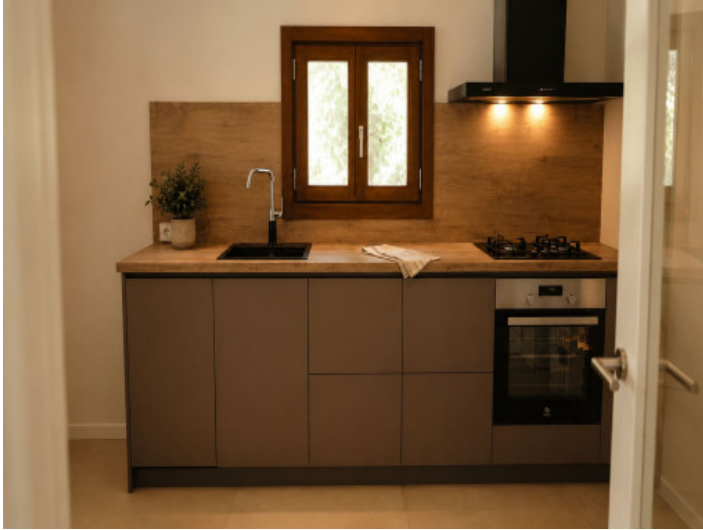
Fully-equipped open kitchen