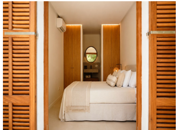
Master-bedroom with bathroom en-suite