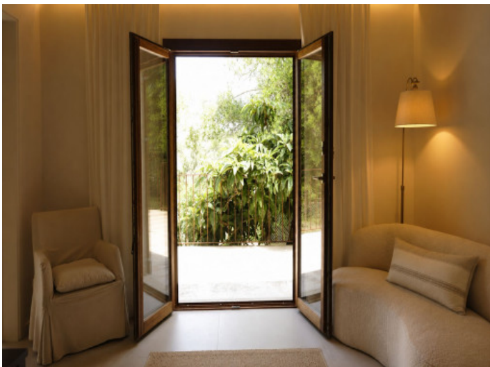
Living area with access to the sun terrace