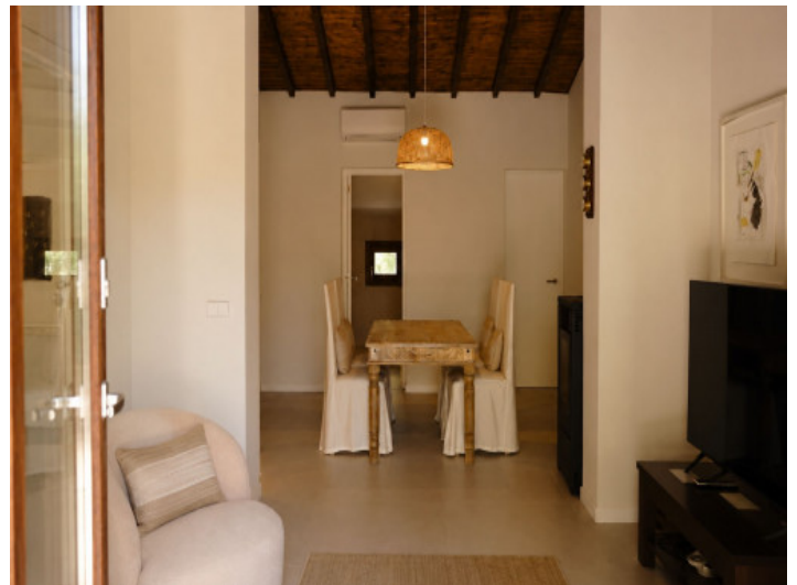
Open living-dining area with pellet stove heating