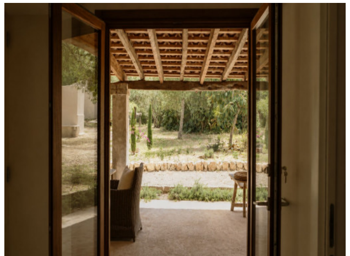
Outdoor terrace with seating area

All information is correct to the best of our knowledge. Errors and prior sale excepted. This prospectus is purely for information purposes. Only the notarized deed of sale is legally binding.