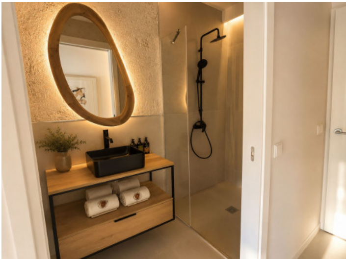
Bathroom of the second bedroom