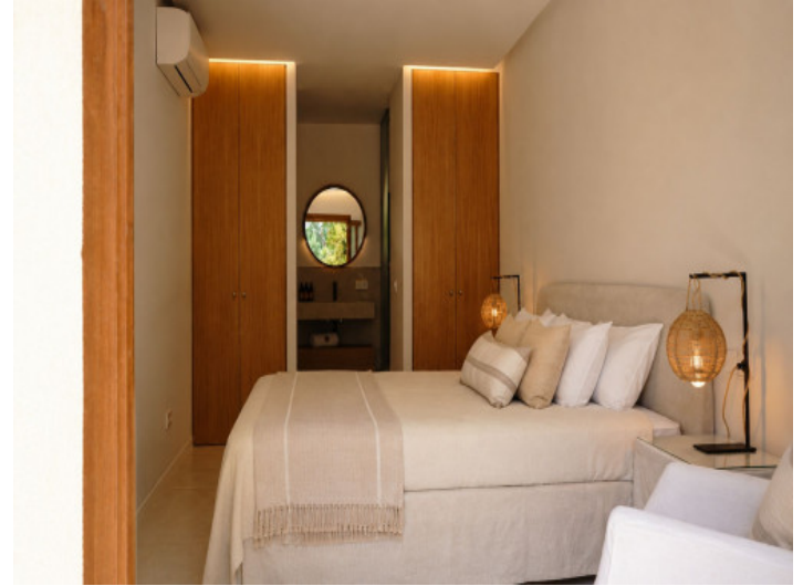
Master-bedroom with bathroom en-suite