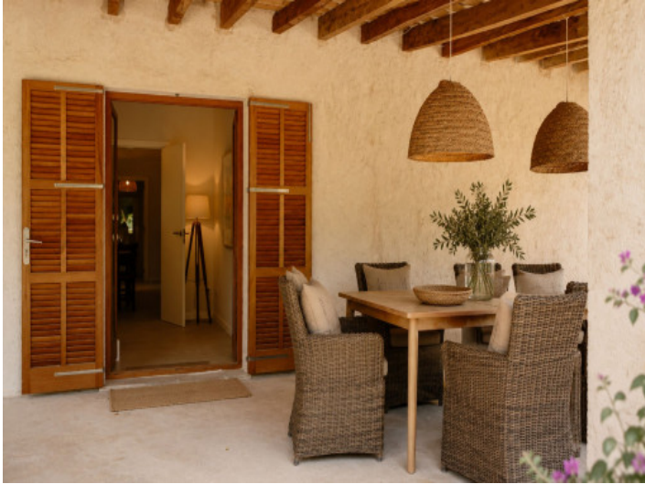
Covered terrace in front of the house