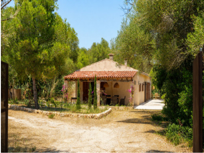
Driveway to the finca