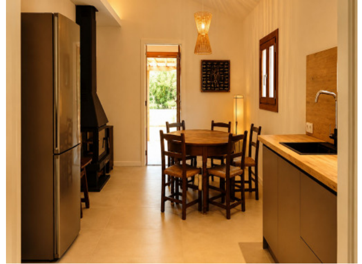
Dining area with chimney