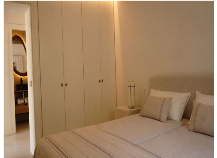
Second Bedroom with built-in wardrobe