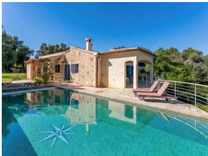
Main view of the finca