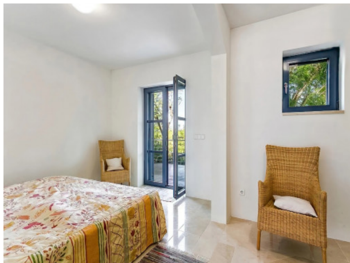
Second guest bedroom