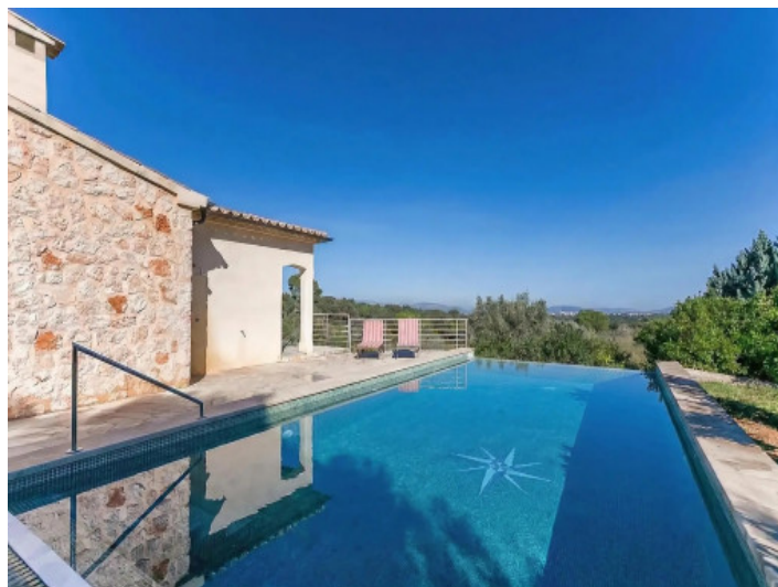
Swimming pool with views across Muro all the way to Alcudia