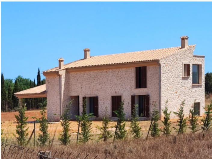
Back of the house