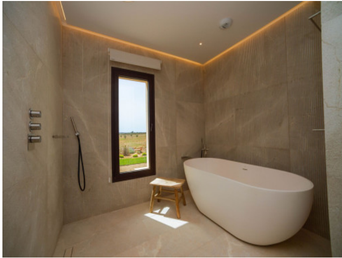
Master bathroom with natural stone finishes and bathtub