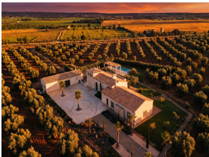
Sunset aerial view over the estate with pool and olive grove