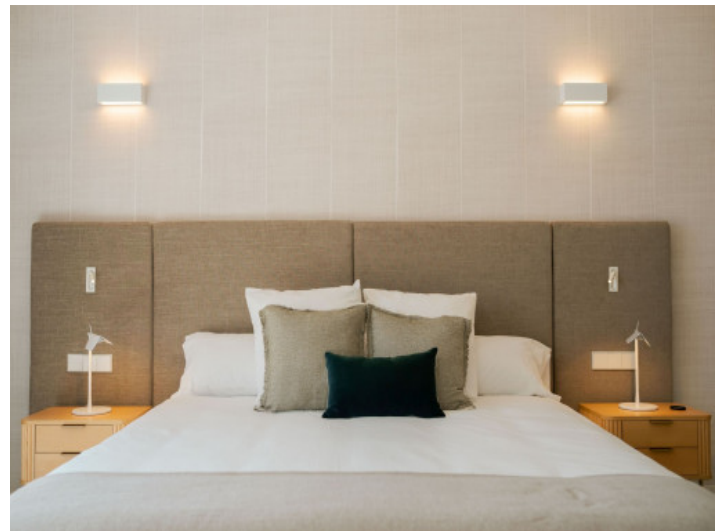
Luxurious master bedroom with serene atmosphere