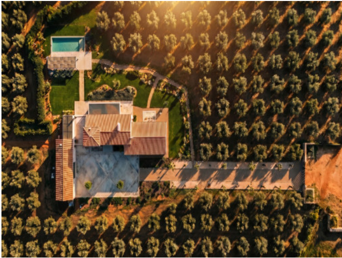
Impressive bird's-eye view over the entire estate