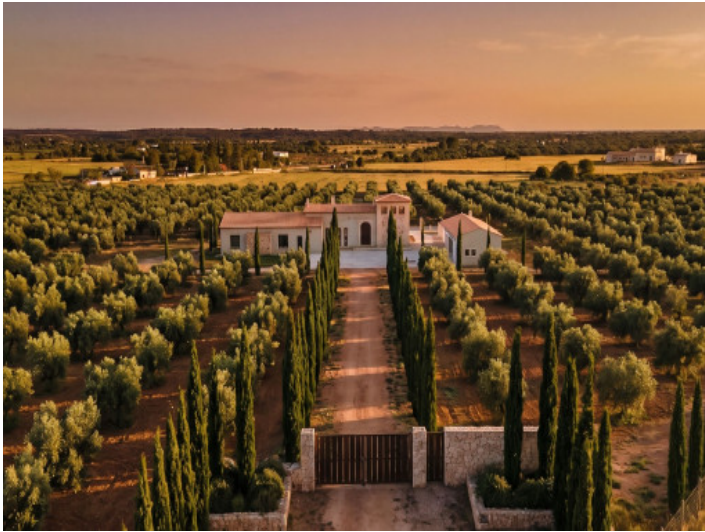
Elegant driveway leading to the estate