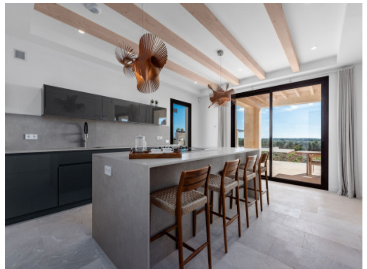
High-end designer kitchen with Gaggenau appliances

All information is correct to the best of our knowledge. Errors and prior sale excepted. This prospectus is purely for information purposes. Only the notarized deed of sale is legally binding.