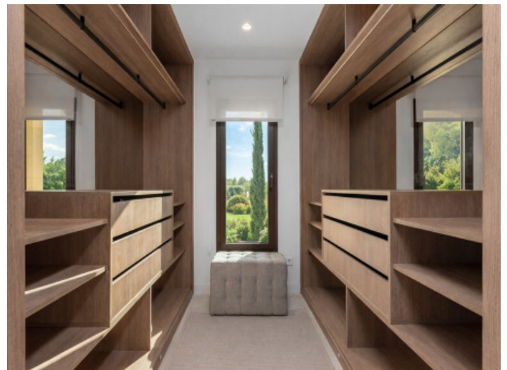
Walk-in wardrobe with ample storage

All information is correct to the best of our knowledge. Errors and prior sale excepted. This prospectus is purely for information purposes. Only the notarized deed of sale is legally binding.