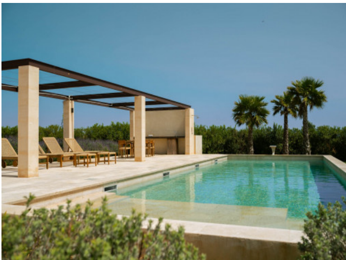
Exclusive saltwater pool in a refined setting