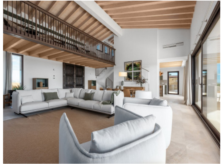
Bright living area with gallery