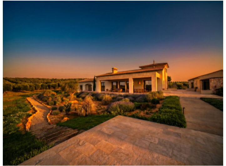
Terrace at sunset with a unique ambiance