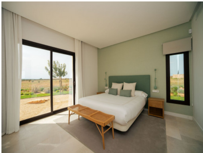
Three comfortable guest bedrooms with elegant ambiance