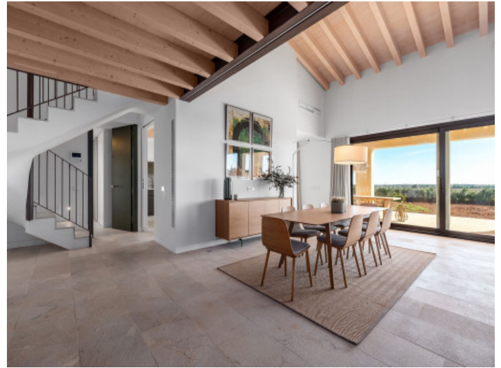
Integrated dining area within the living area