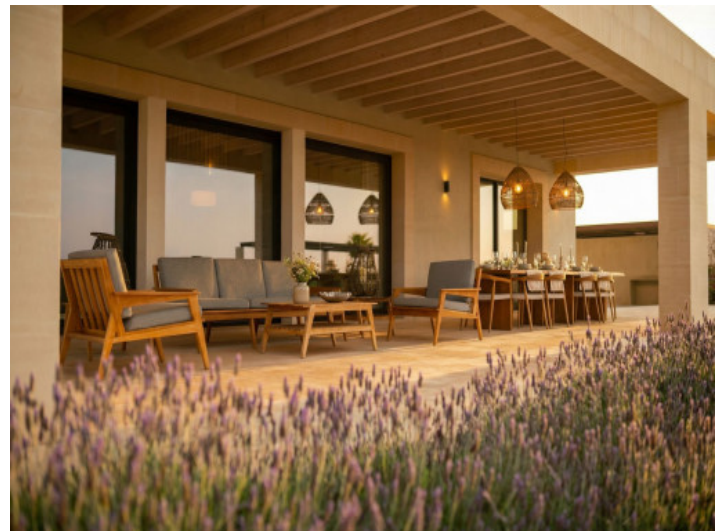
Spacious terrace with lavender garden and Mediterranean ambiance