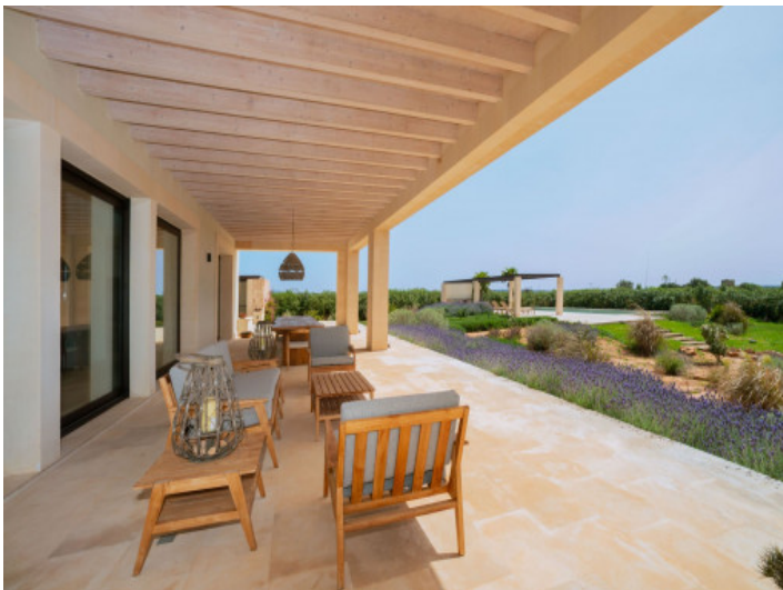
Elegant terrace overlooking the Mediterranean garden and pool