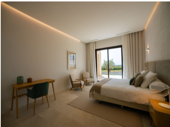
Harmonious interior design