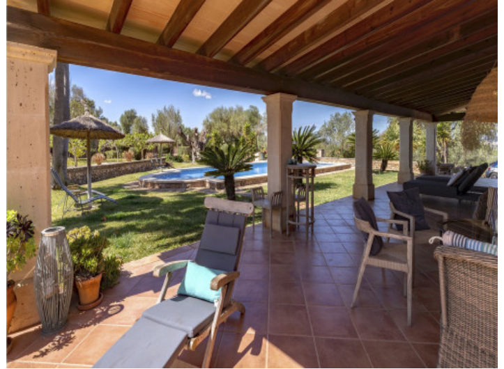
Big covered terrace