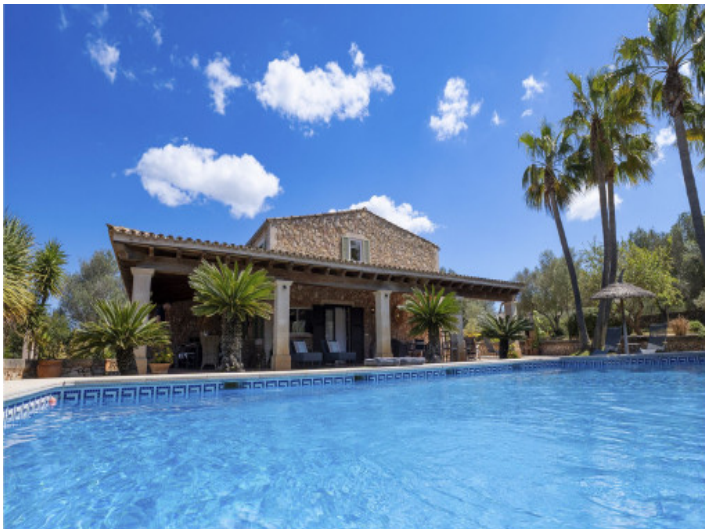
Countryhouse with pool