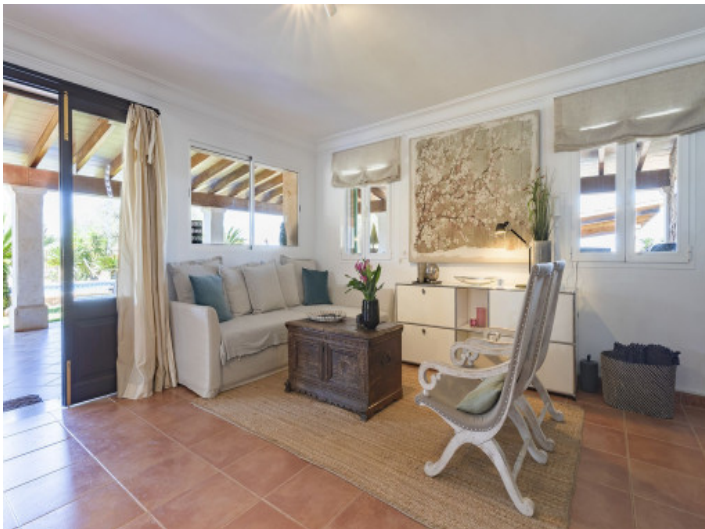
Living space with exit to the terrace