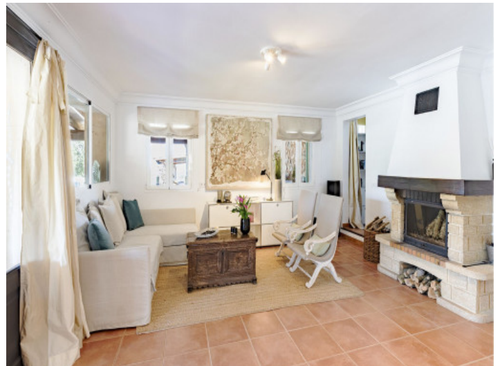
Open Living space

All information is correct to the best of our knowledge. Errors and prior sale excepted. This prospectus is purely for information purposes. Only the notarized deed of sale is legally binding.