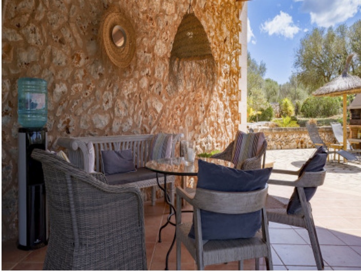
Large covered terrace