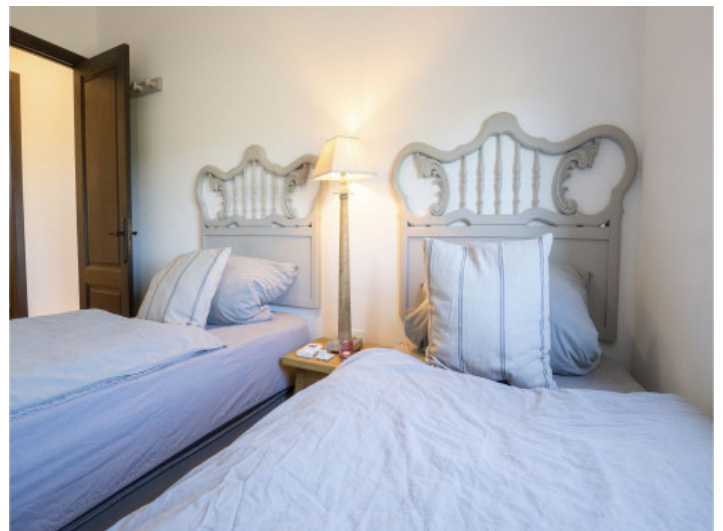
One of four bedrooms

All information is correct to the best of our knowledge. Errors and prior sale excepted. This prospectus is purely for information purposes. Only the notarized deed of sale is legally binding.