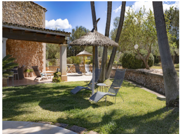
Sunplace near the pool