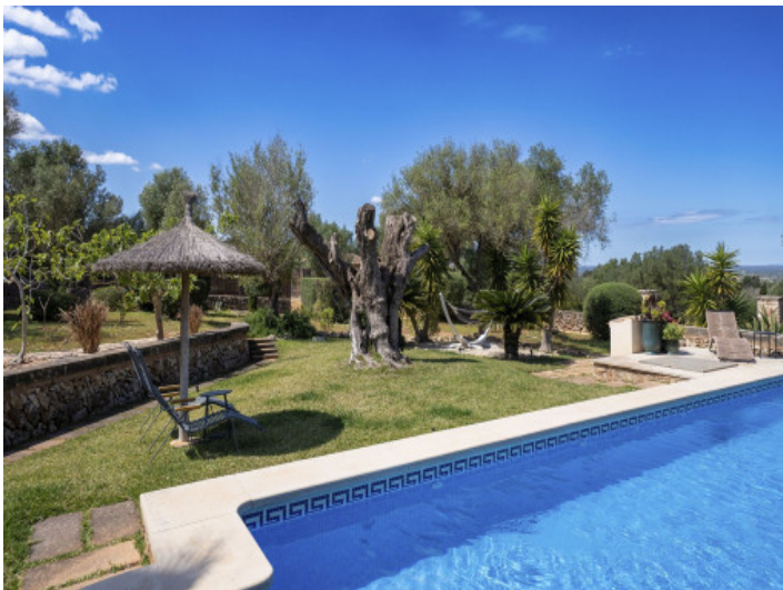
Nice maintained garden