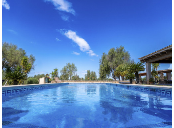
Nice large pool