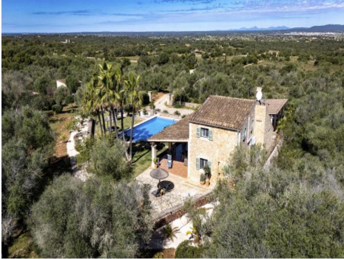
Nice Finca with views