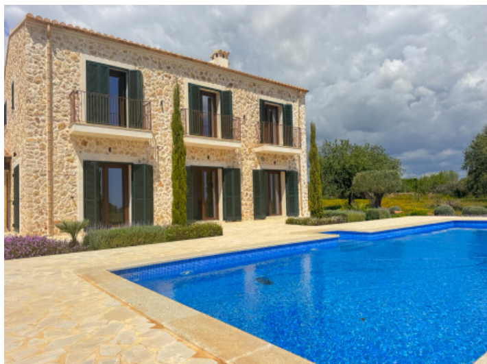
Finca Llucmajor Pool