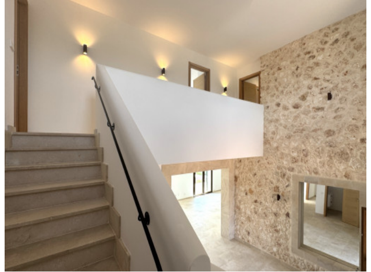
Finca Llucmajor Entrance