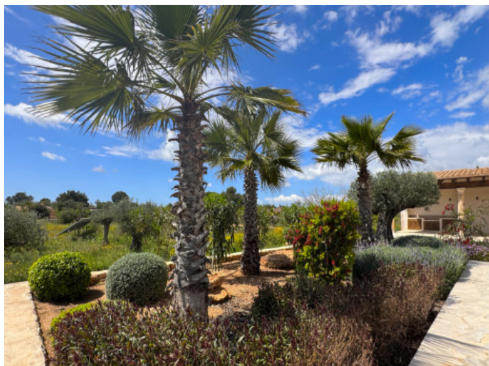
Finca Llucmajor Garden