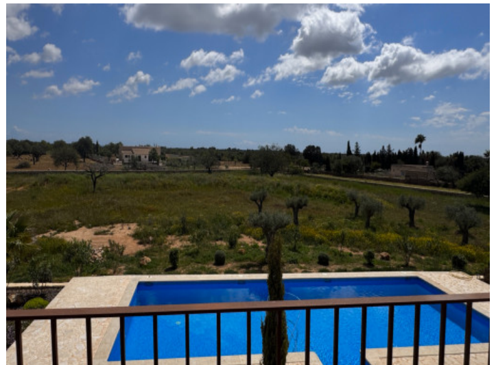
Finca Llucmajor View