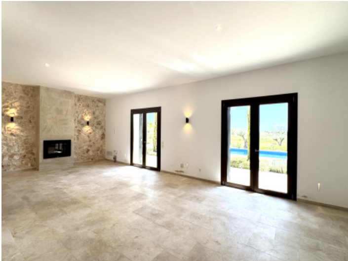
Finca Llucmajor Livingroom