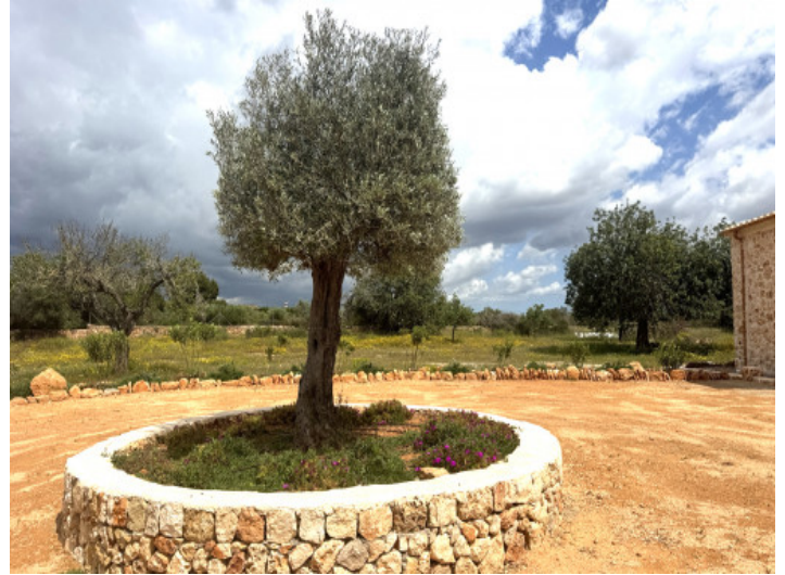
Finca Llucmajor Olive