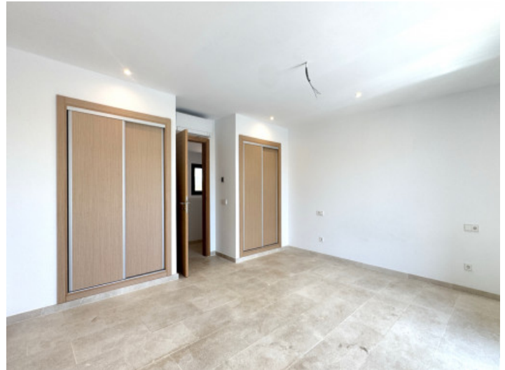
Finca Llucmajor Bedroom