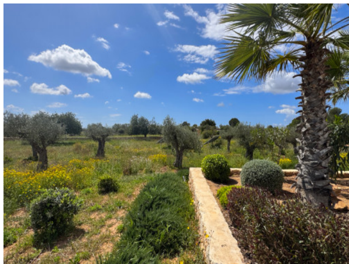
Finca Llucmajor Garden