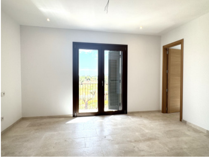
Finca Llucmajor Bedroom