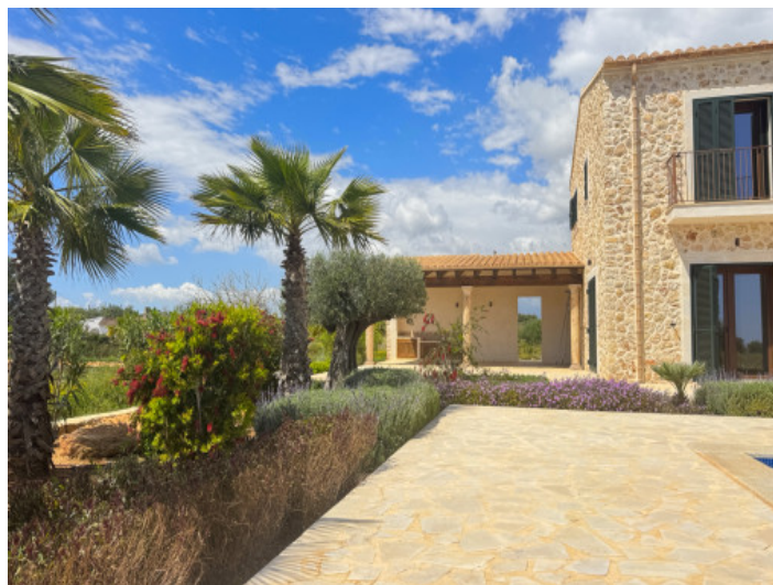
Finca Llucmajor BBQ