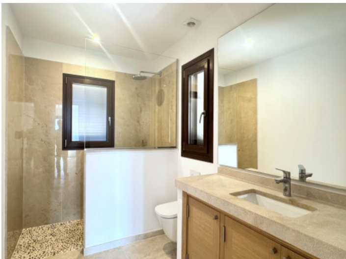
Finca Llucmajor Bathroom