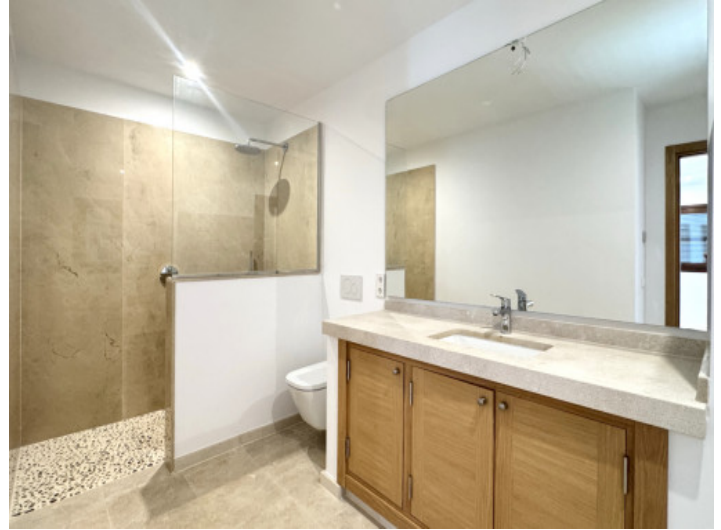
Finca Llucmajor Bathroom