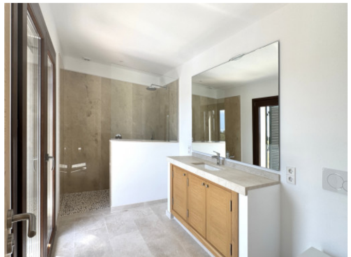
Finca Llucmajor Bathroom

All information is correct to the best of our knowledge. Errors and prior sale excepted. This prospectus is purely for information purposes. Only the notarized deed of sale is legally binding.