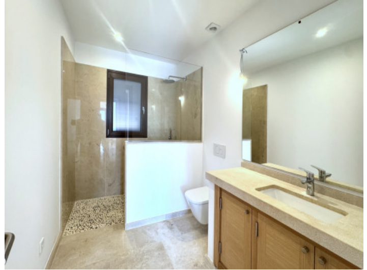
Finca Llucmajor Bathroom