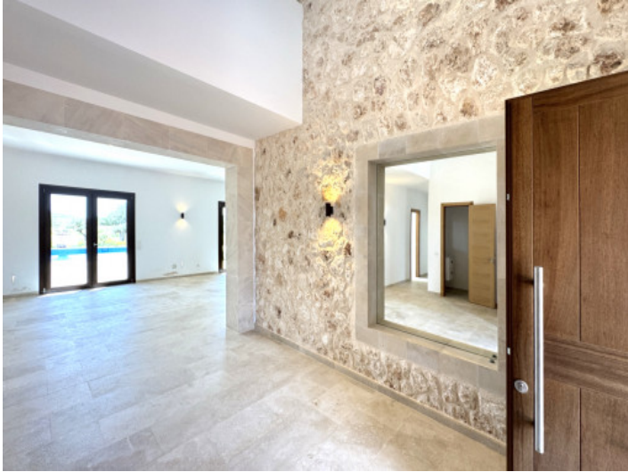
Finca Llucmajor Entrance