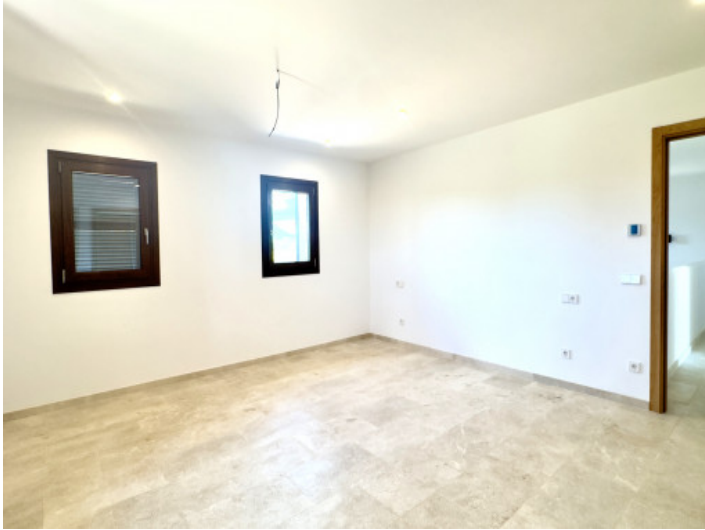
Finca Llucmajor Bedroom