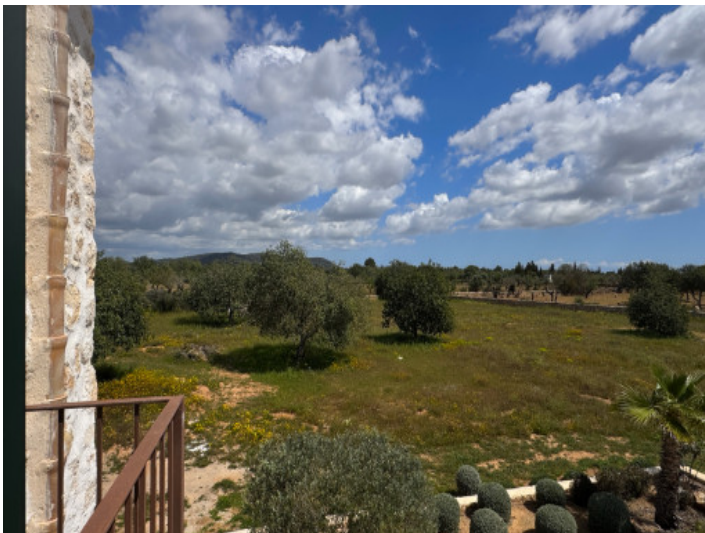
Finca Llucmajor View