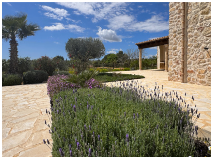
Finca Llucmajor Terrasse