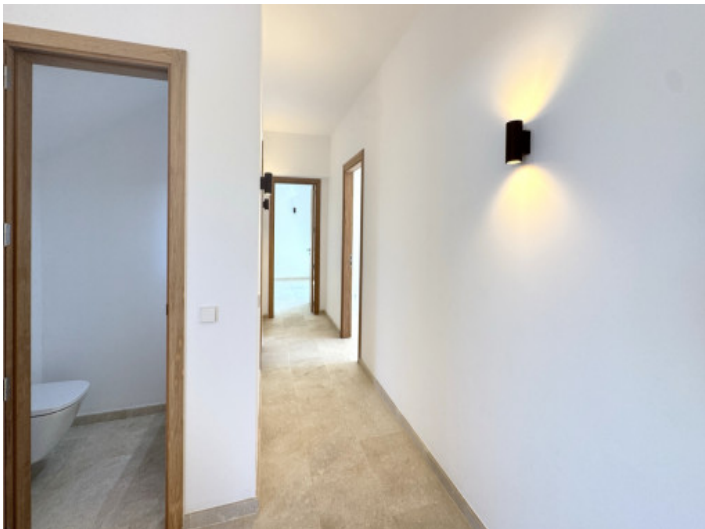
Finca Llucmajor Pathway