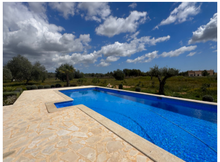
Finca Llucmajor Pool

All information is correct to the best of our knowledge. Errors and prior sale excepted. This prospectus is purely for information purposes. Only the notarized deed of sale is legally binding.