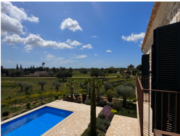
Finca Llucmajor View