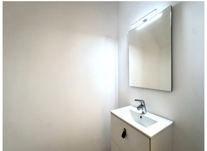
Finca Llucmajor 00

All information is correct to the best of our knowledge. Errors and prior sale excepted. This prospectus is purely for information purposes. Only the notarized deed of sale is legally binding.