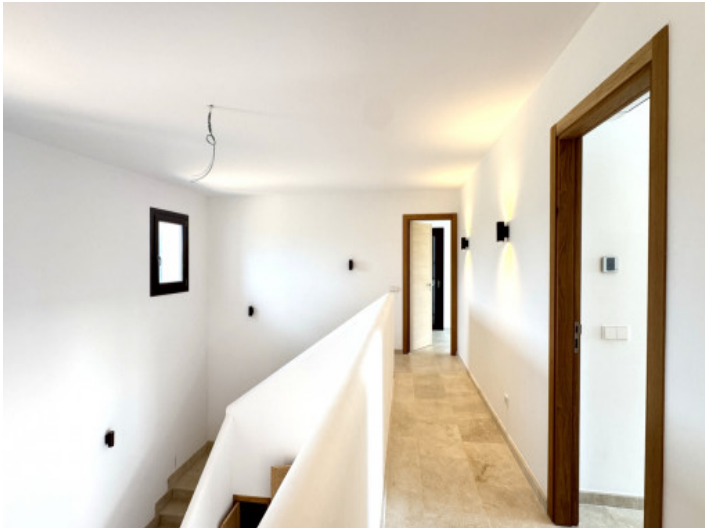
Finca Llucmajor Galerie