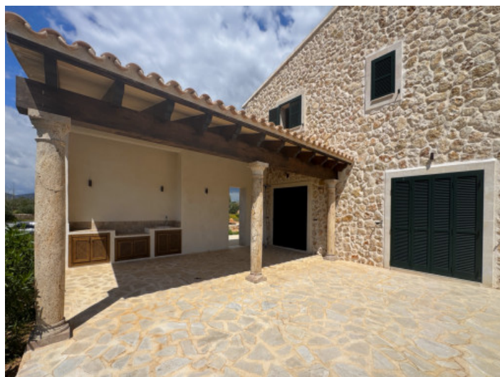
Finca Llucmajor BBQ

All information is correct to the best of our knowledge. Errors and prior sale excepted. This prospectus is purely for information purposes. Only the notarized deed of sale is legally binding.