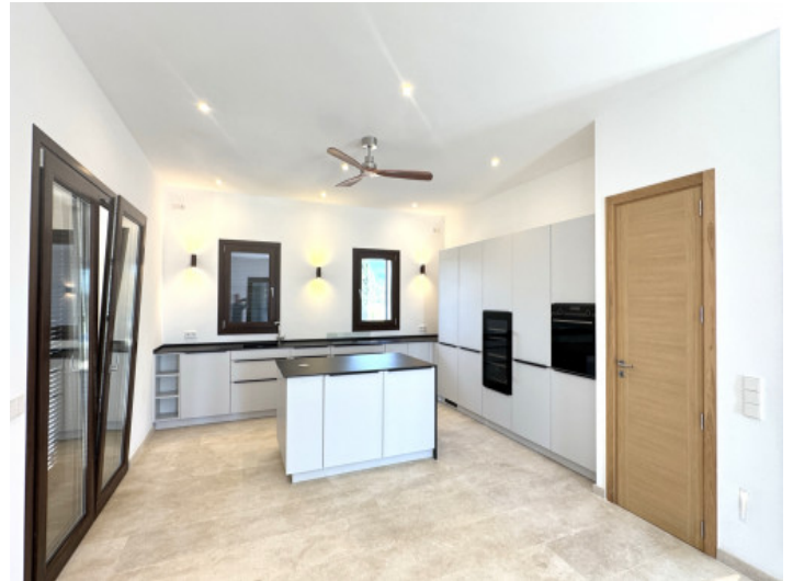
Finca Llucmajor Kitchen