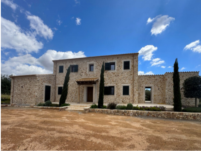
Finca Llucmajor Entrance