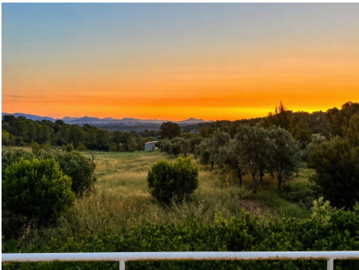
Sunset to the west