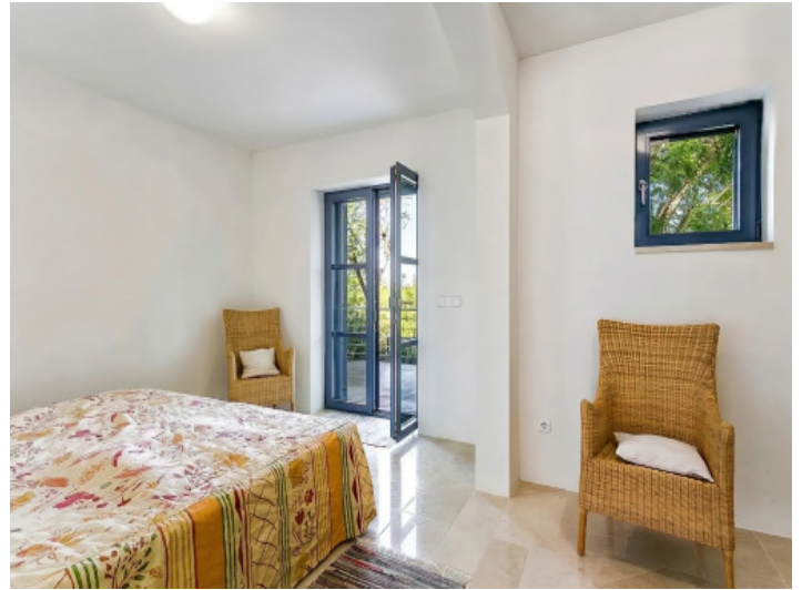
Second guest bedroom