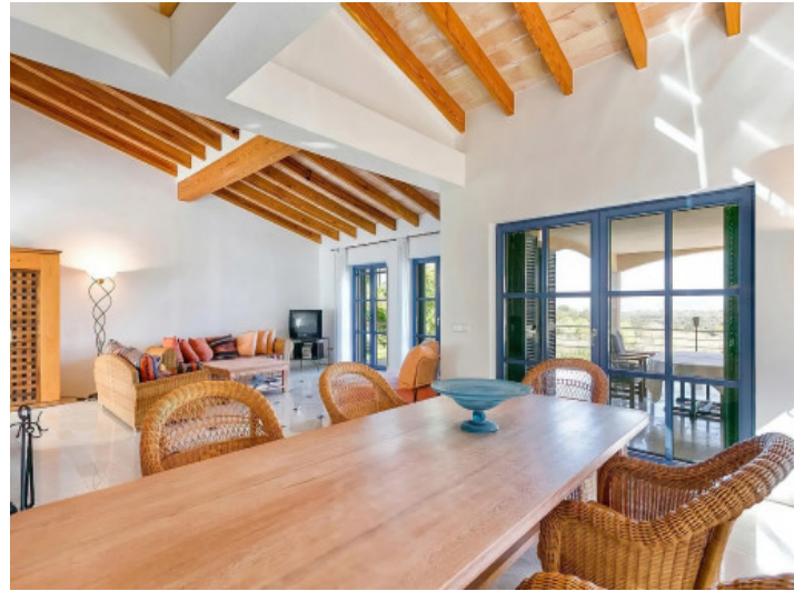
Dining area with access to the covered terrace