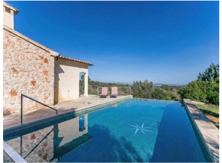
Swimming pool with views across Muro all the way to Alcudia