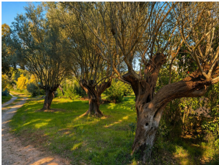
Driveway lined with olive trees

All information is correct to the best of our knowledge. Errors and prior sale excepted. This prospectus is purely for information purposes. Only the notarized deed of sale is legally binding.