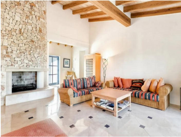
The living room combines rustic and modern style