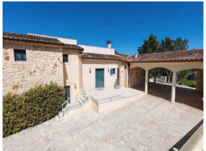
Entrance area and parking spaces