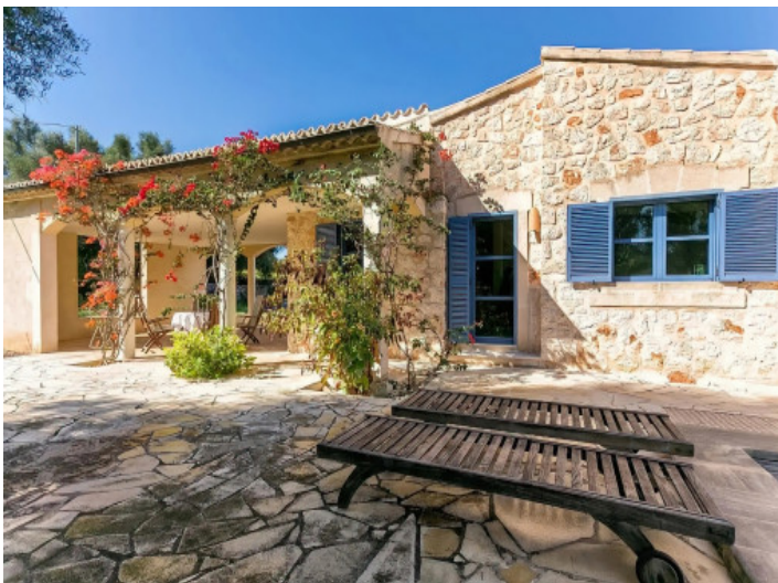
View of the house from the pool deck