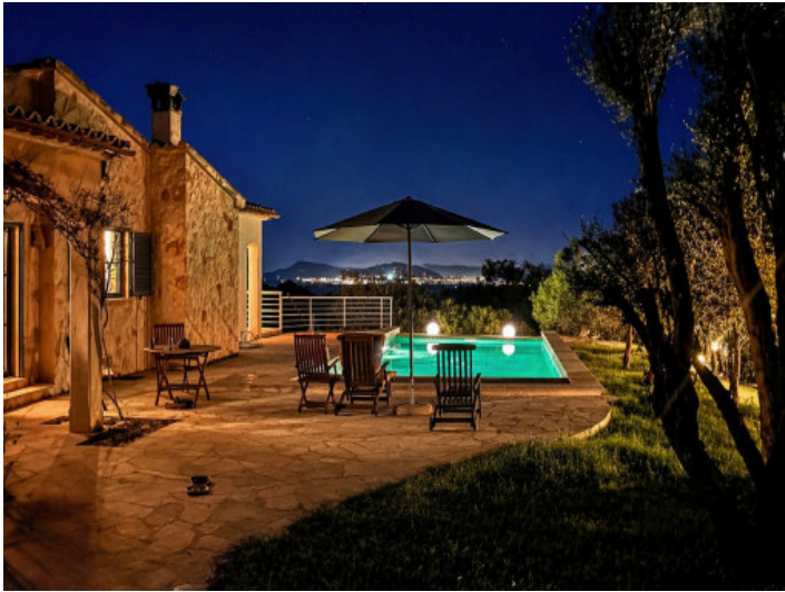
Pool at night