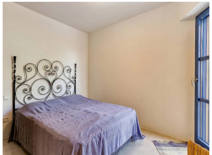
First guest bedroom

All information is correct to the best of our knowledge. Errors and prior sale excepted. This prospectus is purely for information purposes. Only the notarized deed of sale is legally binding.