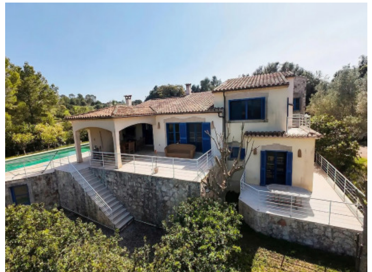
Overall view of the finca