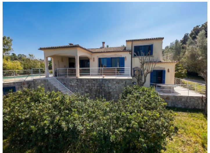
View of the house from the garden

All information is correct to the best of our knowledge. Errors and prior sale excepted. This prospectus is purely for information purposes. Only the notarized deed of sale is legally binding.