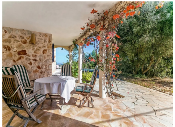
Covered seating areas

All information is correct to the best of our knowledge. Errors and prior sale excepted. This prospectus is purely for information purposes. Only the notarized deed of sale is legally binding.