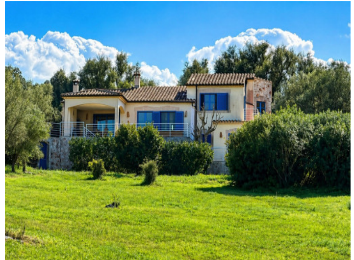
View of the house from the lower part of the plot