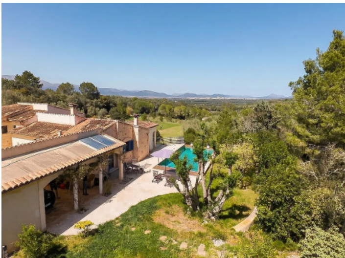
Wonderful view from the pool level