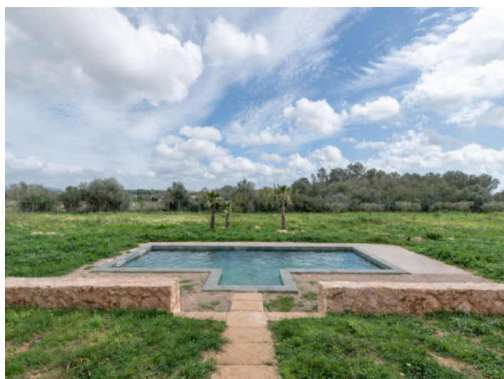
Pool with views

All information is correct to the best of our knowledge. Errors and prior sale excepted. This prospectus is purely for information purposes. Only the notarized deed of sale is legally binding.