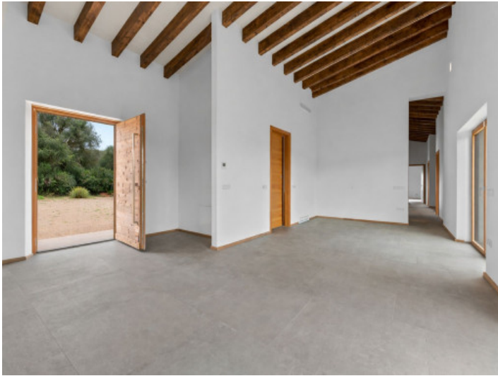
Kitchen and entrance area