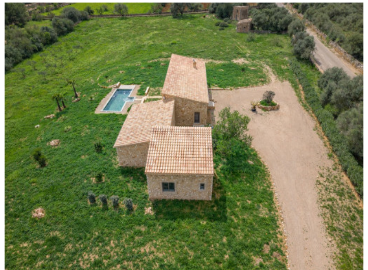
Generous landscaped garden