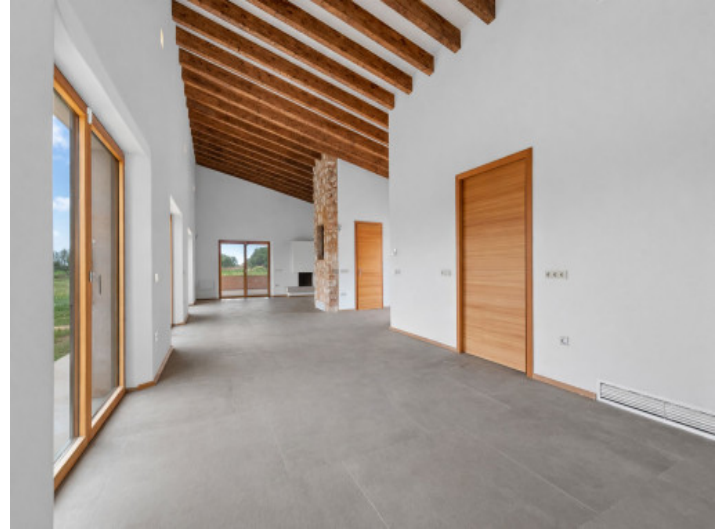
Kitchen with pre-installation for a kitchen island