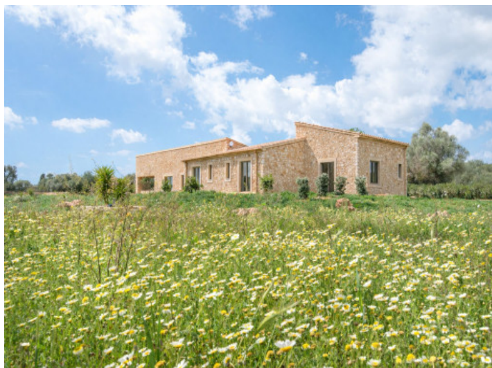
House with plenty of privacy