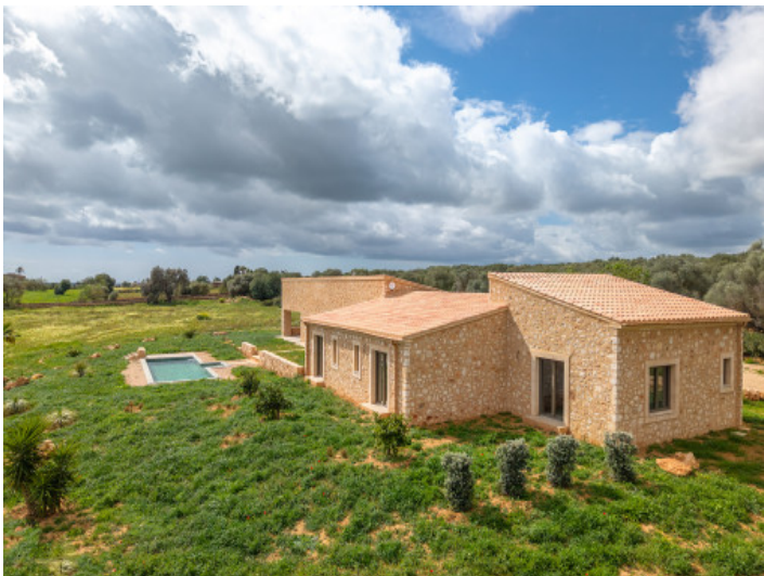
Natural stone façade