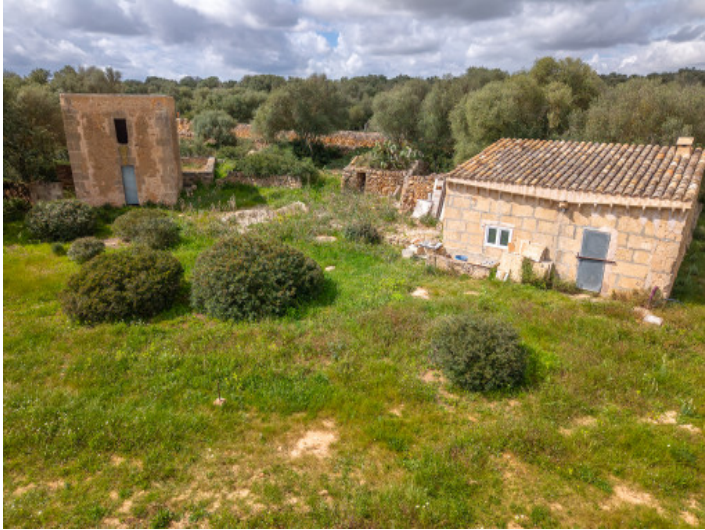
Authentic historic water mill on the property