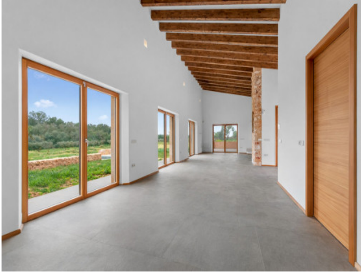
Kitchen with open concept