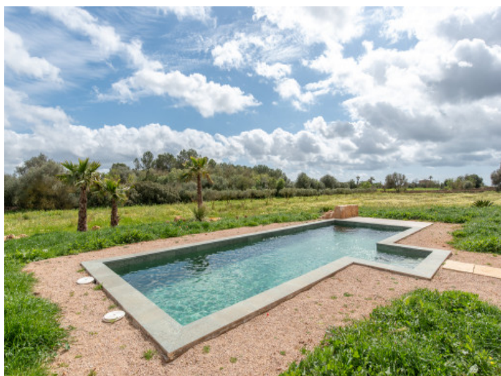
Pool and garden