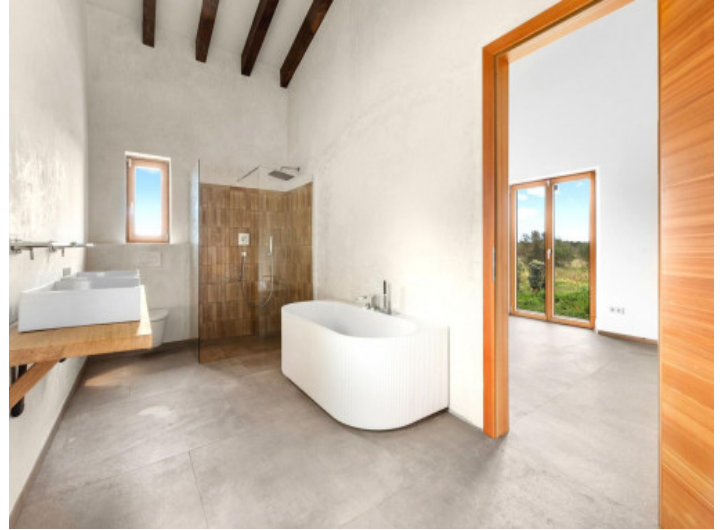
Master bathroom with bathtub and shower