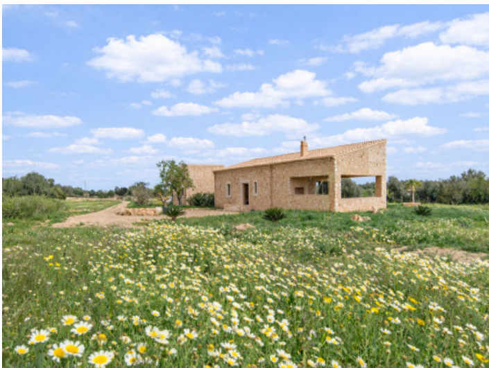
Authentic Mallorcan finca