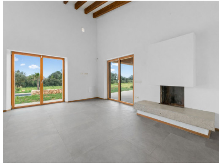
Living room with fireplace