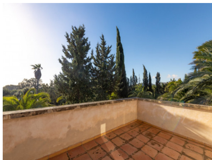
Private sun terrace

All information is correct to the best of our knowledge. Errors and prior sale excepted. This prospectus is purely for information purposes. Only the notarized deed of sale is legally binding.