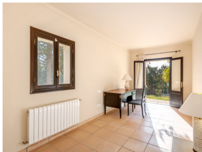
Upstairs - room with many possibilities