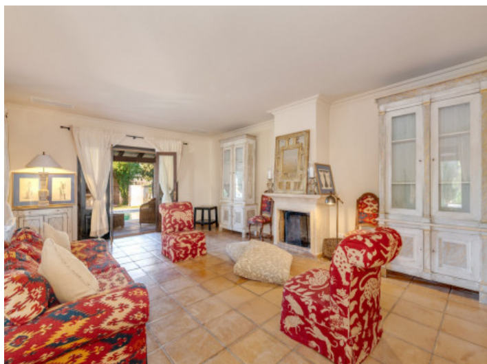
Living room with chimney