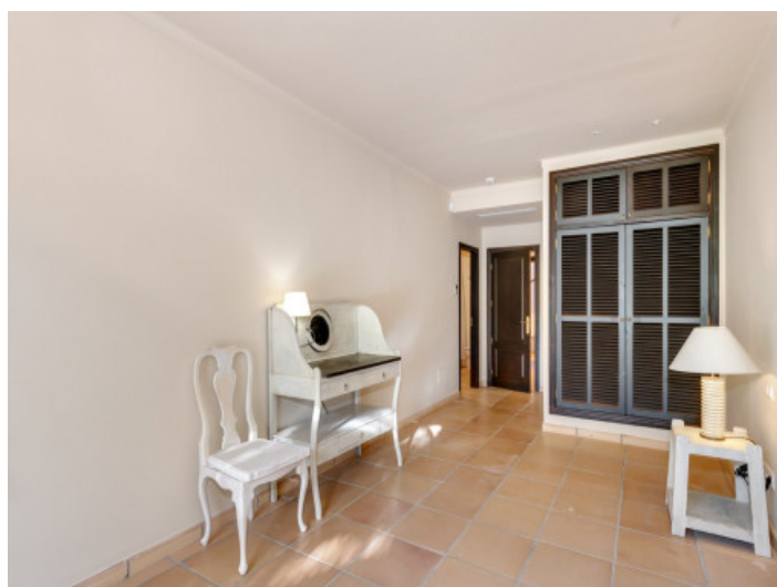
One of the three bedrooms on the groundfloor and built-in cupboard

All information is correct to the best of our knowledge. Errors and prior sale excepted. This prospectus is purely for information purposes. Only the notarized deed of sale is legally binding.