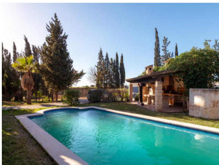
Pool and barbecue area

All information is correct to the best of our knowledge. Errors and prior sale excepted. This prospectus is purely for information purposes. Only the notarized deed of sale is legally binding.