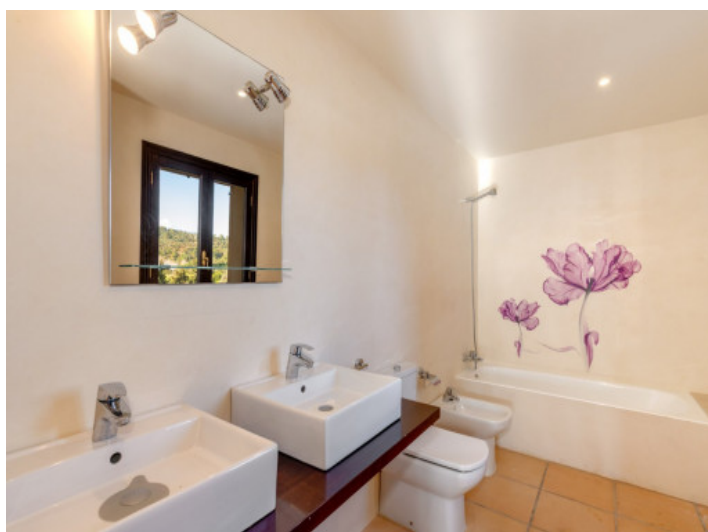
Bathroom en Suite with bathtub