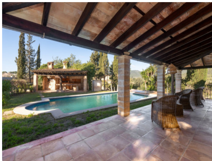
Covered porche with views over the pool and the landscape