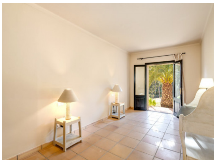
One of the three bedrooms on the groundfloor with access to the garden