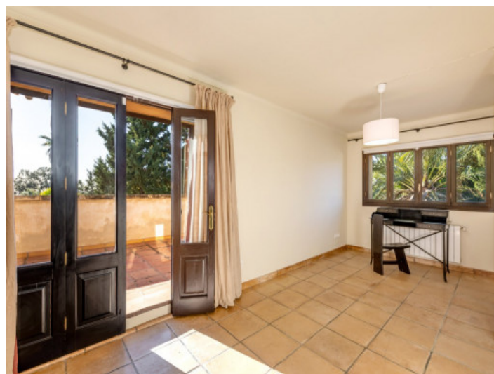
Bright room on the first floor