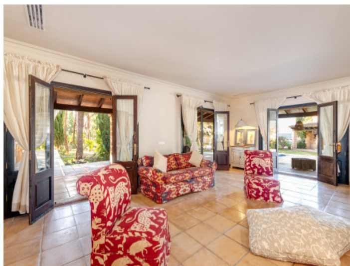
Bright and spacious living room