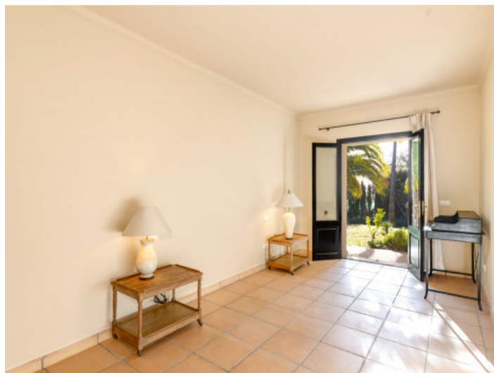
One of the three bedrooms on the groundfloor with access to the garden