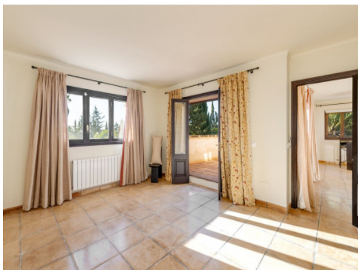
Master-bedroom with 30 sqm terrace