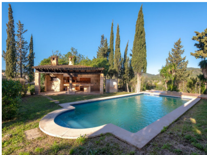
Garden, pool, views and barbecue