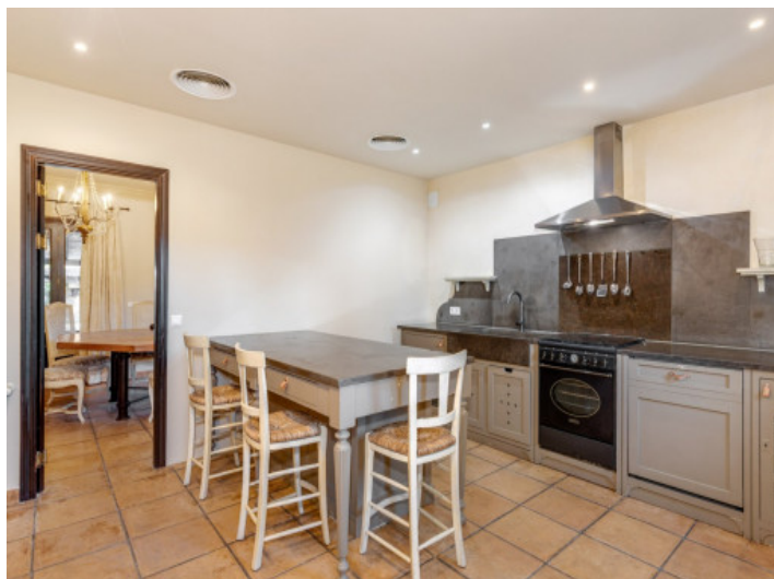
Modern kitchen with breakfast table