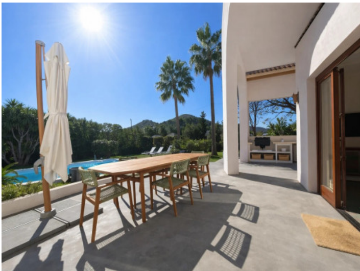
Poolside dining terrace