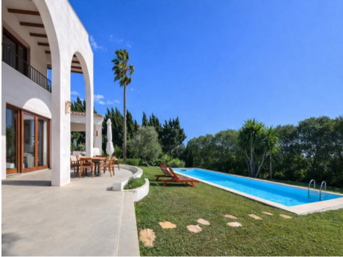
Sunlit pool and garden