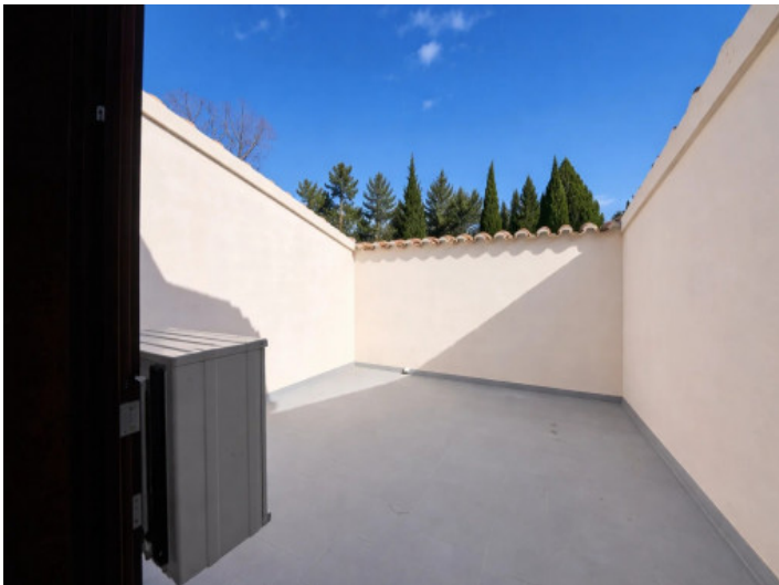
Private rooftop terrace