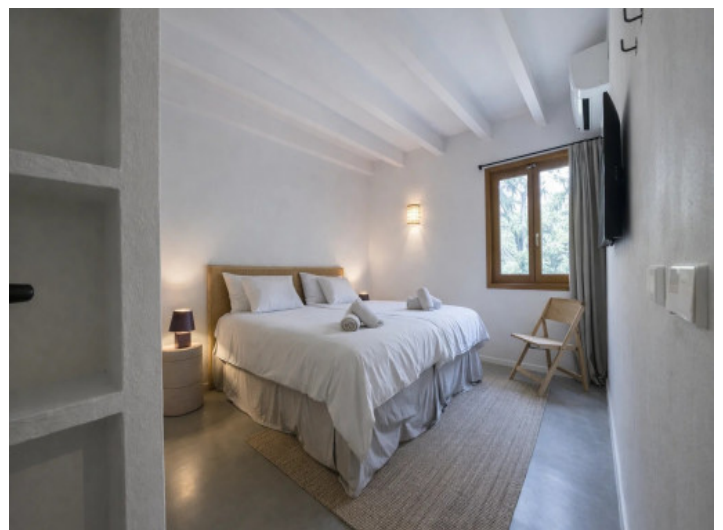
Bedroom with wardrobes

All information is correct to the best of our knowledge. Errors and prior sale excepted. This prospectus is purely for information purposes. Only the notarized deed of sale is legally binding.