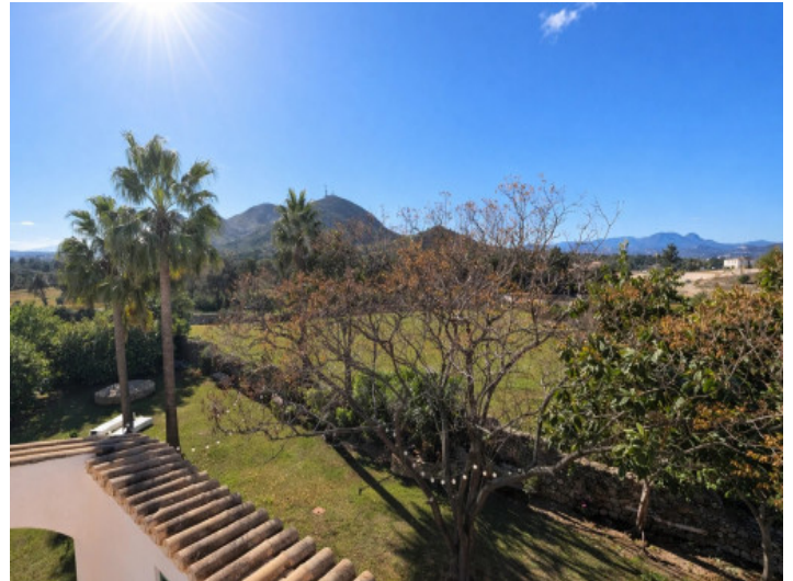
Countryside and mountain views