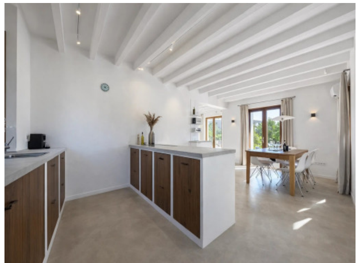
Modern kitchen with island

All information is correct to the best of our knowledge. Errors and prior sale excepted. This prospectus is purely for information purposes. Only the notarized deed of sale is legally binding.