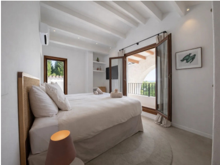
Bedroom with balcony