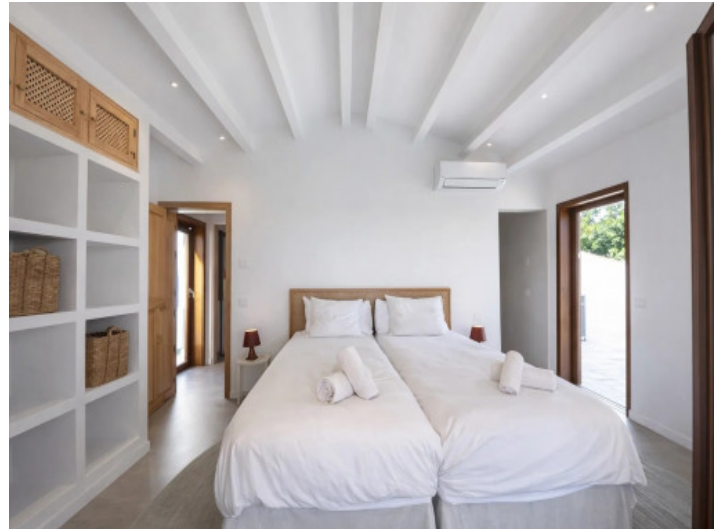
Bedroom with terrace access