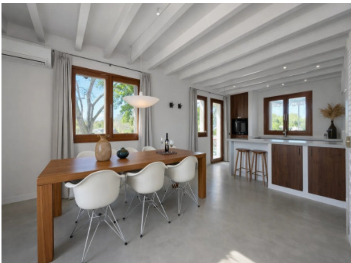
Open-plan kitchen and dining