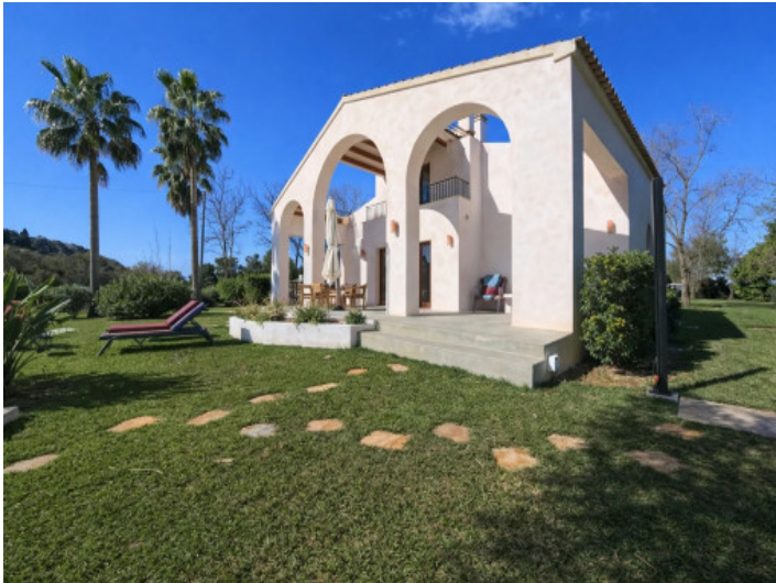
Arched facade and garden