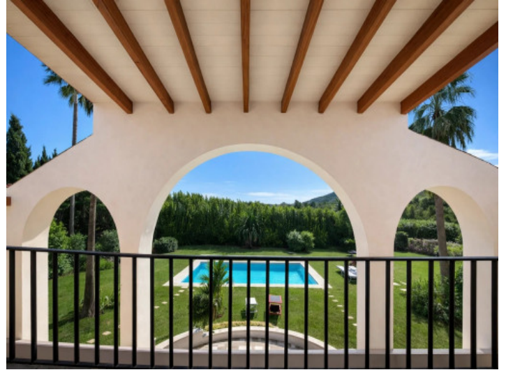
Balcony view over pool and garden