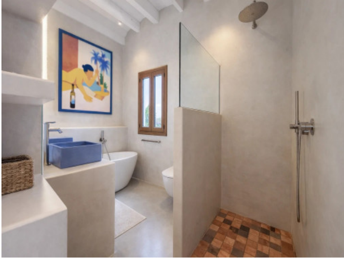
Spacious bathroom with tub and shower