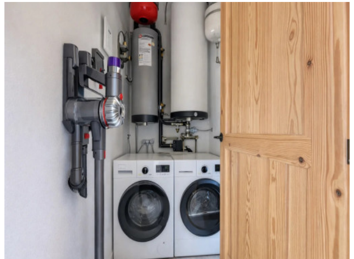
Laundry / utility room

All information is correct to the best of our knowledge. Errors and prior sale excepted. This prospectus is purely for information purposes. Only the notarized deed of sale is legally binding.