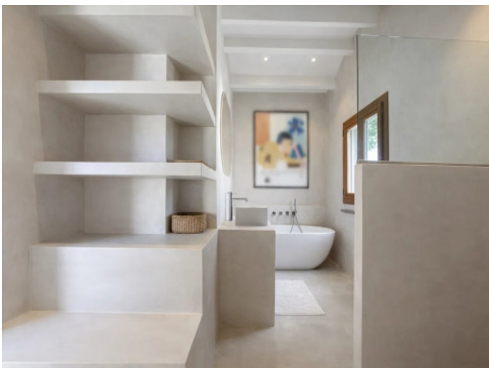
Bathroom with bathtub and shelving