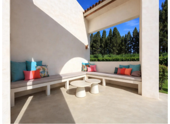
Covered outdoor lounge