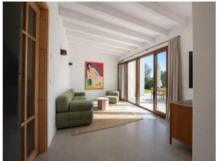
Living room with terrace access