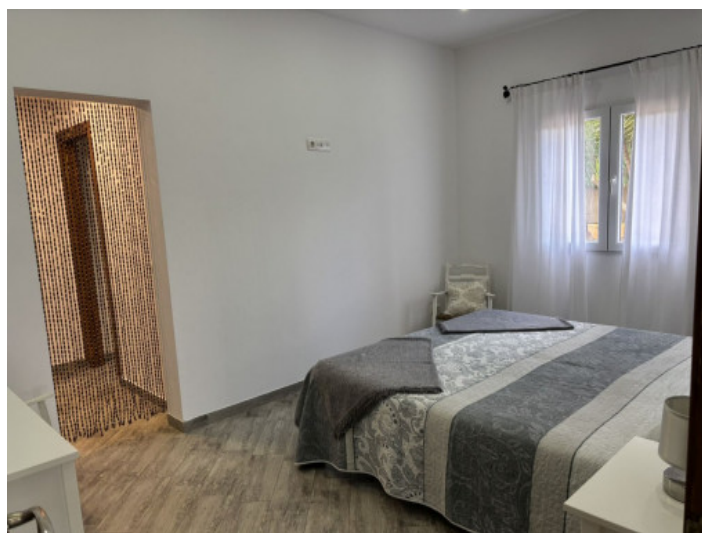
Bedroom with double bed, dressing area and en-suite bathroom