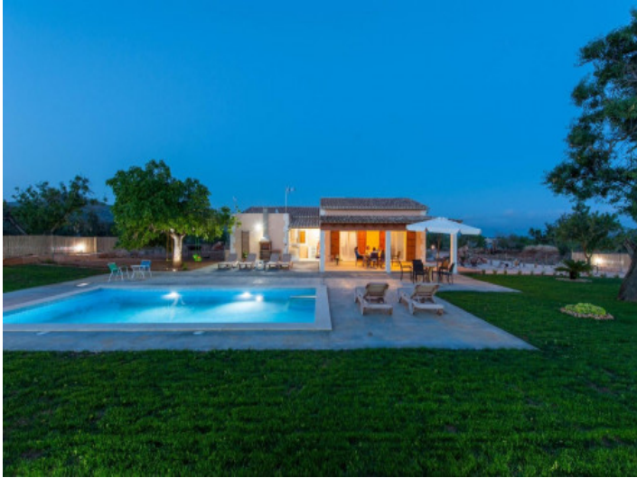
Exterior view with pool at night