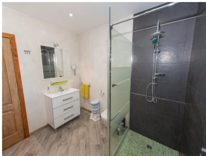
Spacious bathroom with shower