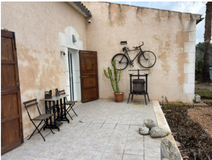
Terrace with seating area