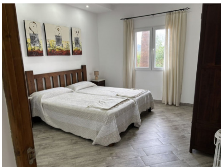
Third bedroom with double bed

All information is correct to the best of our knowledge. Errors and prior sale excepted. This prospectus is purely for information purposes. Only the notarized deed of sale is legally binding.