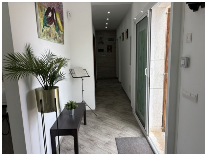
Bright entrance area