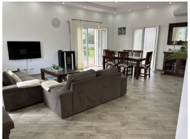
Open living and dining area

All information is correct to the best of our knowledge. Errors and prior sale excepted. This prospectus is purely for information purposes. Only the notarized deed of sale is legally binding.