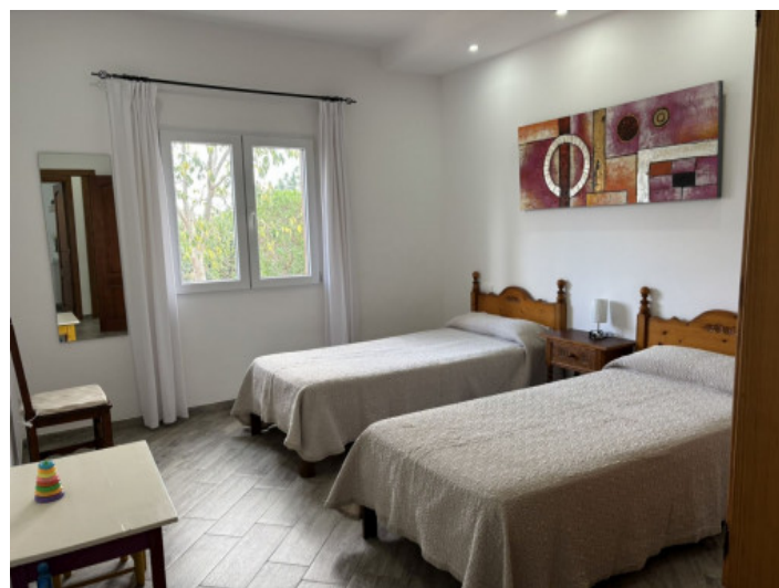
Bedroom with two single beds