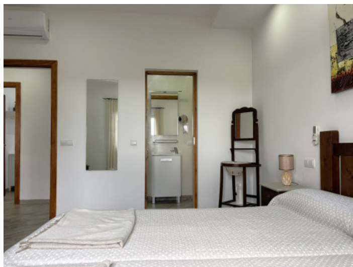
Bedroom with en-suite bathroom

All information is correct to the best of our knowledge. Errors and prior sale excepted. This prospectus is purely for information purposes. Only the notarized deed of sale is legally binding.