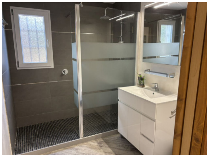
Bathroom with shower