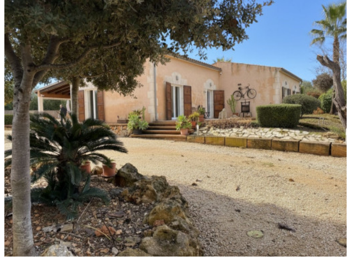
House façade with driveway