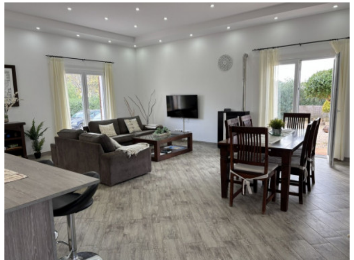
Spacious living and dining area with access to the terrace