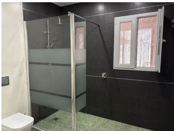
Elegant shower room