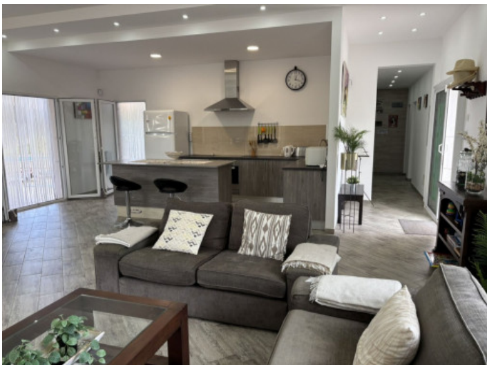
Open-plan kitchen and living room