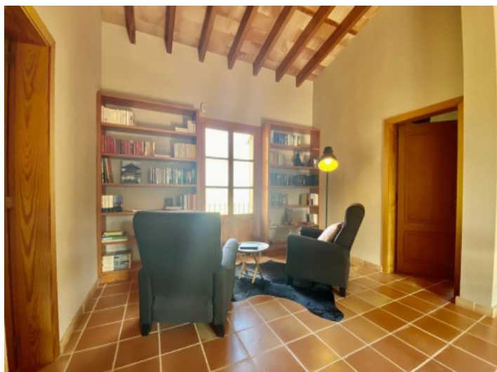
Separate sitting area