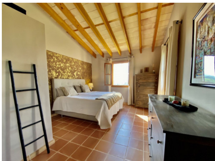
Noble double bedroom