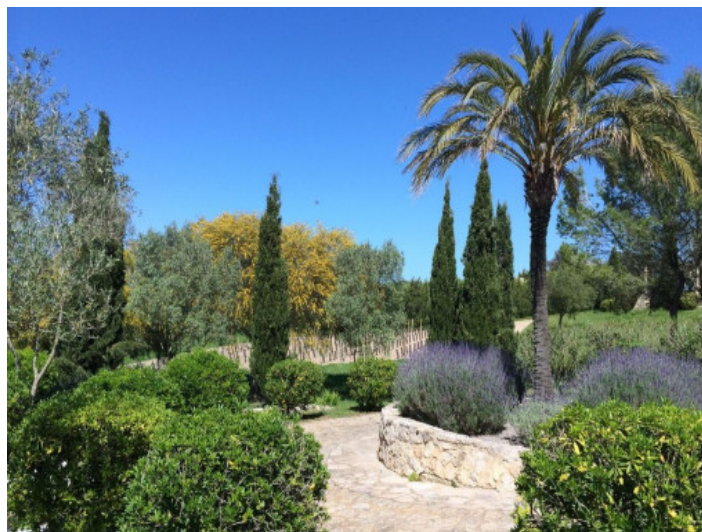
View of the garden