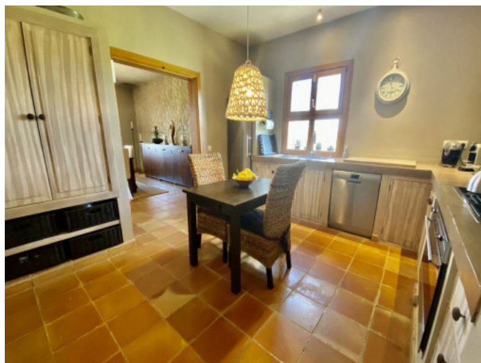
View of the kitchen

All information is correct to the best of our knowledge. Errors and prior sale excepted. This prospectus is purely for information purposes. Only the notarized deed of sale is legally binding.