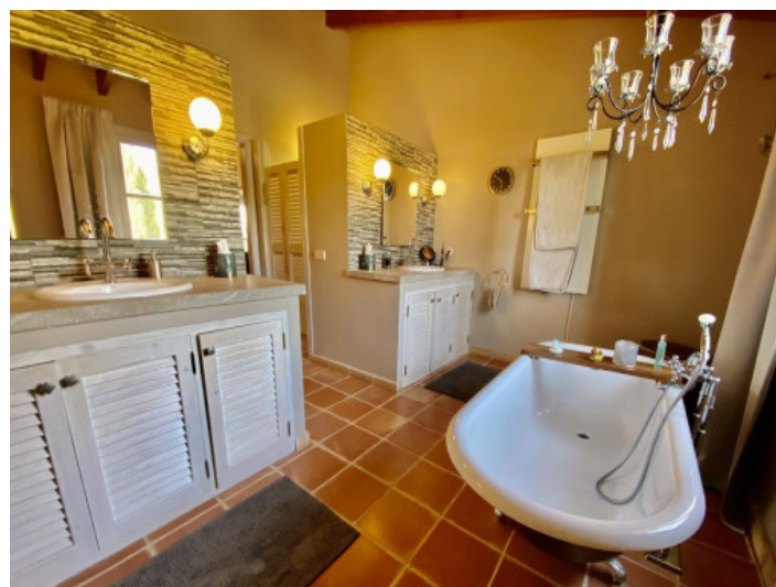
Bathroom with bath tub