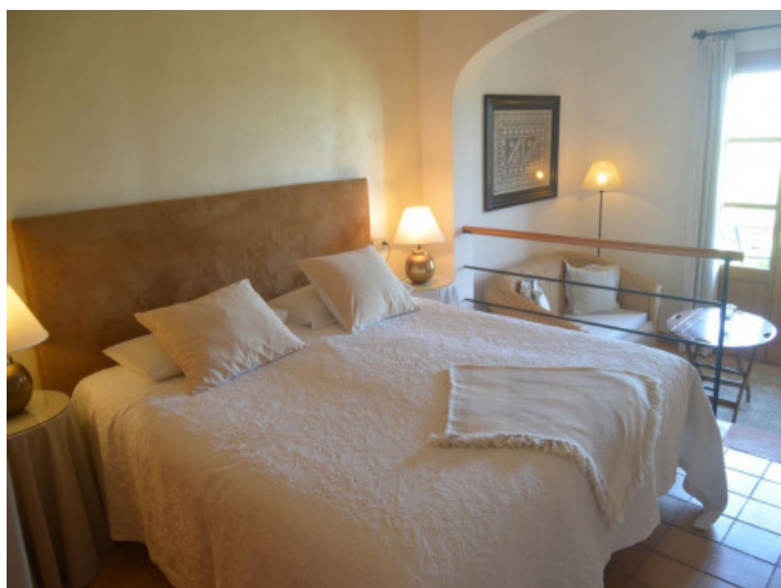
One of 11 bedrooms