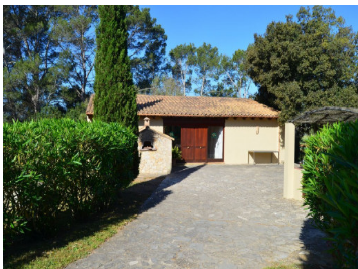
View of the garden