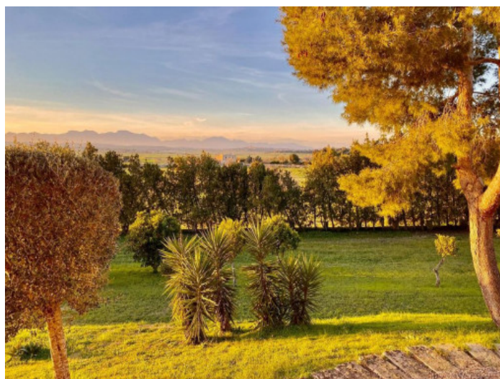
Idyllic landscape views

All information is correct to the best of our knowledge. Errors and prior sale excepted. This prospectus is purely for information purposes. Only the notarized deed of sale is legally binding.