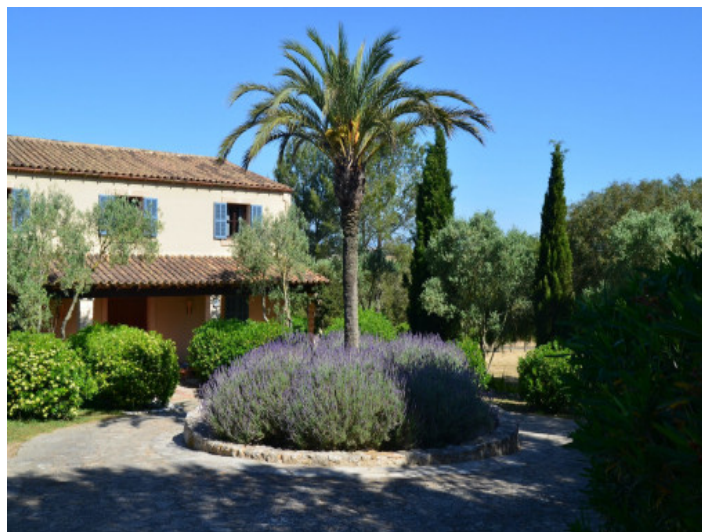
Exterior view of the finca