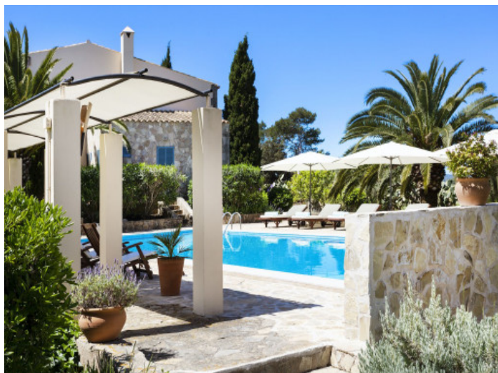
Inviting pool area with sun loungers