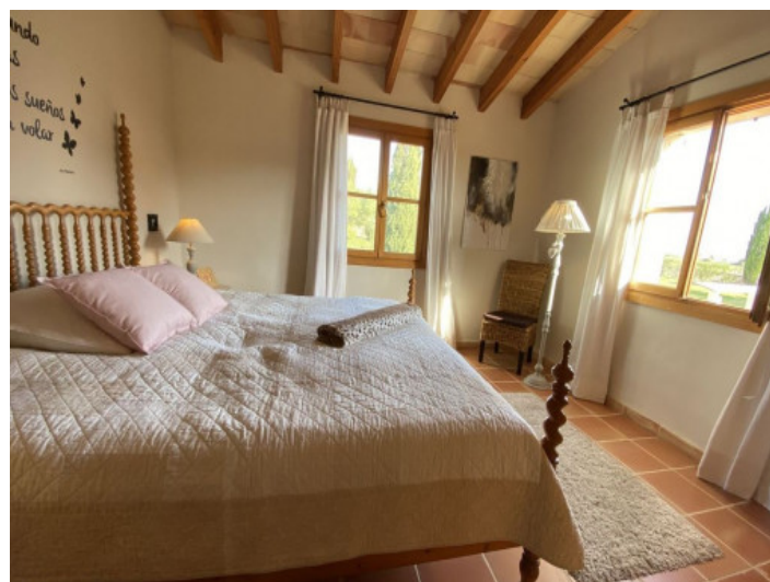
One of 11 bedrooms