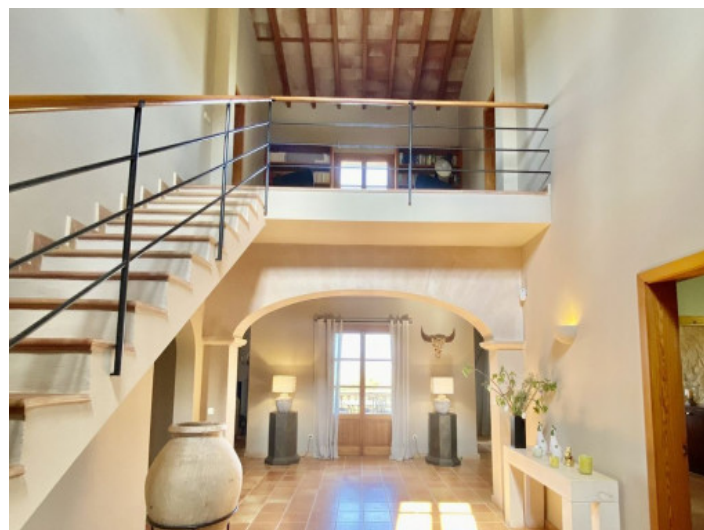
Impressive entrance area

All information is correct to the best of our knowledge. Errors and prior sale excepted. This prospectus is purely for information purposes. Only the notarized deed of sale is legally binding.