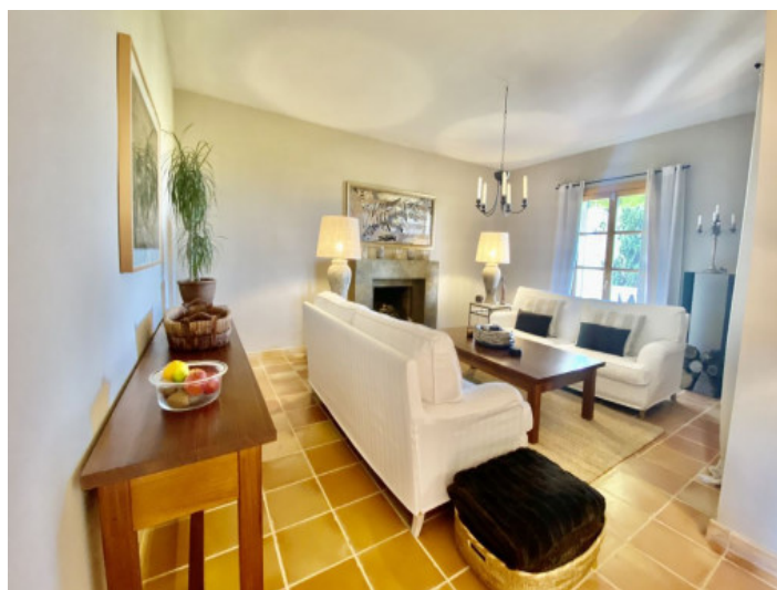
Cozy living area