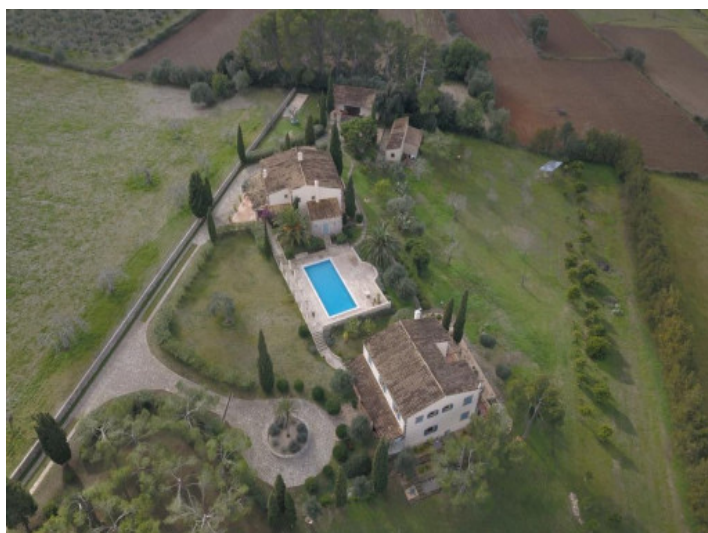
The finca from a birds-eye view