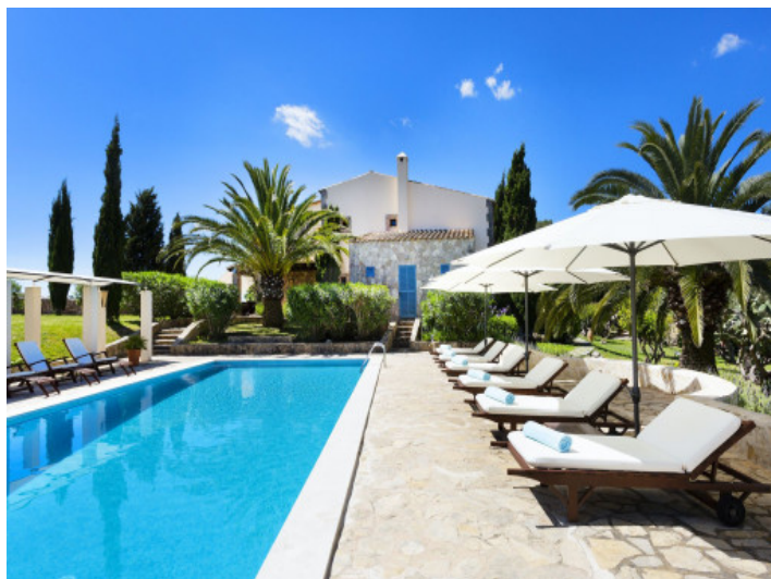
Inviting pool area with sun loungers